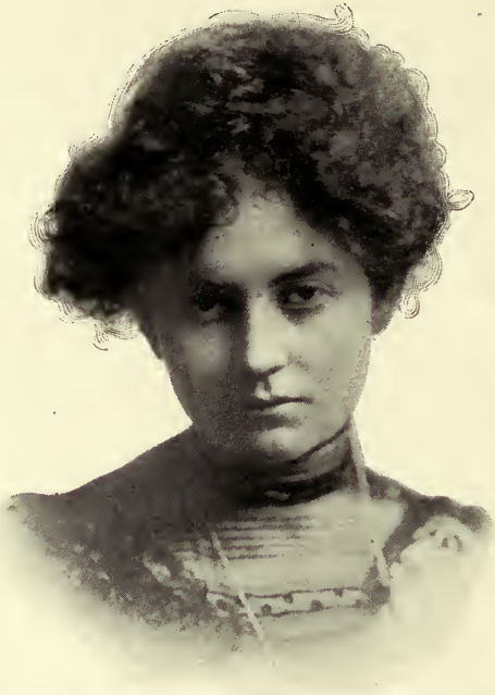
Mary Mac Lane