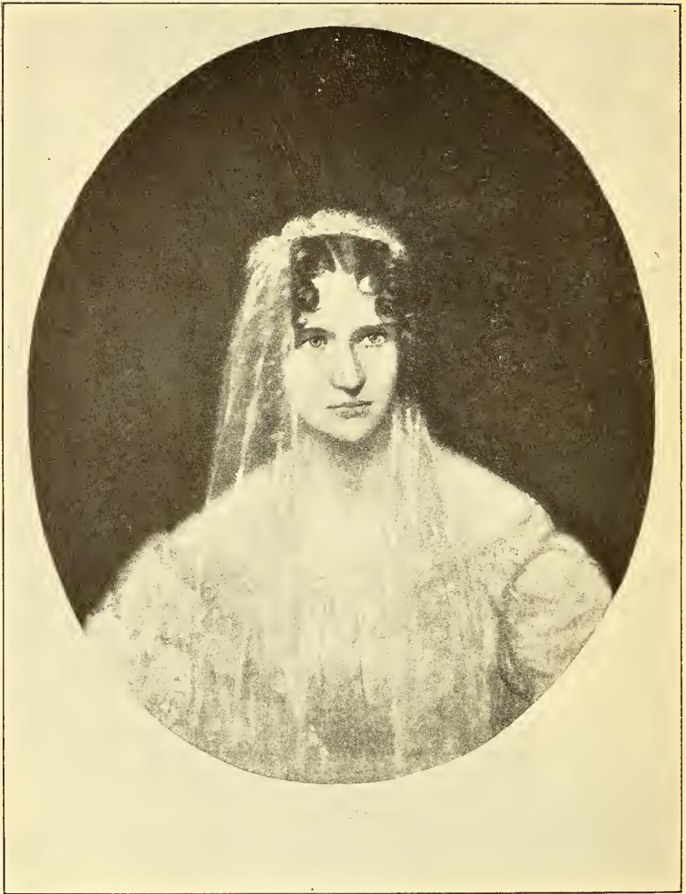
SARAH HELEN WHITMAN