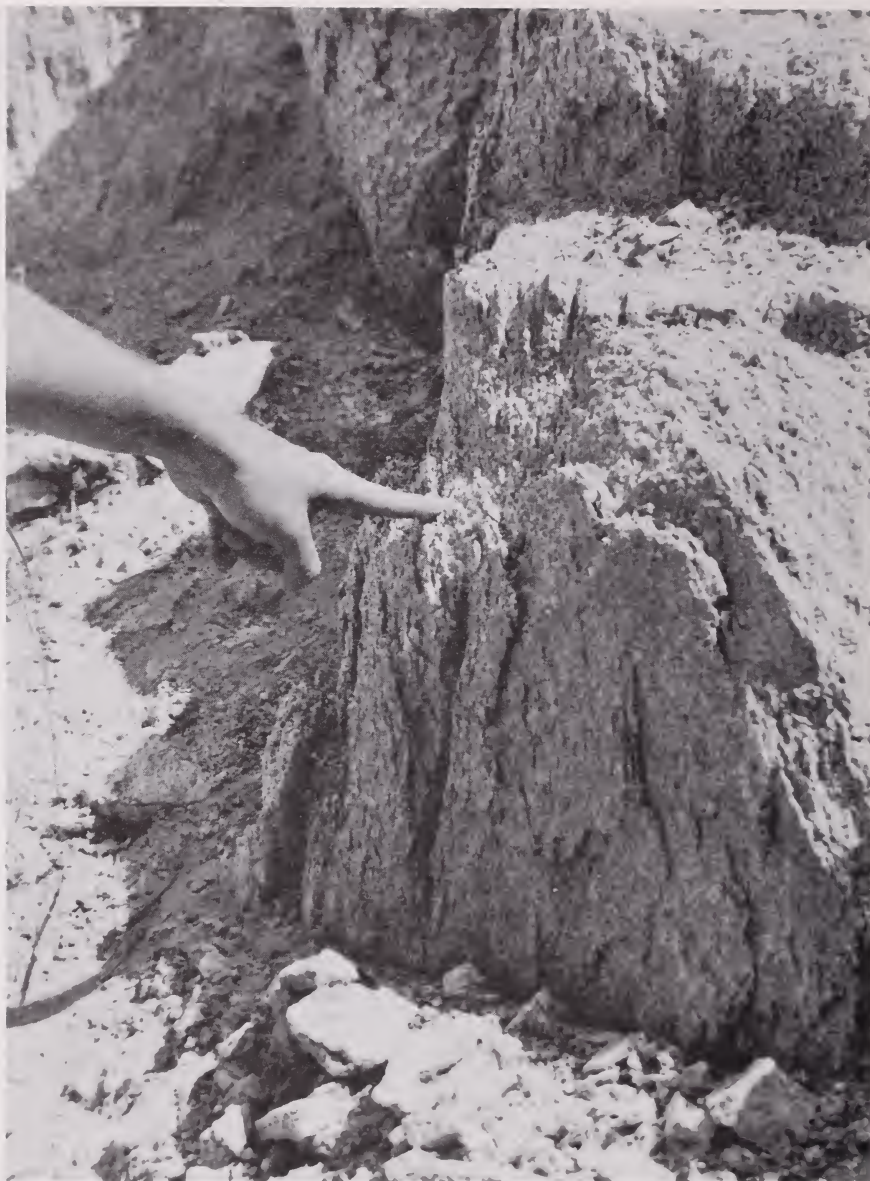
Figure 7.--Weathering class 5, fracture density class 3. This figure shows the weathering phenomenon known spalling. Note that spall rinds have broken from and lie below the rock. Rinds are easily broken by hand to grus. Roots are confined to joints and fractures in these rocks. Joints are indistinct and rounded.