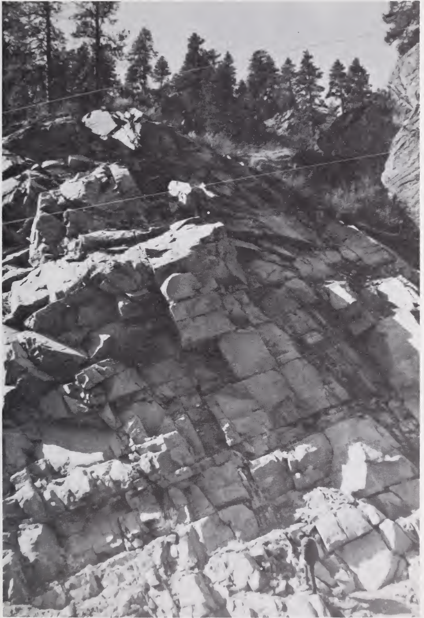
Figure 2.--Weathering class 1, fracture density class 2. This rock is unweathered and slightly fractured. Very little sediment is produced from this site.