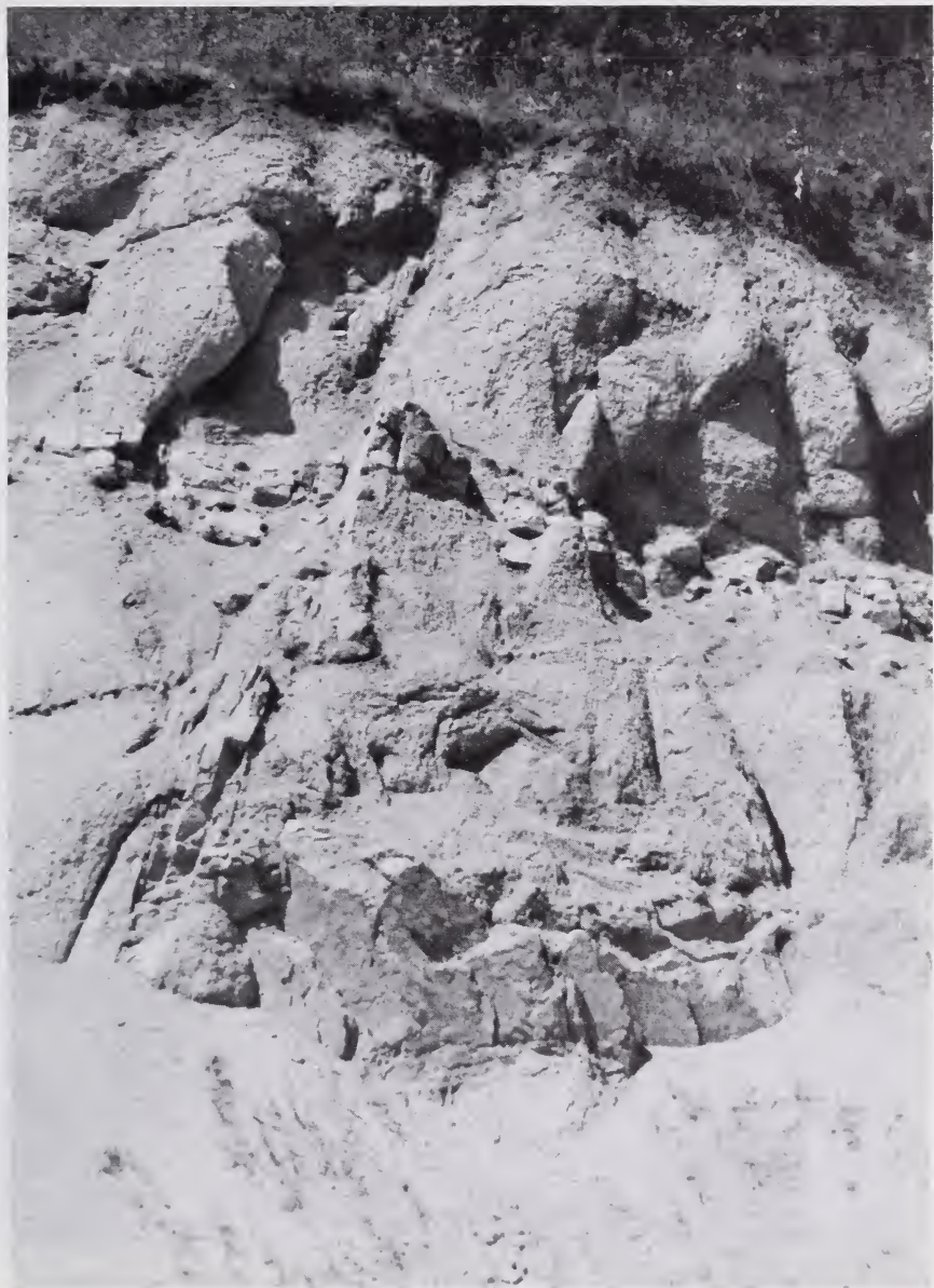
Figure 6.--Weathering class 5, fracture density class 3. Contrast the less distinct and more rounded rock edges shown with those of figure 5. Also note the accumulation of sediment below the road cut. Clearly visible is the pegmatite dike that cuts horizontally through the quartz monzonite bedrock.