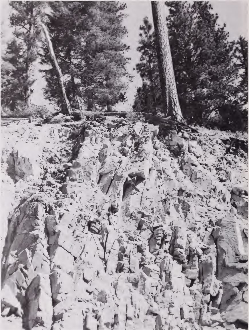
Figure 3.--Weathering class 2, fracture density class 5. This rock is very well fractured, but only weakly weathered. The road cut is quite stable and will not produce much sediment. Occasional rock fragments may fall to the road below. This rock is highly permeable to water. (Vertical direction of joint planes aids infiltration.) Roots can be found at great depths.