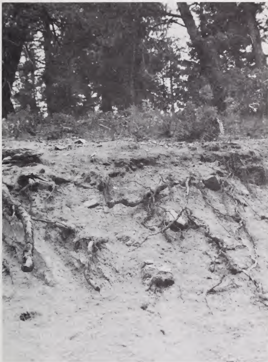
Figure 8.--Weathering class 6. Note the soft appearance and ease of root penetration. The original structure of the bedrock is obliterated and no fracture class can be assigned. Weathering class 7 rock is similar in appearance, but the plastic nature of that rock class is quite obvious upon hand inspection.