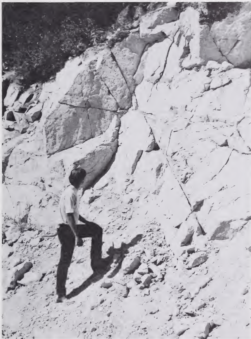
Figure 4.--Weathering class 2, fracture density classes 2 and 3. This rock is weakly weathered and only slightly to moderately fractured. Little sediment is produced. Permeability rates are lower than in figure 3, and a potential exists for overland flow on a saturated soil mantle underlain by this massive rock.