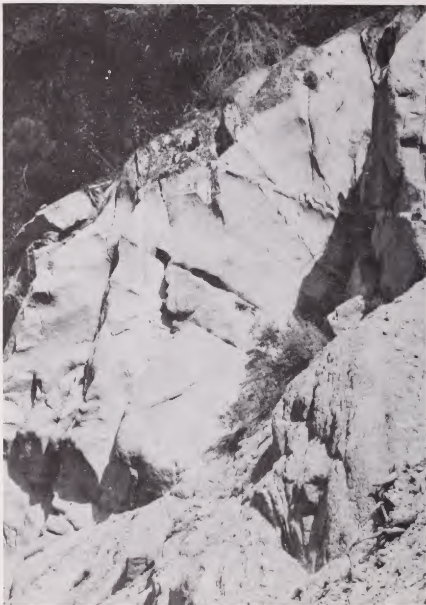
Figure 5.--Weathering class 4 (weakly spalling), fracture density class 2. The subangular to rounded appearance is in distinct contrast to the angular jointing pattern pictured in figure 4, and is a result of weathering by granular disintegration.