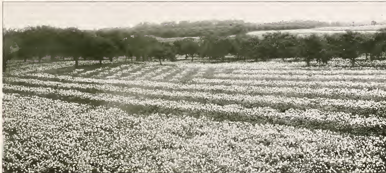
MAMMOTH AMERICAN FLAG OF GROWING ASTERS ON OUR FARM AT OGDEN, N. Y.

JAMES VICK'S SONS — ROCHESTER — THE FLOWER CITY