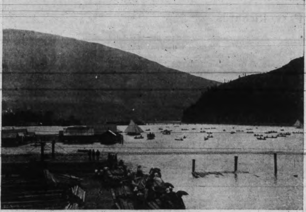
The West Arm of Kootenay Lake at Nelson, Looking Southwest From the City Wharf.

The other view, the West Arm of Kootenay Lake, shows the water-front looking southwest from the City wharf, where the boat races could finish.