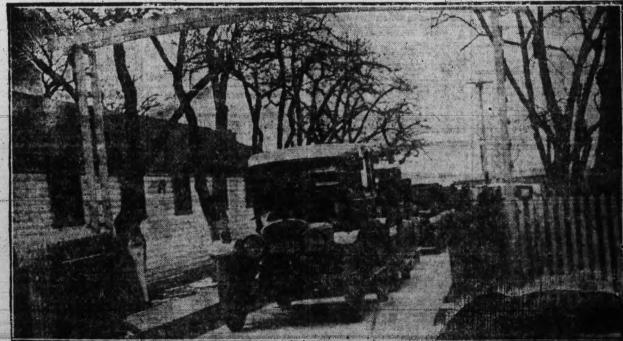
Scene at the funeral of L. B. Steel in Buffalo, March 24.—The photograph was rushed by aeroplanes from Buffalo to Toronto, in time for reproduction in the latter city the same evening.