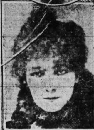
At the right is the last photograph taken of Madame Sarah Bernhardt, as she appeared in "La Gloire" in Paris, just previous to her last illness. At the upper left is a picture taken during her last tour of America in 1916. Lower left, a picture taken at the age of 42.