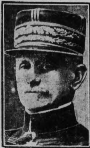
Gen. Manoury former military governor of Paris, is dead.