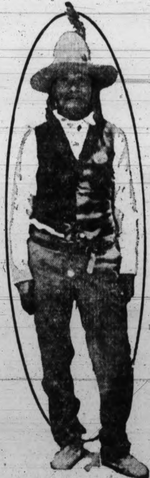
Chief Posey shown here, is the leader of the renegade Plutes who rose against the whites near Salt Lake City, Utah. He's now making a desperate stand for his life in the Utah mountains.