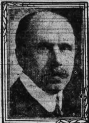
President of the Canadian Branch of the Royal Caledonia Curling Club, whose work is much admired at the close of the busiest season on record.