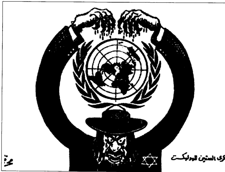
Akhar al-Khalij (Bahrain), January 2005