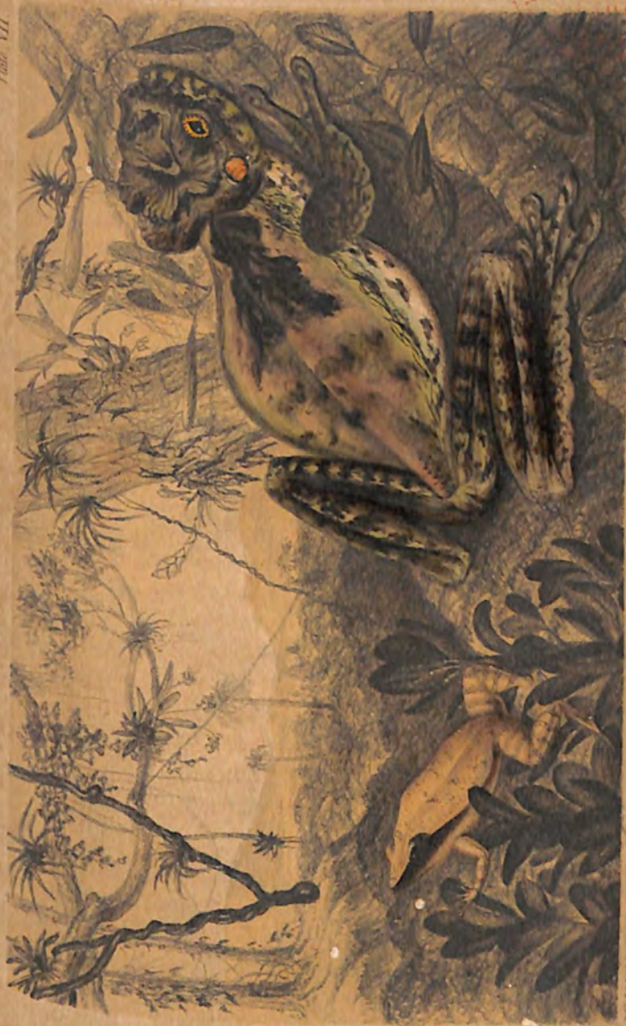
LITORIA LUTEOLA N. S.