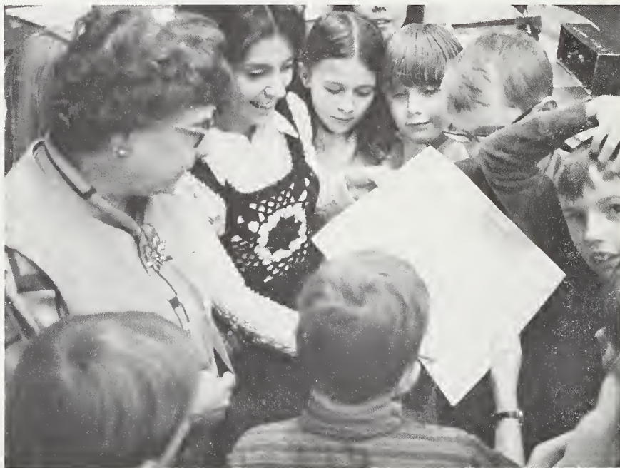
Above, two intermediate teachers discuss the basic principles of budgeting with 4-H special project students. At right, a teacher explains to the "4-H Money World" project members some of the many things that will be covered during the 10-week period.

Members who enrolled in the project received a project member's book and a budget record book. The teachers used these to provide information