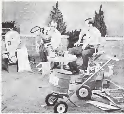
Extension's Chicago-based entomologist, Stanley Rachesky, left, appears on a television interview show to demonstrate equipment for controlling yard and garden pests.

The charts show greatly increased requests on specific topics immediately following appearances on popular radio or television stations at prime time in which information and help on that particular subject was offered.