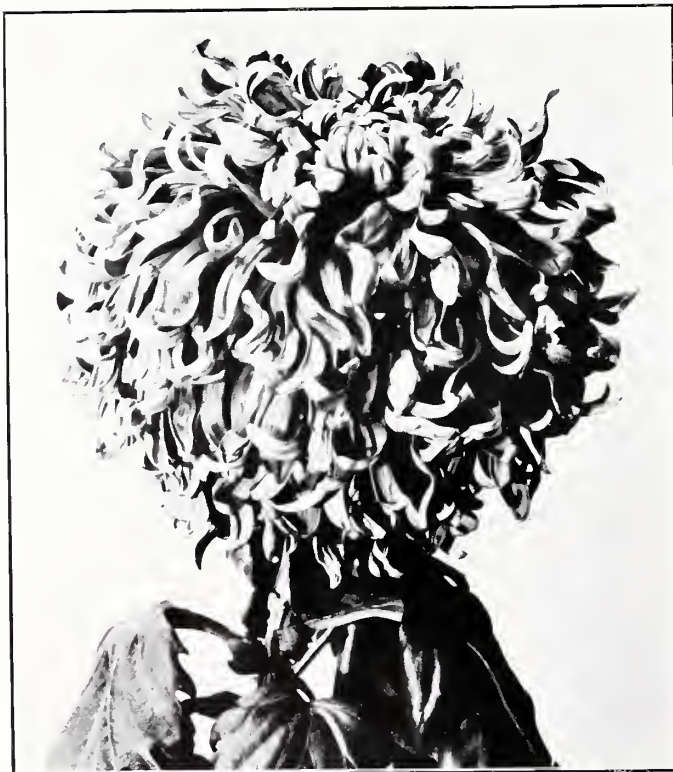
Marian H. Uffinger

Splendid incurving white of satin texture. A big flower, stiff stem, perfect foliage.