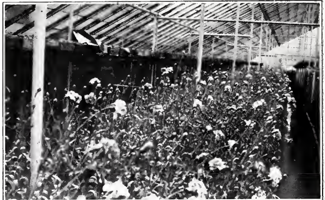
A house of Marjorie

A white that we still prefer to any other on the market. The flowers are deeply serrated and have a spicy odor. The variety produces a good crop early and is very free. It is an easy grower and a good keeper.