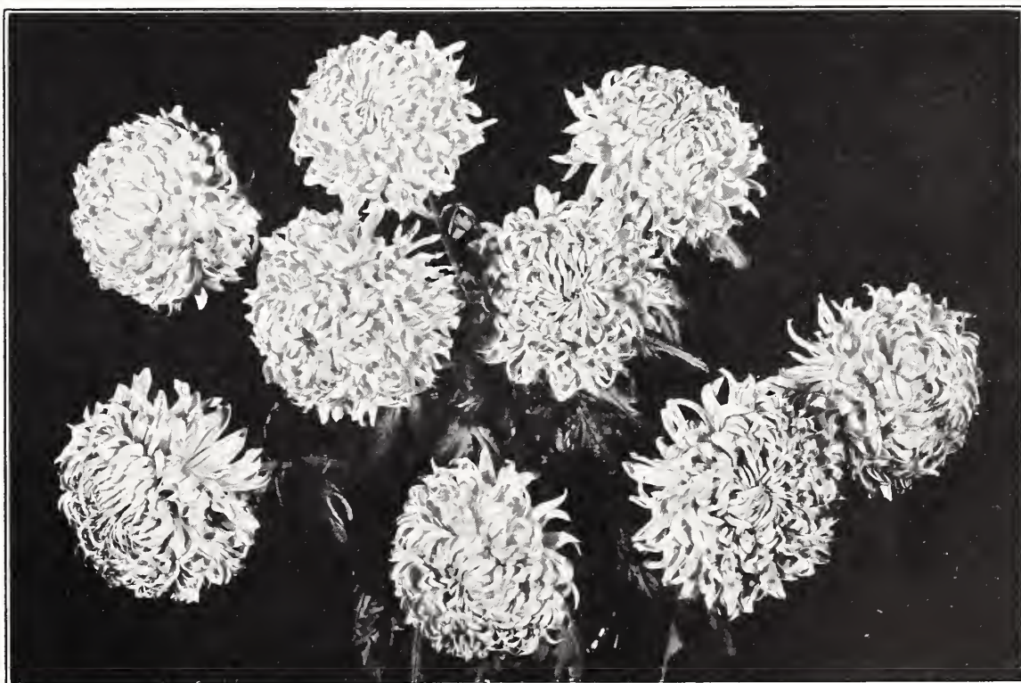
Mrs. Walter J. Engel

25 cuttings at the 100 rate; 250 cuttings at the 1,000 rate.