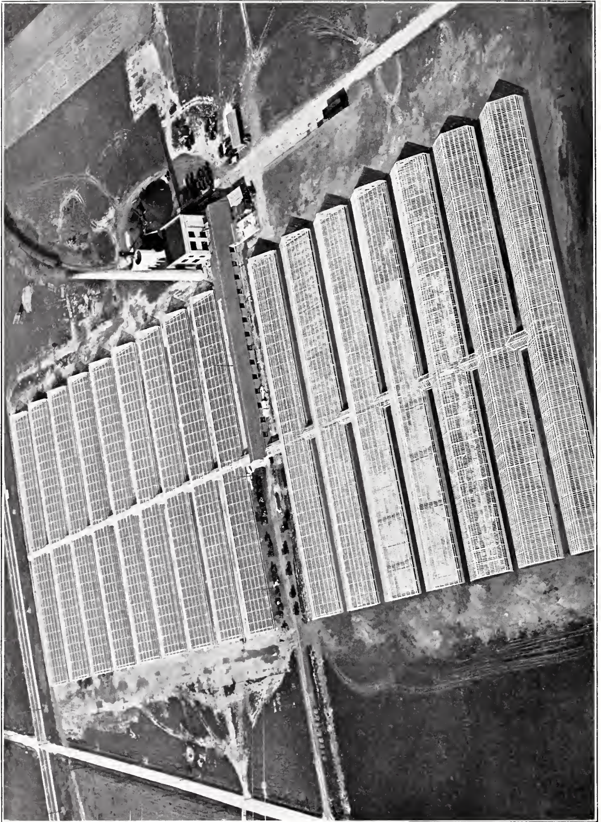
Aeroplane view West Range Jos. H. Hill Co.