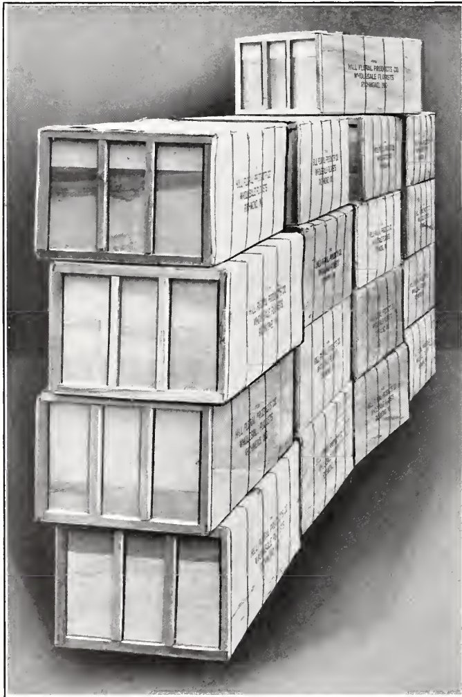
Note the light, sturdy boxes used in packing plants for express shipments.