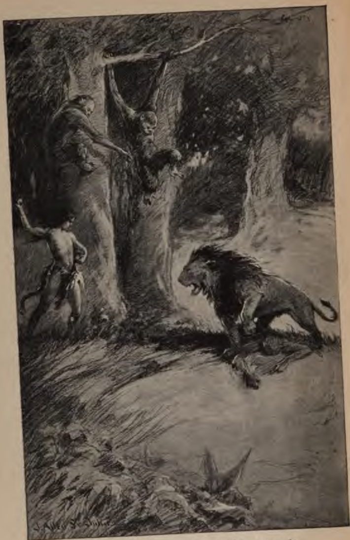
Tarzan foils Numa, Lord of the Jungle