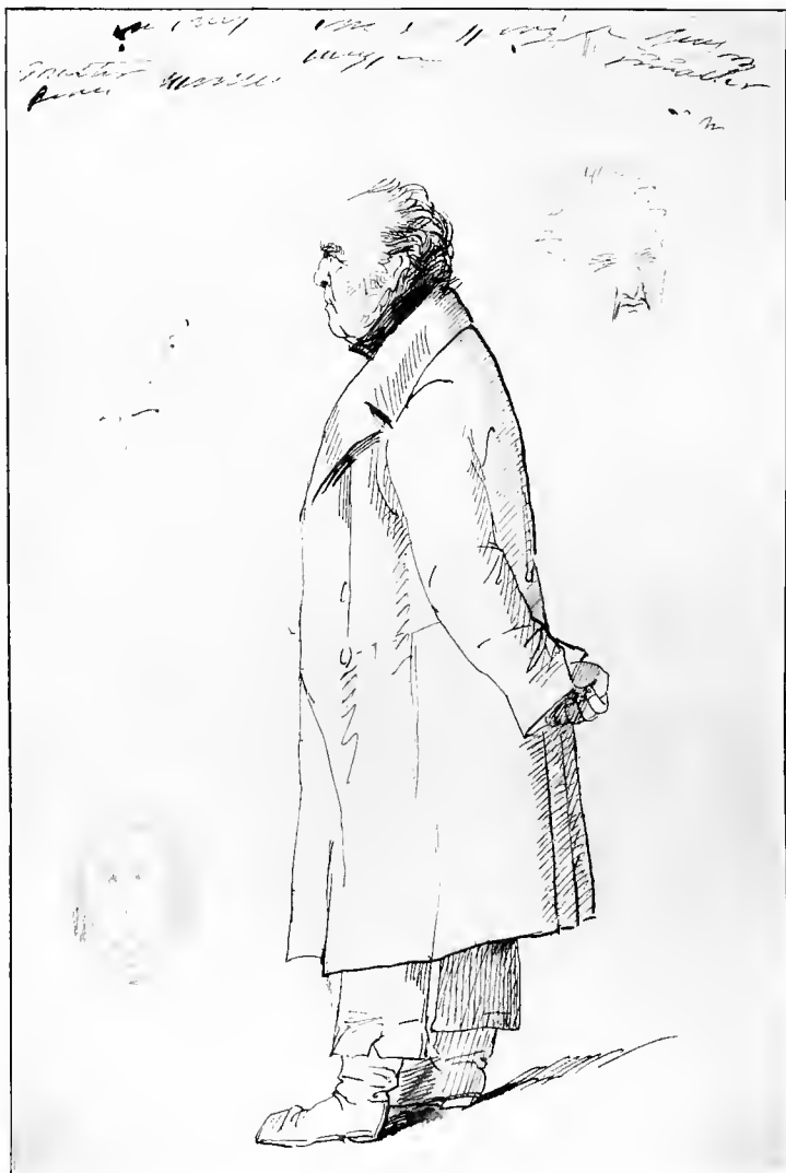
WALTER SAVAGE LANDOR