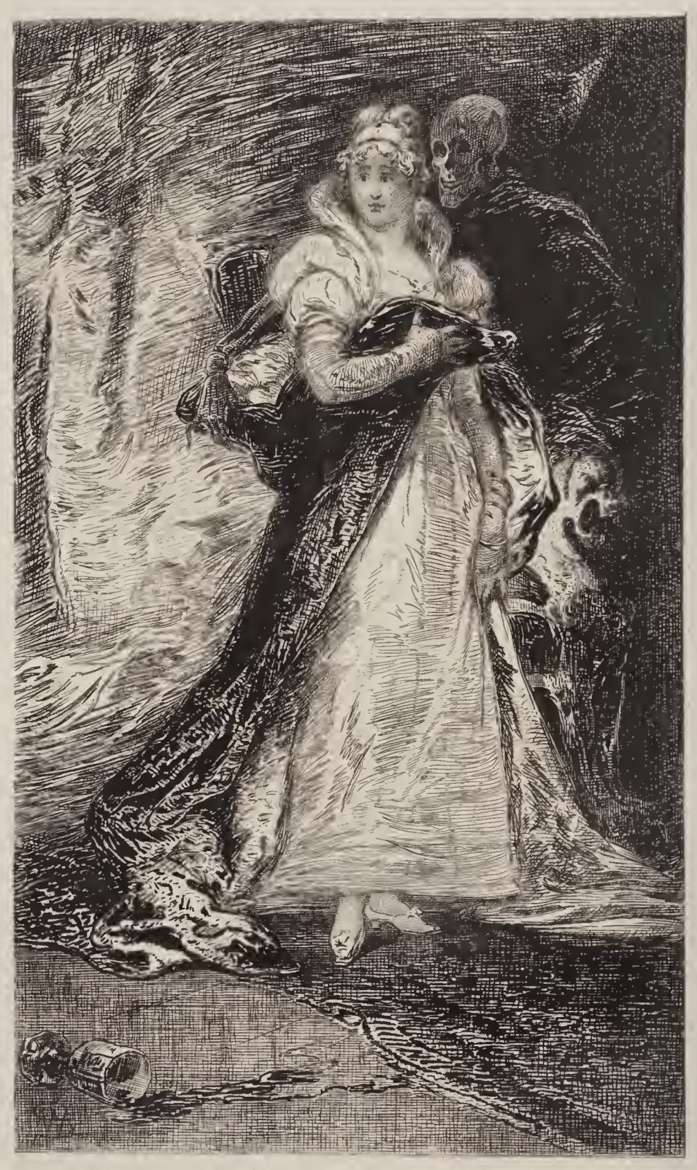
Lady Eleanore's Mantle.