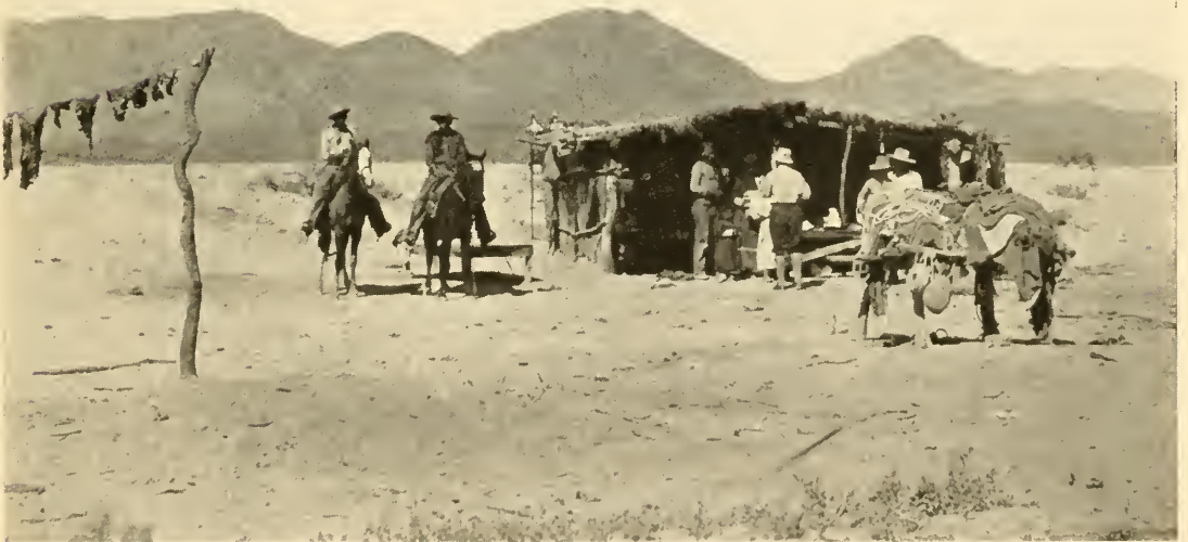
FIG. 2.—AN INDIAN HABITATION BETWEEN THE HARDY RIVER AND THE COCOPAH MOUNTAINS. THE WALLS AND ROOF OF THE STRUCTURE ARE MADE OF ARROWWEED. AT THE LEFT, A SUPPLY OF BEEF IS SUSPENDED FROM A LINE TO BE SUN-CURED OR "JERKED".