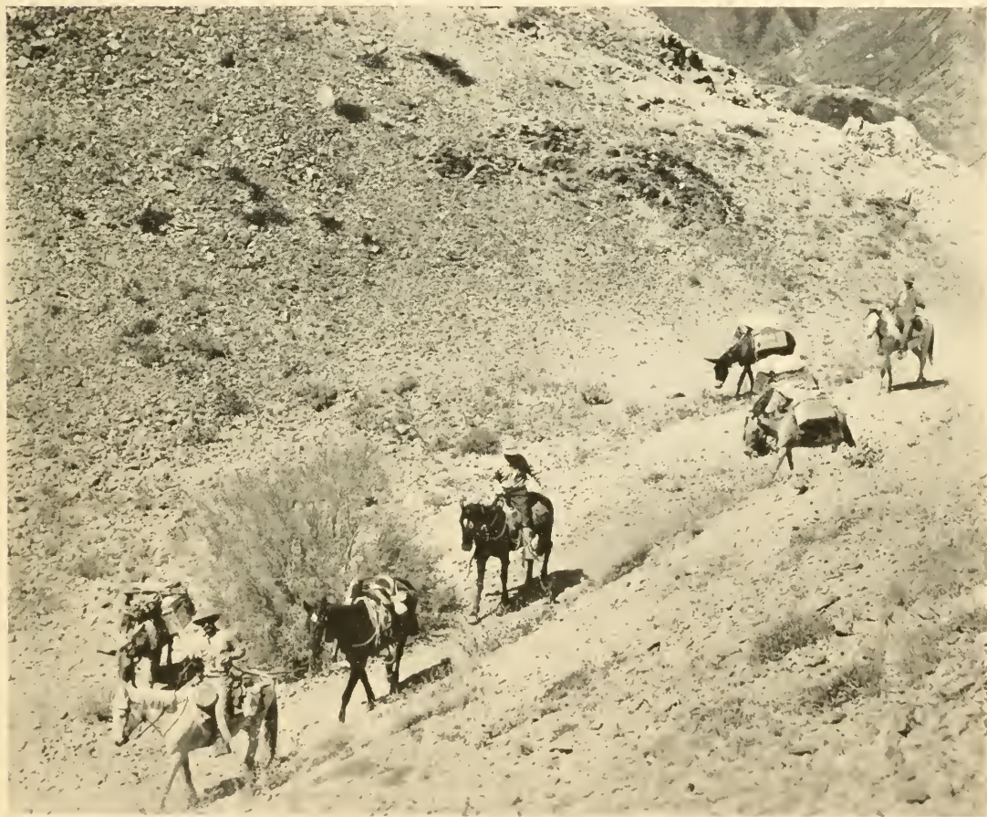
FIG. 2.—CROSSING A SPUR OF THE COCOPAHS, MARCH 31, 1915.