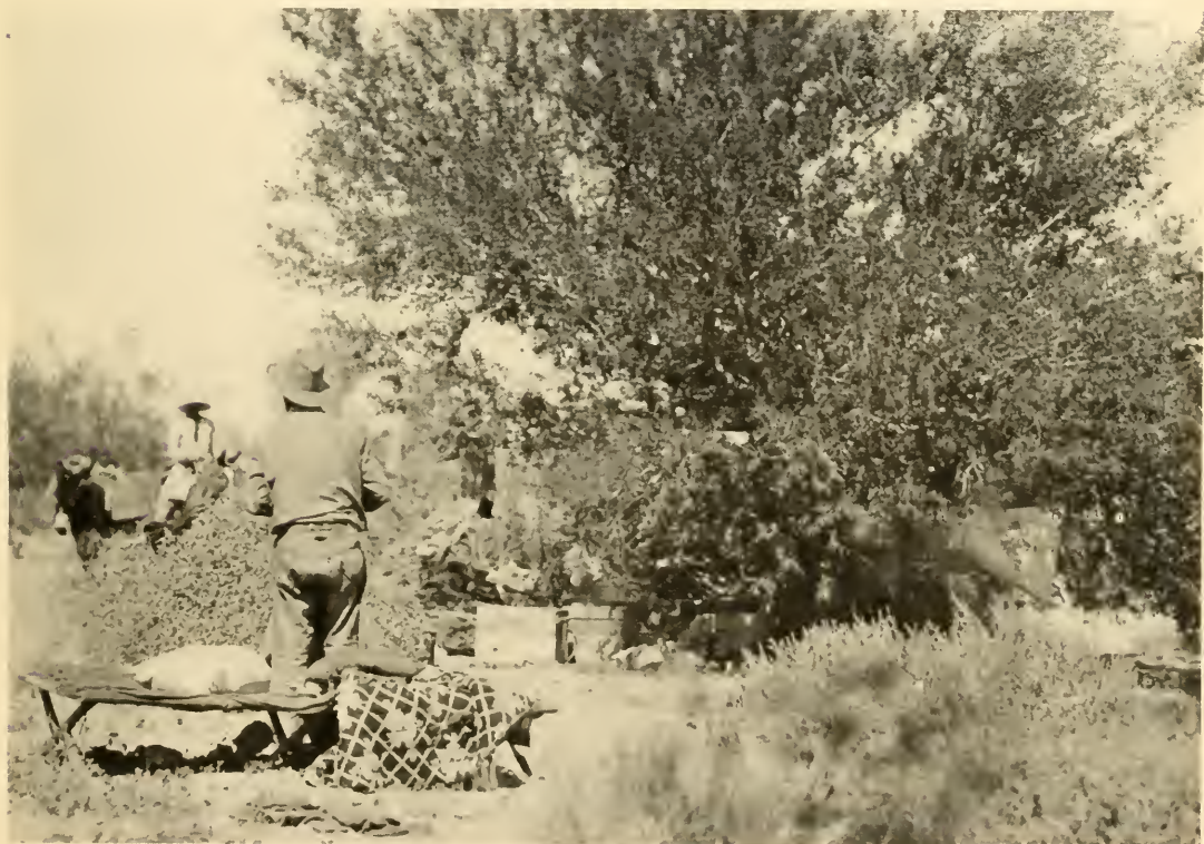
FIG. 2.—A LARGE AND LUXURIANT MESQUITE OF THE UPPER WASH ASSOCIATION, APPROXIMATELY SEVEN MILES SOUTHWEST OF THE TRES POZOS. SUCH TREES ARE CHARACTERISTIC OF PRACTICALLY THE WHOLE DETRITAL OUTWASH EAST OF THE TINAJA MOUNTAINS.