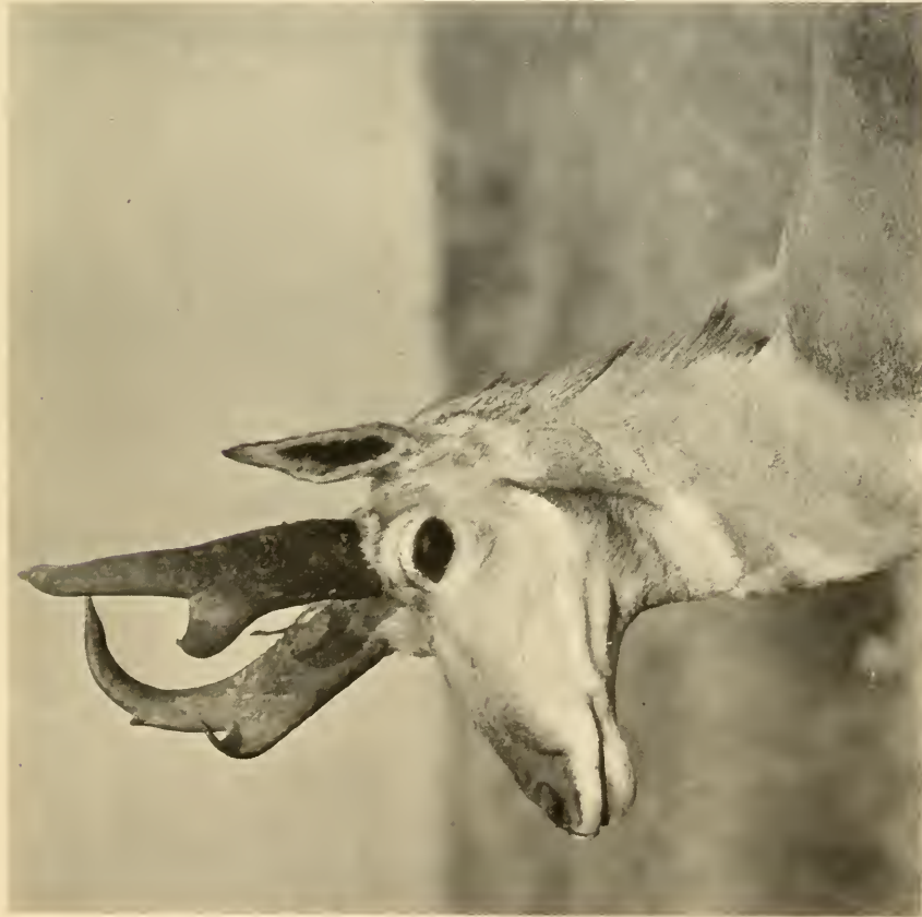
FIG. 1.—HEAD OF A MOUNTED PRONGHORN BUCK, SHOT IN PATTIE BASIN IN MARCH, 1917, AND NOW IN THE BROOKLYN MUSEUM. THE CONDITION OF THE PRONGS, WHICH BEND SHARPLY TOWARD THE MID-LINE, AND THE PRESENCE OF A SUPPLEMENTARY PRONG ON THE RIGHT HORN, ARE NOTEWORTHY.