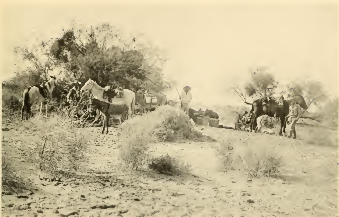
FIG. 1.—NOONDAY CAMP AT THE TRES POZOS OASIS, APRIL 1, 1915. THE TREES ARE HALF DEAD MESQUITES, BEARING MASSES OF MISTLETOE. THE LOW VEGETATION IN THE FOREGROUND IS PROBABLY Atriplex lentiformis .