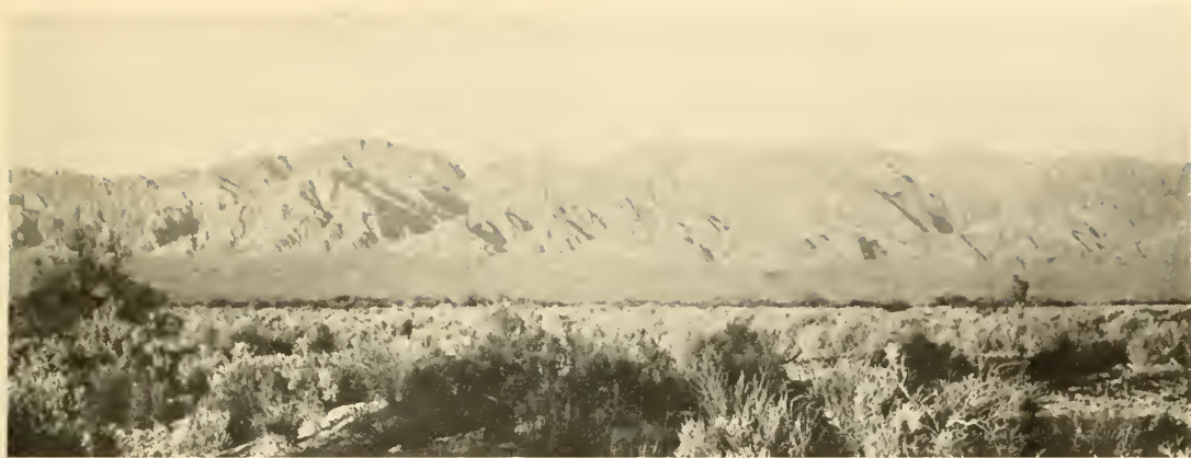
FIG. 1.—THE COCOPAH RANGE, VIEWED FROM NEAR THE BANK OF NEW RIVER. THE CHARACTERISTIC DETRITAL SLOPES (WASH ASSOCIATION) SHOW DISTINCTLY. THE VEGETATION IN THE FOREGROUND IS MAINLY SALTBUSH ( Atriplex polycarpa ).