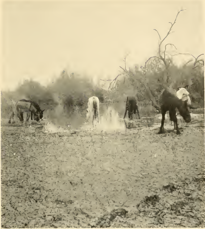
FIG. 1.—HORSES AND BURROS DRINKING FROM HARDY'S COLORADO DURING THE PERIOD OF OVERFLOW, MARCH 30, 1915. THE RETICULAR CLEAVAGE OF THE SILT, AND THE "DROWNED" IRONWOOD TREE, ARE CHARACTERISTIC.