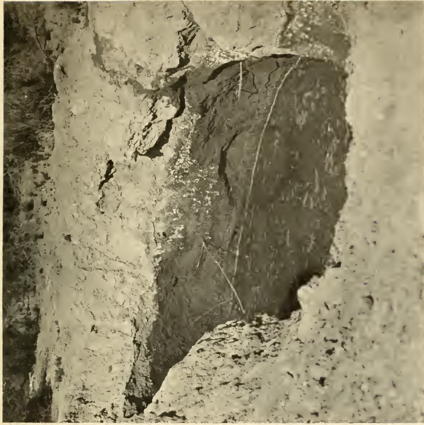
FIG. 2.—THE TRES POZOS WATERHOLE, IN THE SOUTHWESTERN PART OF PATTIE BASIN. THE PHOTOGRAPH WAS TAKEN EARLY IN APRIL, 1915, WHEN THE SURFACE OF THE WATER STOOD ABOUT FIVE FEET BELOW THE LEVEL OF THE SURROUNDING DESERT.