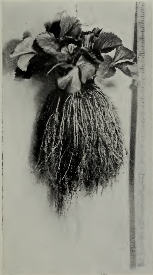
Observe Root System

Along with its other advantages, St. Martin is immensely prolific of long, vigorous runners which become strong, healthy plants. To test its multiplying power, I put one plant in an isolated position last April, and now Nov. 1st., 50 new plants are rooted from it and these are still sending out new runners. A block of 800 plants set out last April, (1919), well separated to give room for runners, now so nearly covers the ground