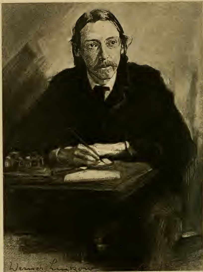
Abel Louis Stearns