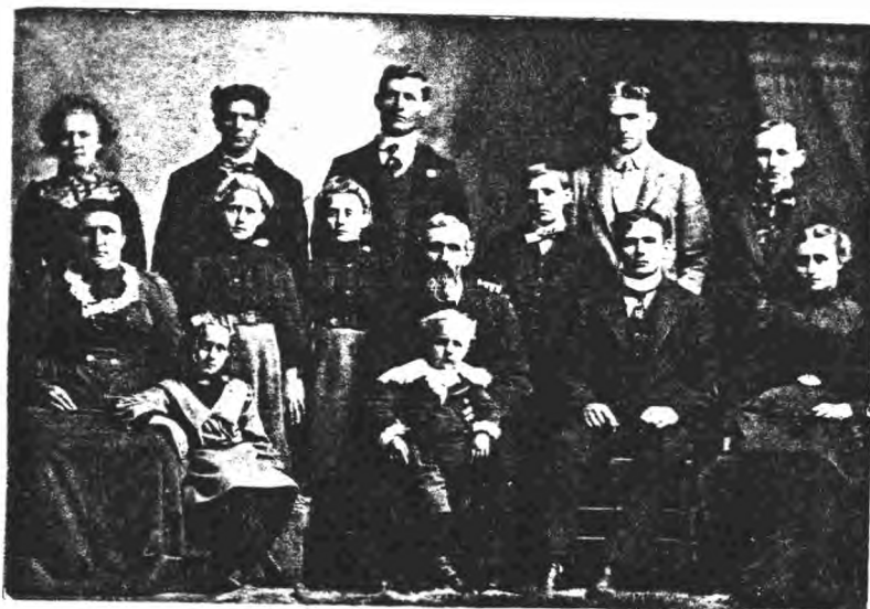
Family Picture taken about 1901