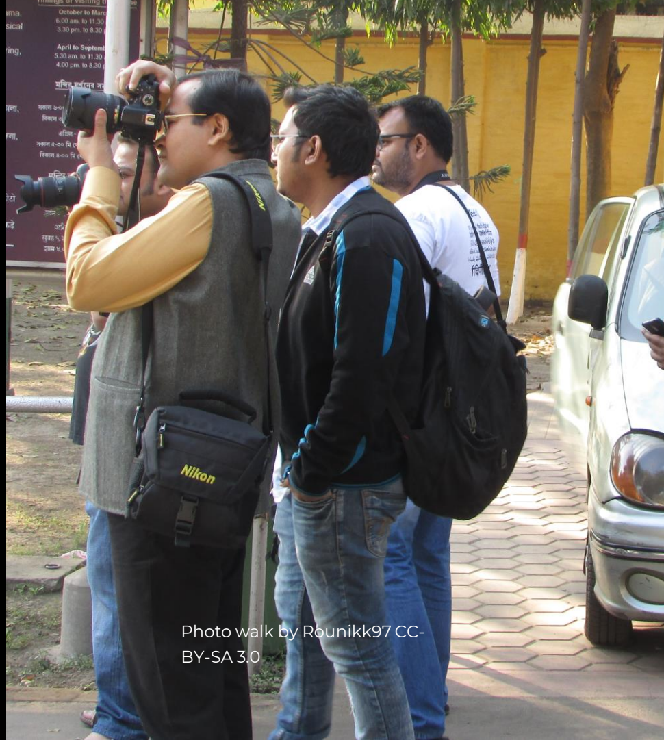
Photo walk

If you're organizing a Photowalk, make the group small enough, for best results.