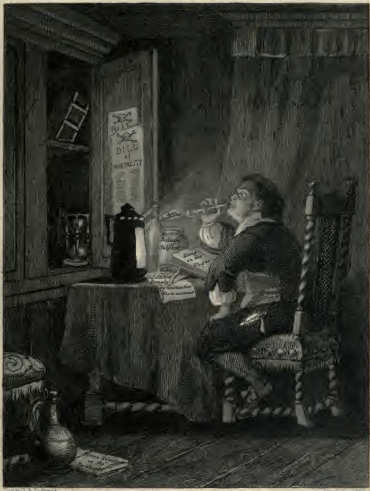
Blaise tasting the Plague Medicines,