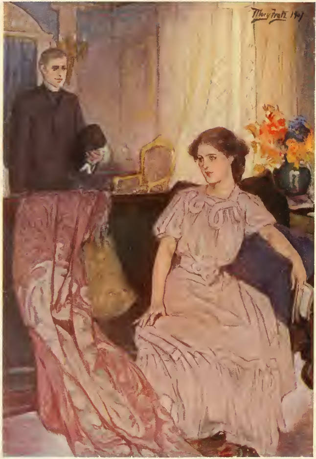
"WAS I WRONG TO COME IN?" HE ASKED