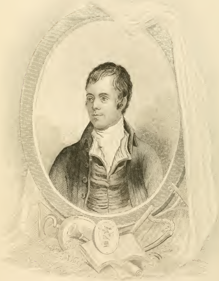
Robert Burns scil.