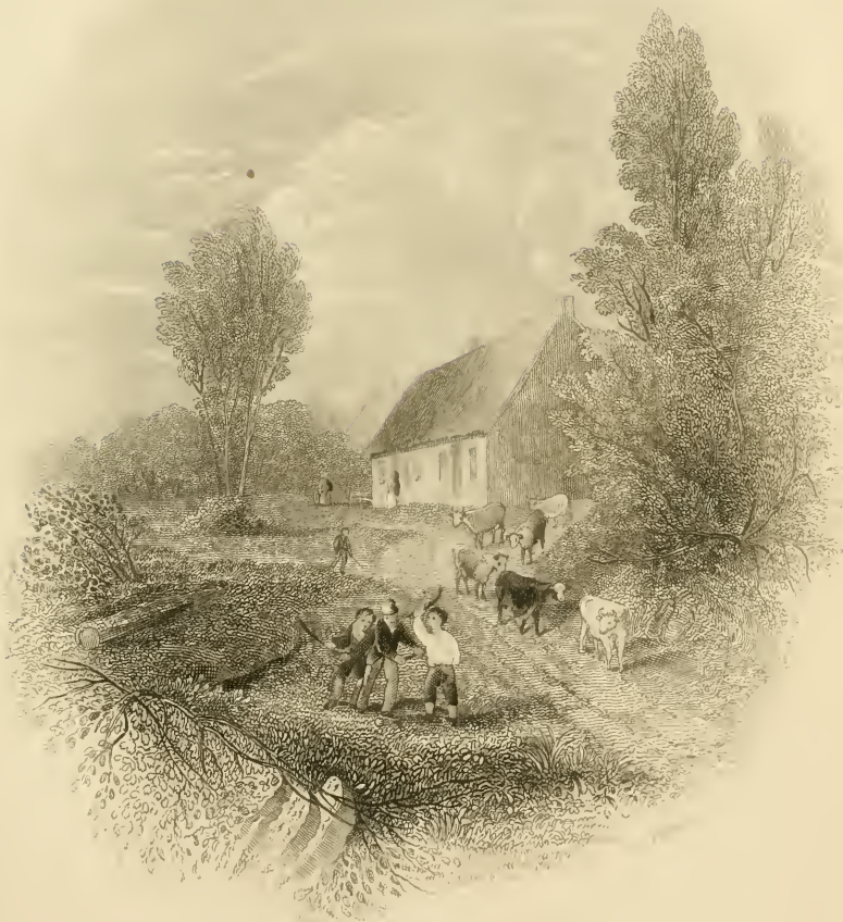
THE WINTER PLEASURE OF BURNS.