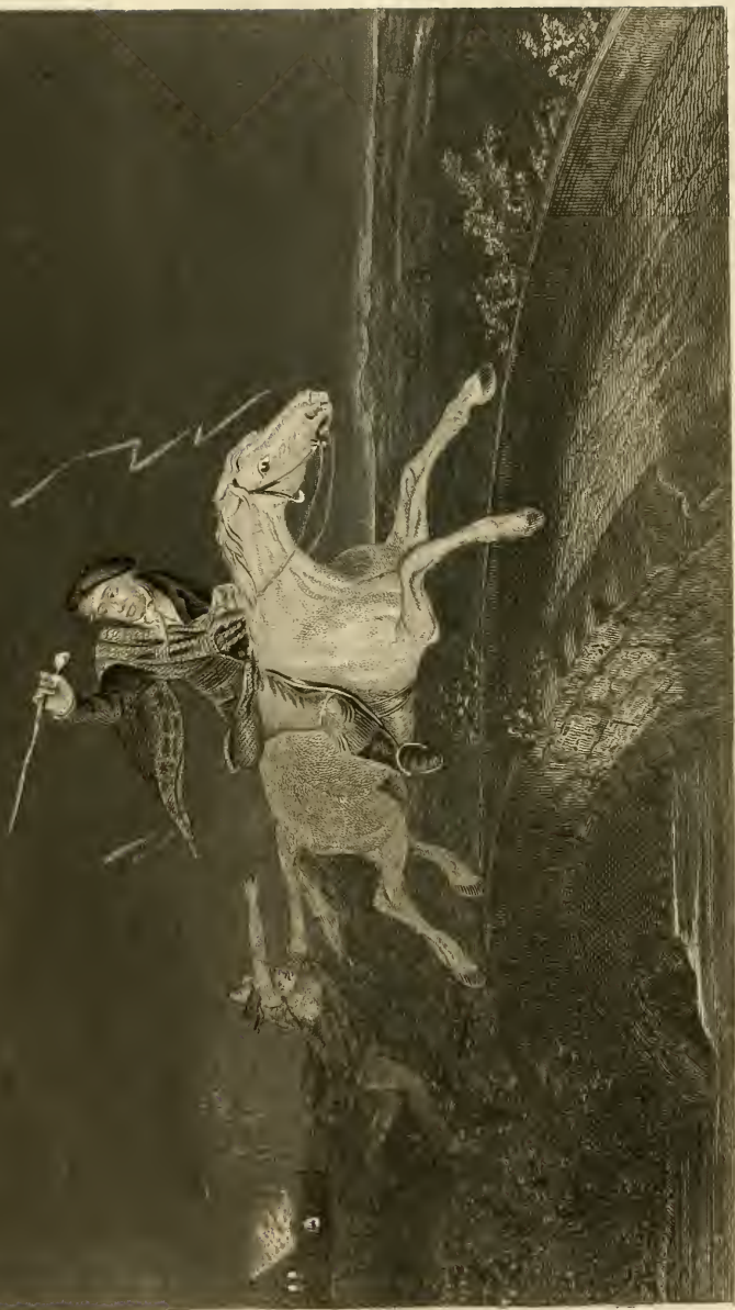
THE REARER OF THE SWORD AND THE REARER OF THE SWORD