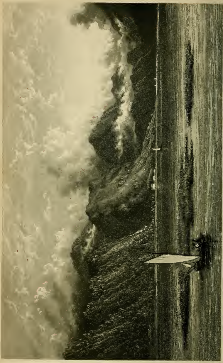
Drawn & Engraved by W. Westall, A.R.A.

Unsettled - 4-21-1831 - see Examination 1831 p. 420