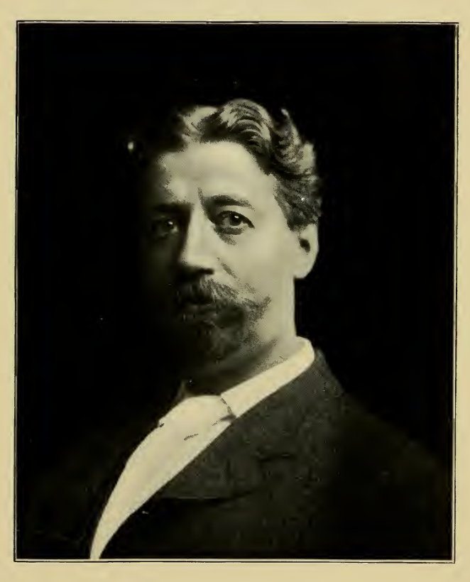
Yours in the cause of right diet,