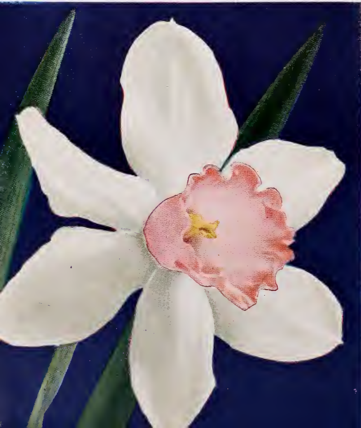
DAFFODIL, MRS. R. O. BACKHOUSE