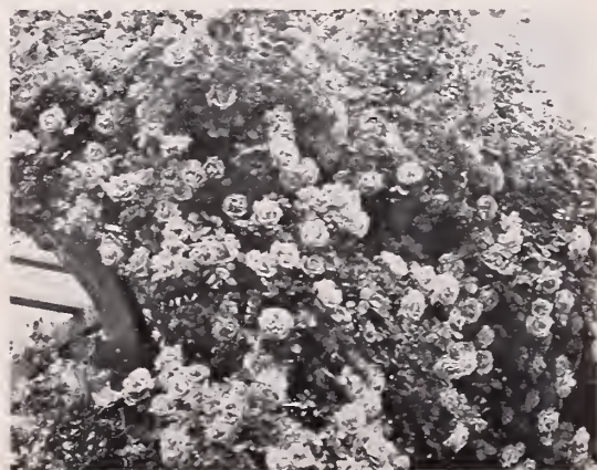
CLIMBING ROSE, BLAZE

JIMINY CRICKET. (AARS Winner 1955.) Plant Pat. 1346. This newest All-America winner is rated one of the best. Its urn-shaped tangerine-red buds are probably the greatest of its many attractions. As these beautiful buds open the color becomes a blend of orange and vermilion tones, softening later to a good coral-pink. The plant is upright and shapely, free blooming and growing 3 to 4 feet tall. The foliage is glossy green. Each $2.25; 3 for $6.00.