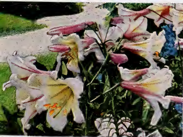
REGAL LILY. Hardy, 4 to 6 feet

Write Our Staff About Your Garden Problems or Plant Selections