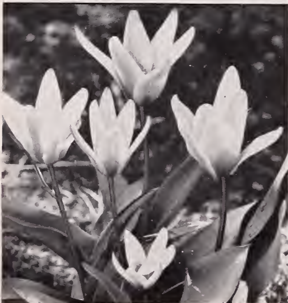
SPECIES TULIP, KAUFMANNIANA

PAVO. Very double, large, compact carmine flowers on strong stems. Resembles the famous Avondzon. 3 for 40c; 6 for 70c; 12 for $1.25; 25 for $2.25; 100 for $7.95.