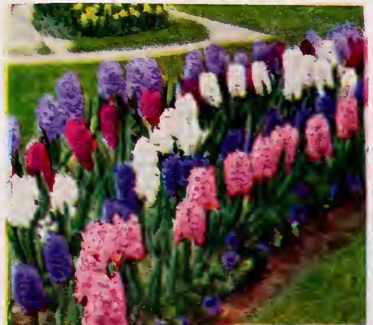
HYACINTHIS for border or separate bedding