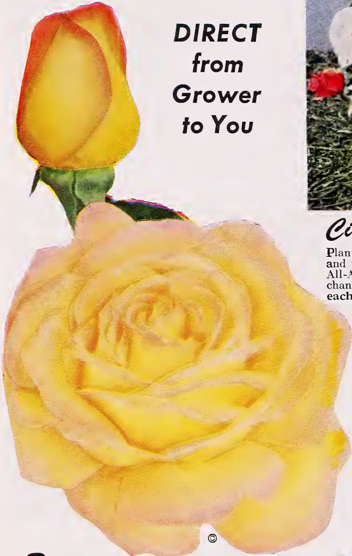
Peace. Hybrid Tea

Plant Pat. 1382. The first multicolor Floribunda and the first Floribunda rose ever to win the only All-America Award in any year. Urn-shaped buds changing from gold to red and vermillion. $2.50 each; 3 for $6.60.