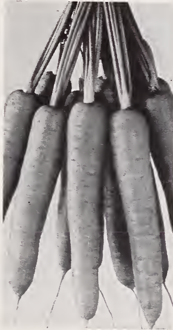
182. CARROTS, IMPERATOR