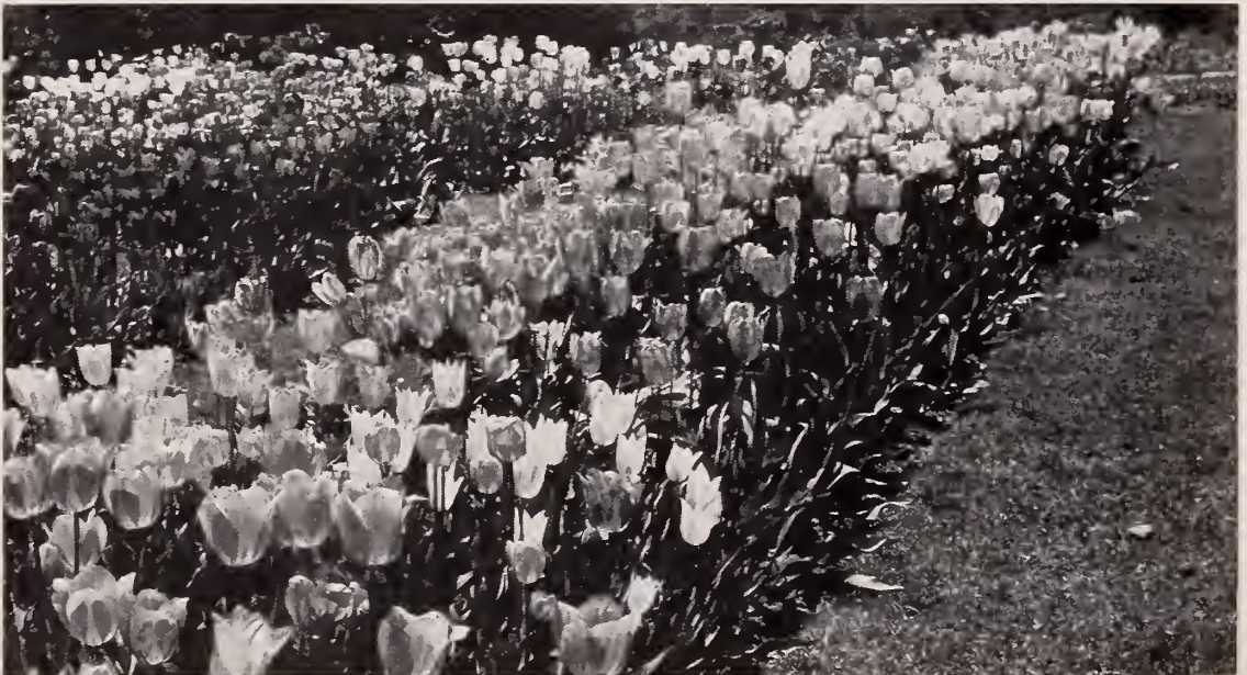
PLANTING OF COTTAGE TULIPS

SMILING QUEEN. Possibly the "last word" in pink Cottage Tulips. Pure rose, shading satin-rose toward edge of petal. An excellent novelty. 3 for 40c; 6 for 70c; 12 for $1.30; 25 for $2.35; 100 for $8.40.