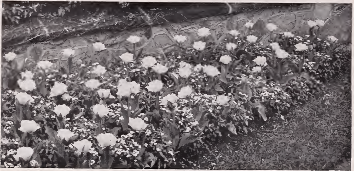
PLANTING OF PEONY TULIPS