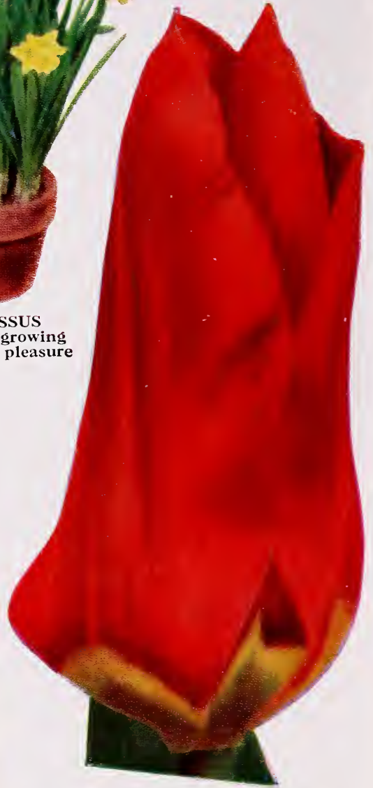
SPECIES TULIP, RED EMPEROR