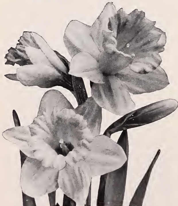
NARCISSUS, KING ALFRED

YOLANDA. (Trumpet.) A bicolor trumpet highly recommended by our grower in place of Mrs. Krelage, which we had offered for so many years. Each 30c; 3 for 80c; 6 for $1.45; 12 for $2.65; 25 for $4.85; 100 for $17.25.