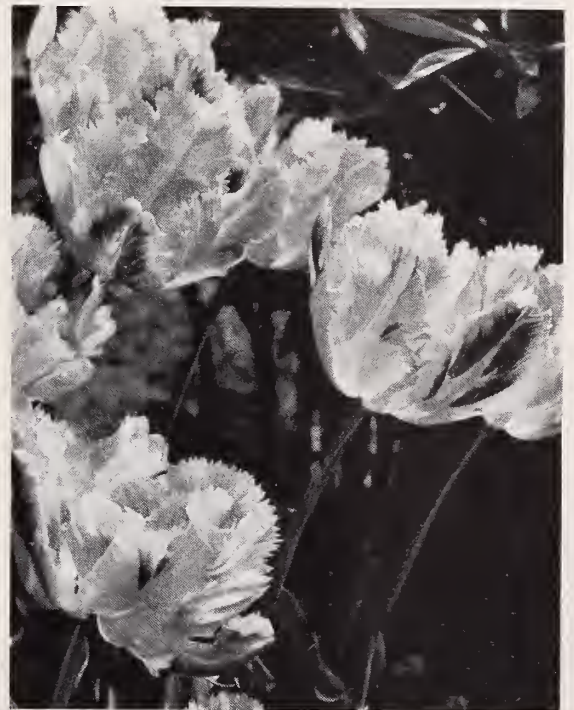
PARROT TULIP, FANTASY

TALL PARROT MIXED. 3 for 35c; 6 for 65c; 12 for $1.20; 25 for $2.20; 100 for $7.95.