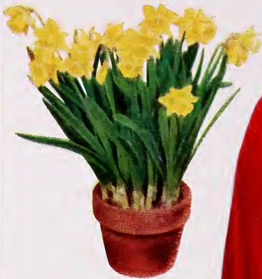
NARCISSUS for indoor growing and winter pleasure