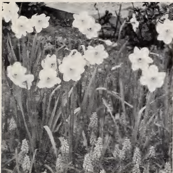
NARCISSUS and GRAPE HYACINTHS