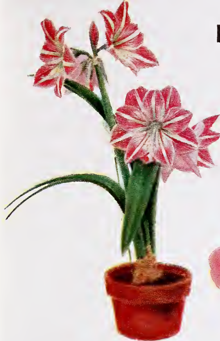
AMARYLLIS Equally striking potted or in garden

Before Mid-December Spring Planting Will Be Too Late