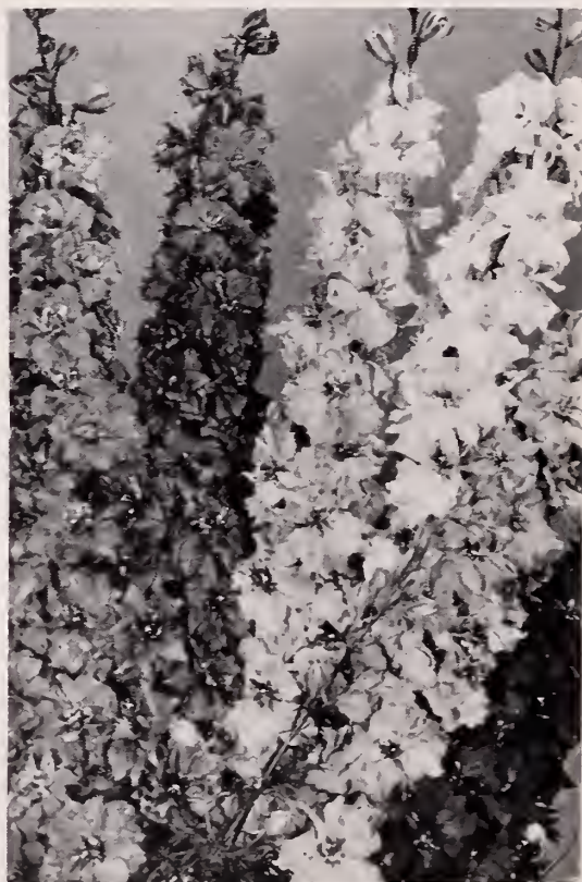
REGAL LARKSPUR, MIXED

1548. Belladonna . Light blue. Pkt. 15c; ½oz. 75c.