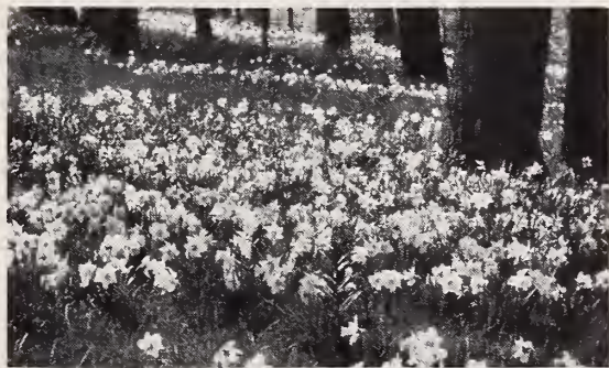
NATURALIZED MIXED DAFFODILS

THALIA. Often called the Orchid-flowered Narcissus. Two or three lovely pure white flowers per stem. Petals recurving, with angle of the trumpets distinctively unusual. The best of the Hybrid Triandrus. Each 30c; 3 for 80c; 6 for $1.50; 12 for $2.75; 25 for $5.00; 100 for $18.00.