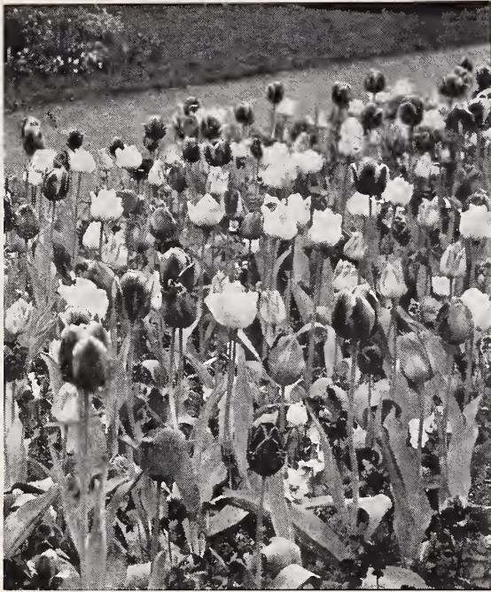
PLANTING OF SINGLE EARLY TULIPS