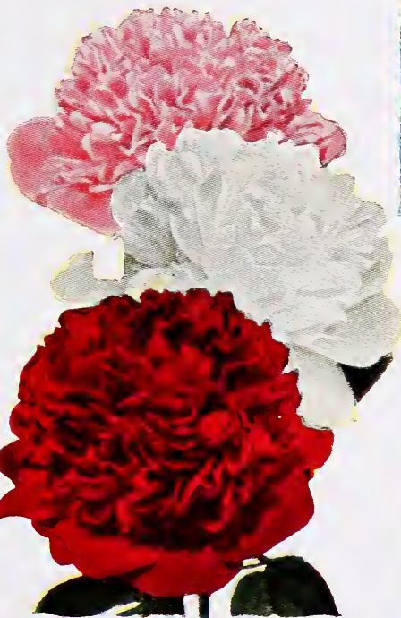
PEONIES Northern grown select stock Red, White, Pink