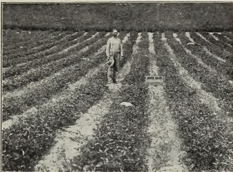
This is another view of the Adam's fruit farm. Pretty good stand of plants for the light sand of Northern Michigan.