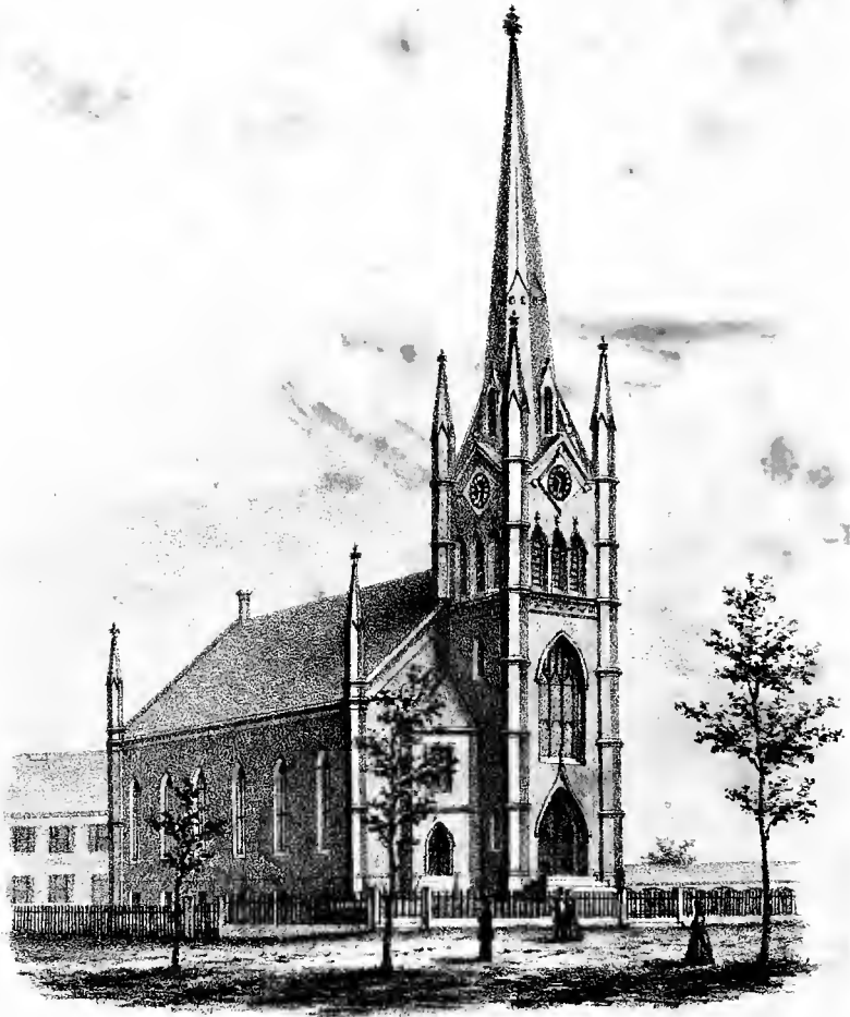
FIRST CONGREGATIONAL MEETING-HOUSE, NATICK.