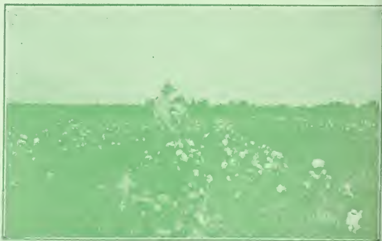
A Peep Into One of Our Rose Fields