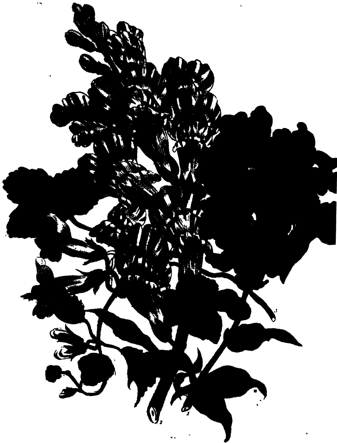
1. Antirrhinum majus , var. Dumecolor . — 2. Antirrhinum majus , var. Car. gorkhyllendes 3. Antirrhinum clarina ?