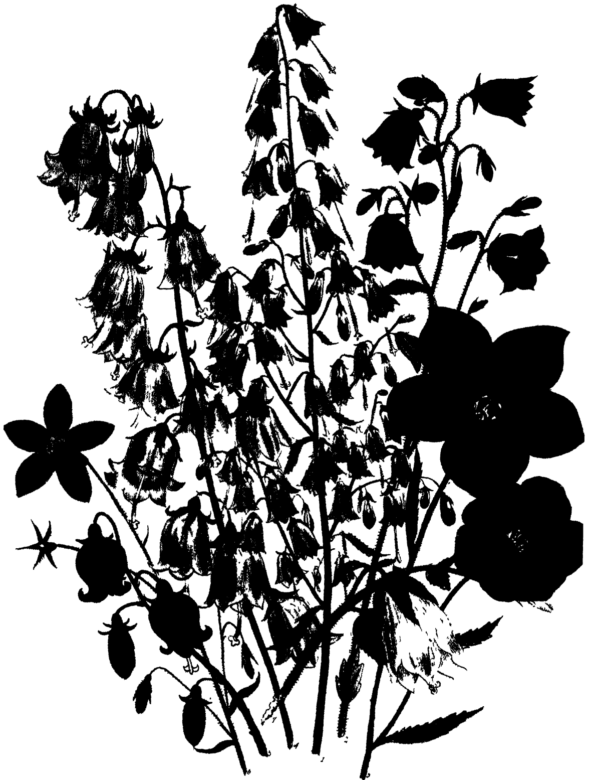
1. Adenophora intermedia 2. Adenophora dentulata 3. Adenophora coronata 4. Adenophora sussex