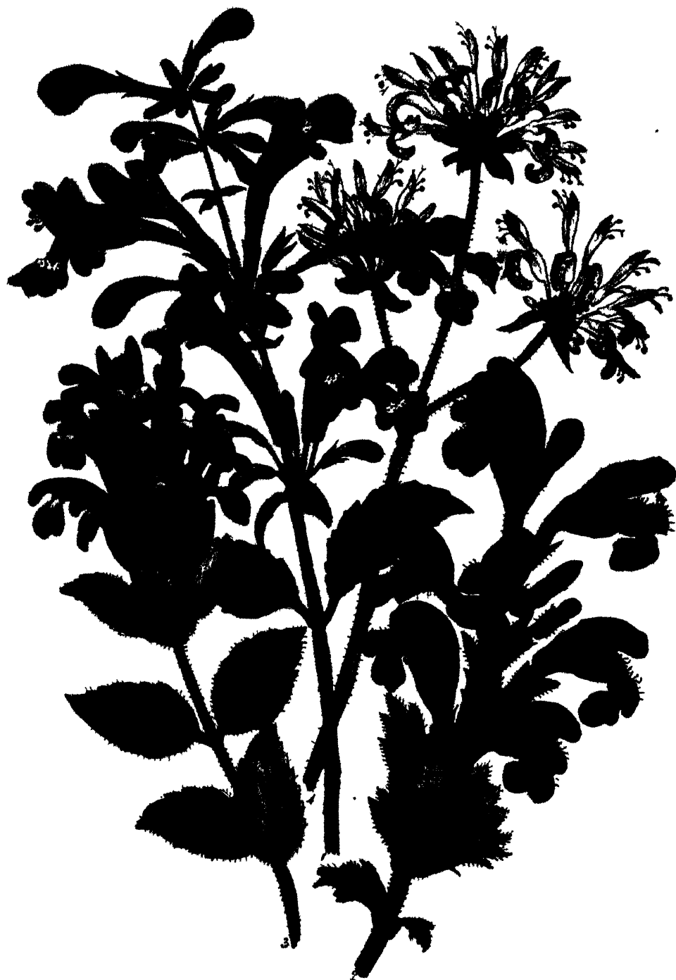
1 Dracopetalum sibiricum . — 2 Dracopetalum Alarconae — 3 Scutellaria alpina 4 Monarda Ruspoliana