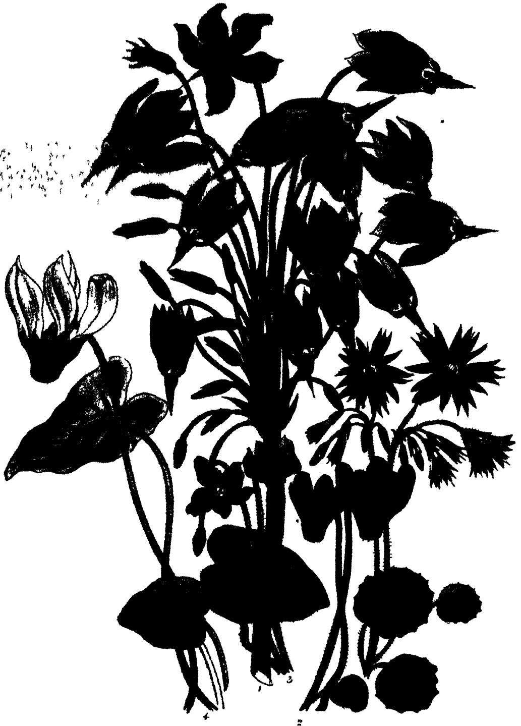
1 Androsace alpina — 2 Cyclamen repandum — 3 Cyclamen rotundum + Cyclamen hederifolium — 4 Primula montana