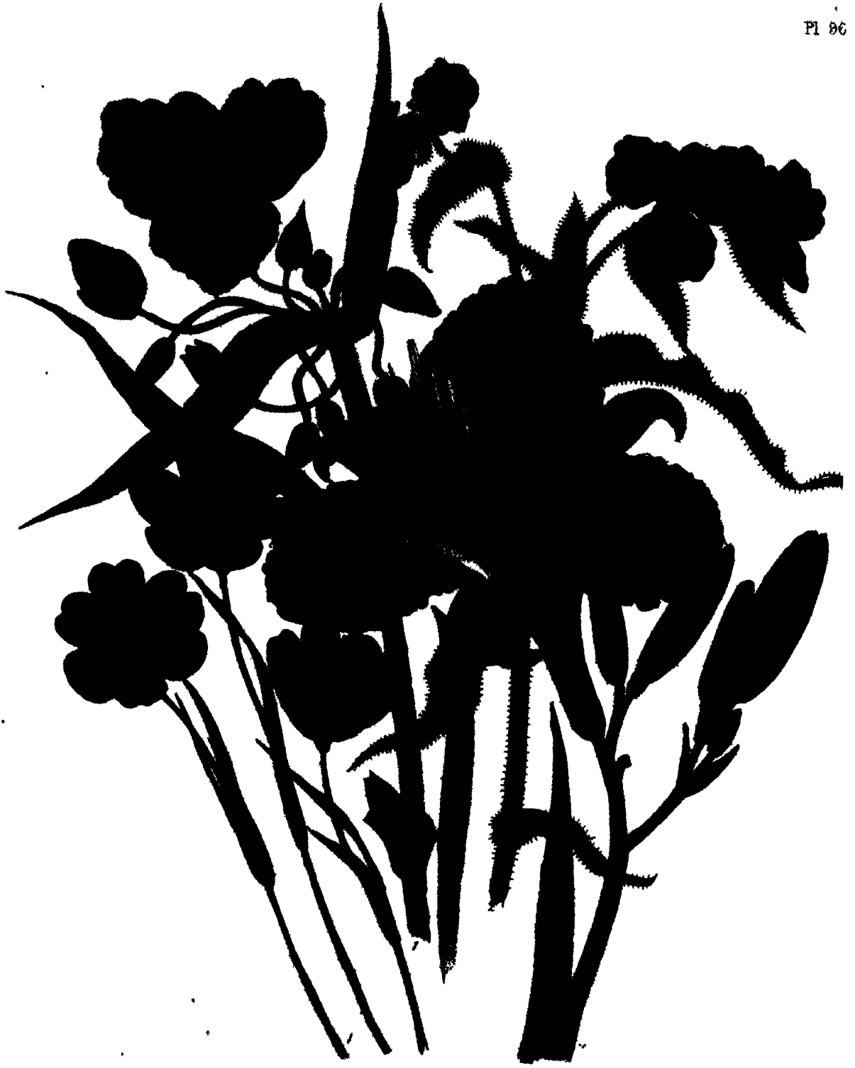
1 Tradescantia virginica - 2 Composita trientalis - 3 Fuchsia fulva 4 Anemone grandiflora