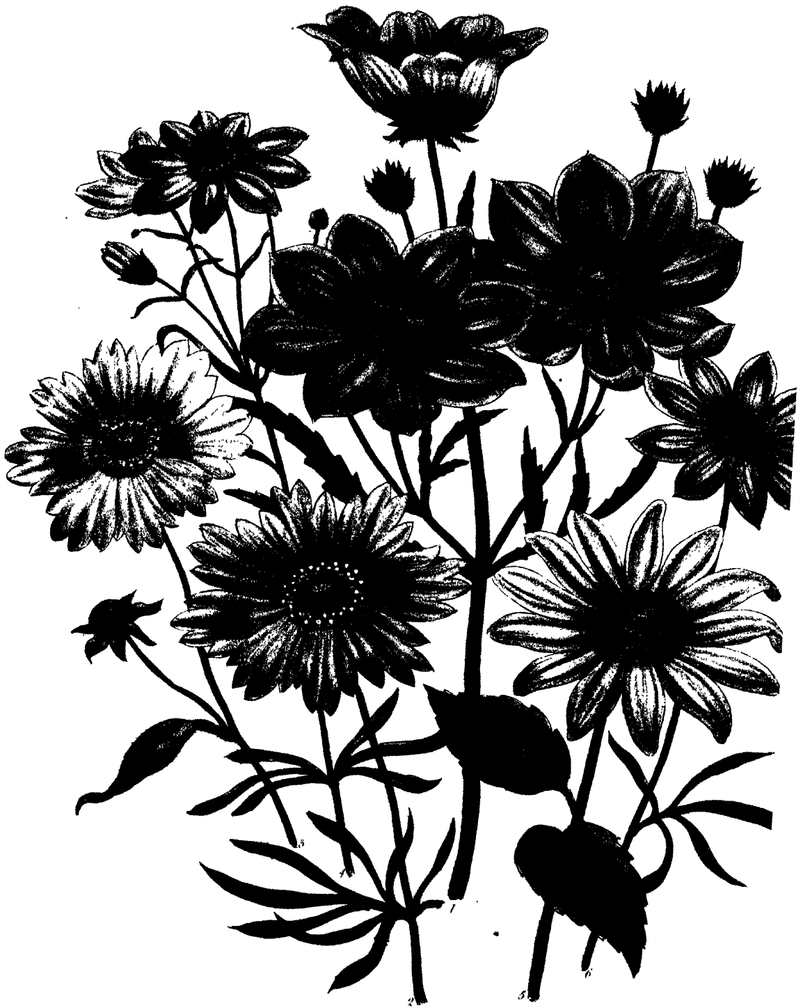
1 Coreopsis aurca ... 2 Coreopsis grandiflora ... 3 Coreopsis lanceolata ... 4 Coreopsis renifolia 5 Coreopsis verticillata ... 6 Helopsis laevis