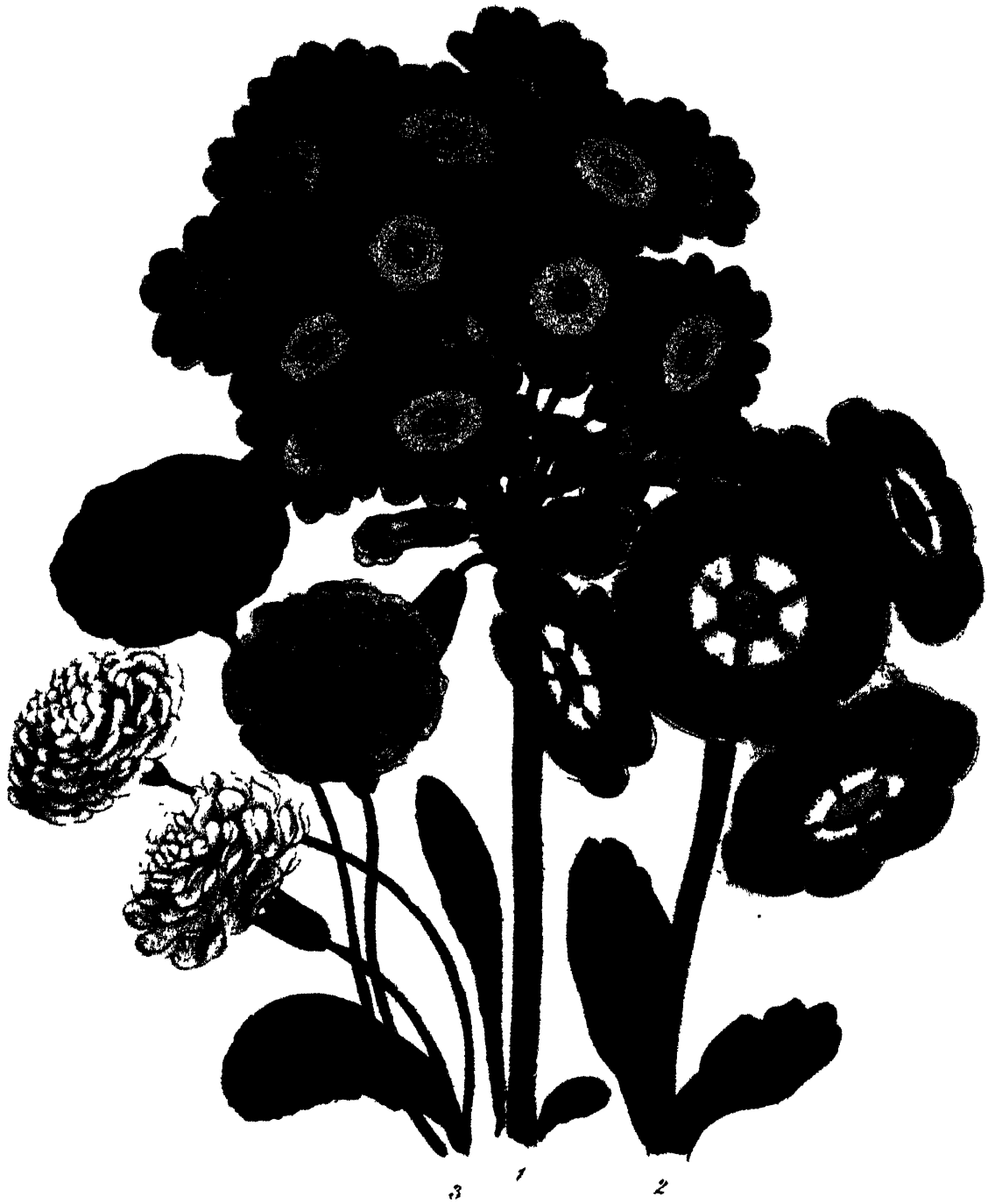
1 Primula glaberrima var. polianthus ( Primula firma ); 2 Primula auricula (the conqueror of 1. 3 Primula , vulgaris , 4 double varieties);