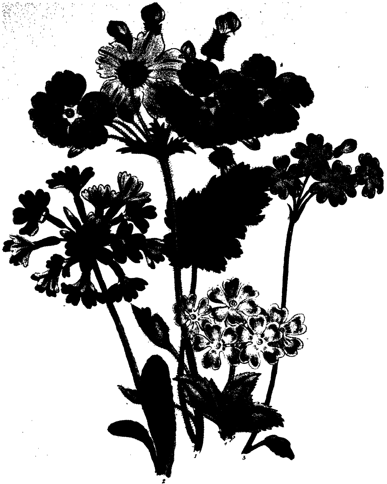
1 Primula praevenens — 2 Primula amara — 3 Primula Siberica 4 Primula ciliata