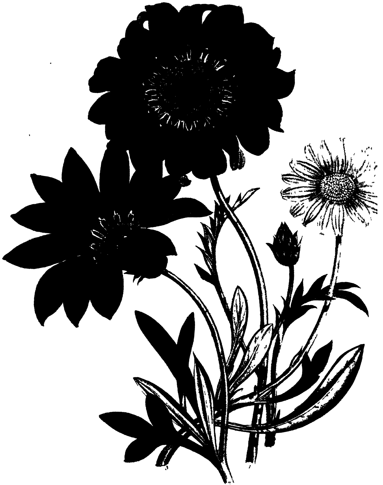
1 Gazania purpurea 2 Gazania rigida 3 Gazania angustata