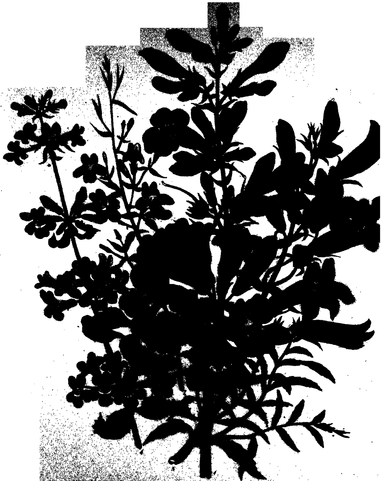
1. Penstemon sp. 2. Penstemon tristyllus 3. Penstemon laevis 4. Penstemon paniculatus