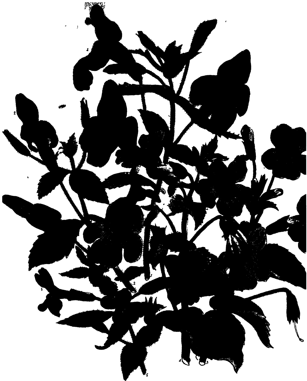
1. Memulus hiactacana 2. Memulus 3. Memulus Smithii 4. Memulus sulcus 5. Memulus borealis