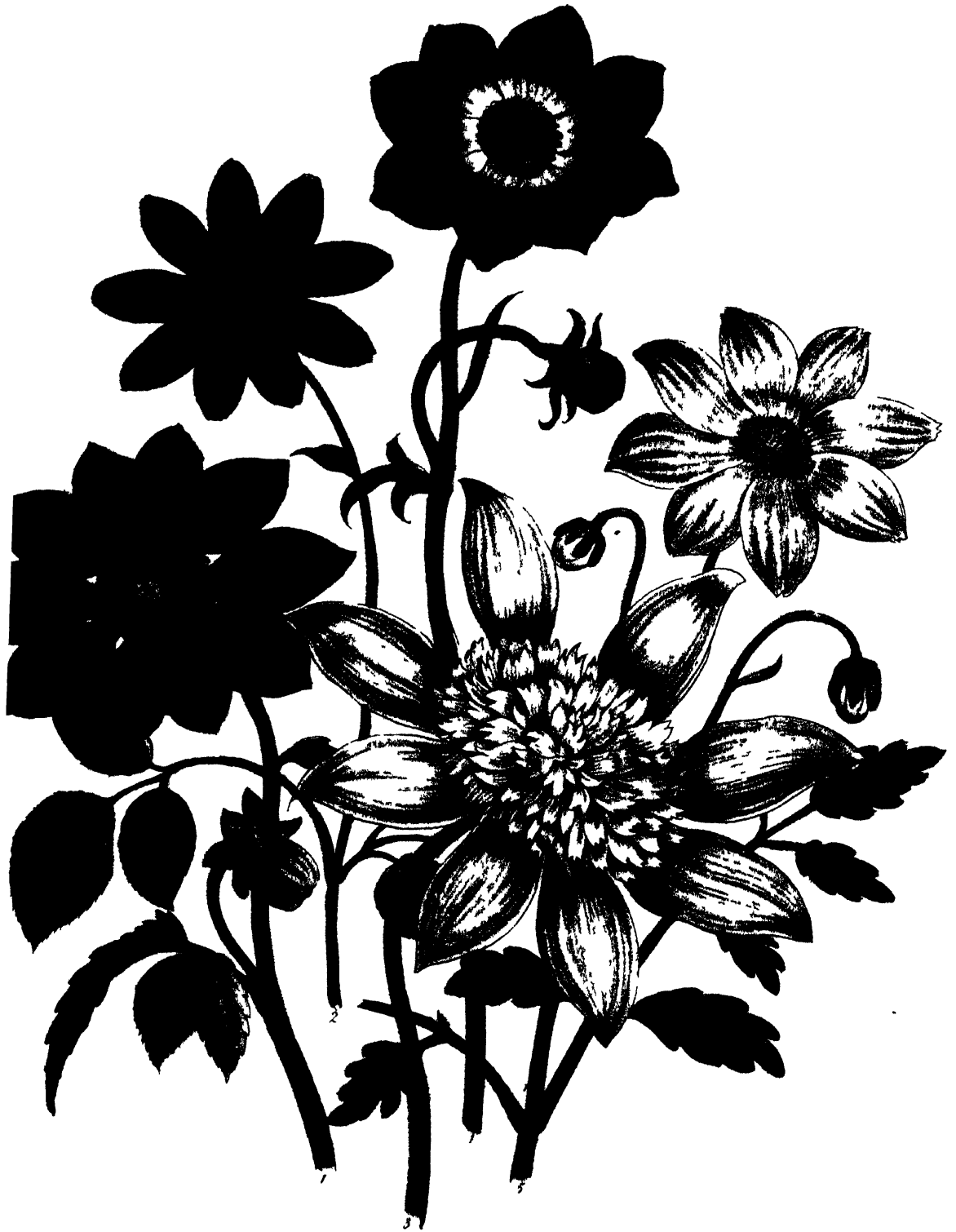
1 Dahlia crocata - 2 Dahlia coccinea - 3 Dahlia excelsa - 4 Dahlia glabrata L. H. 11