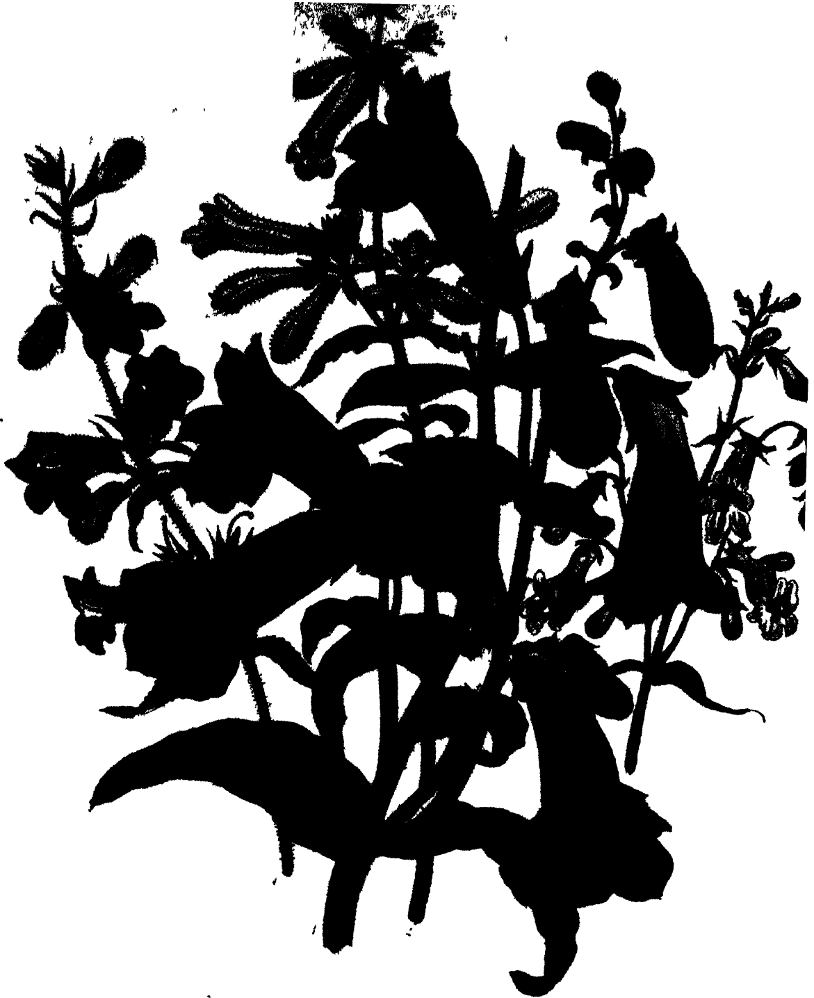
1 Penstemon gentianoides var. splendens - 2 Penstemon gracilis - 3 Penstemon - 1927 4 Penstemon Campanulata