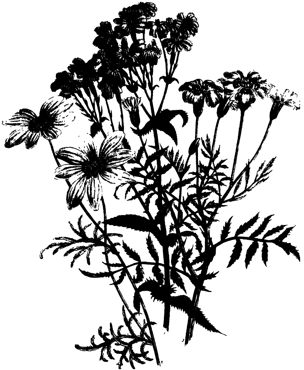
1. agrostiflora 2. naevata u. rugosa 3. u. rufiflora u. tetrasperma