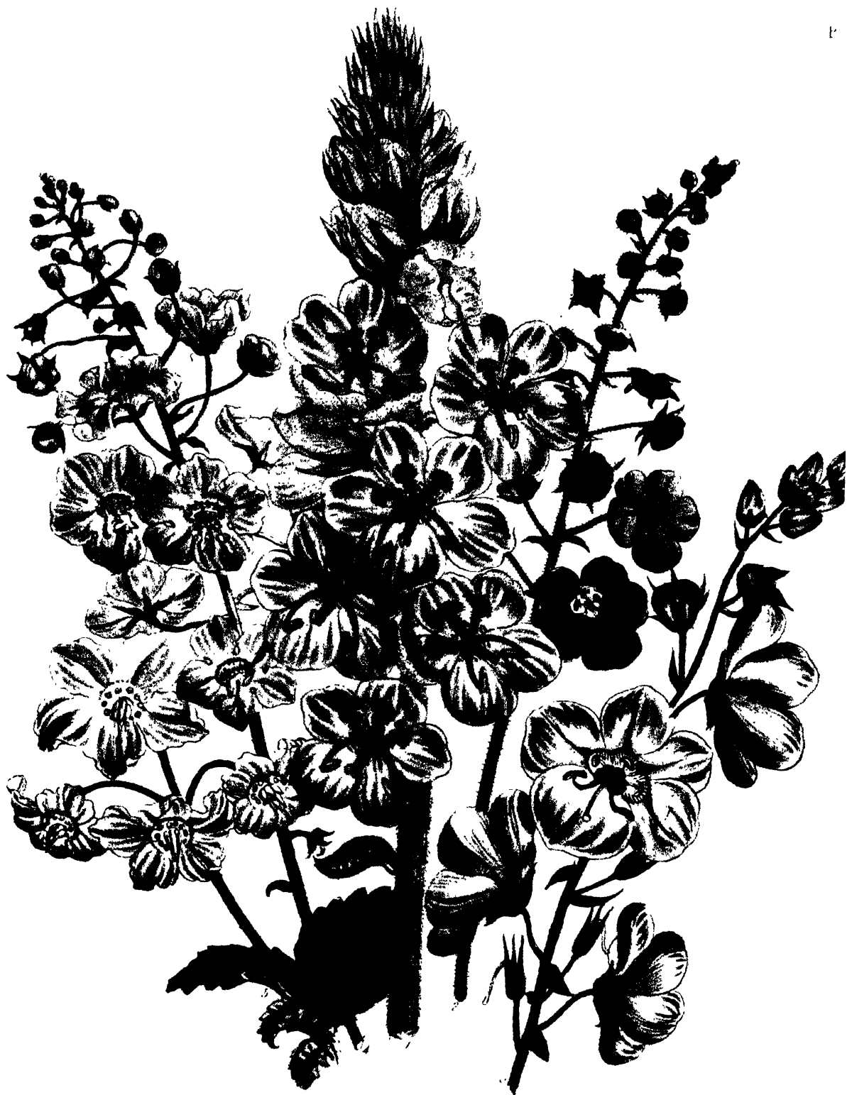
1. Verbascum formosum — 2. Verbascum Thiancicum — 3. Verbascum Cyprium 4. Celsia sublanata — 5. Raymondia Algerie