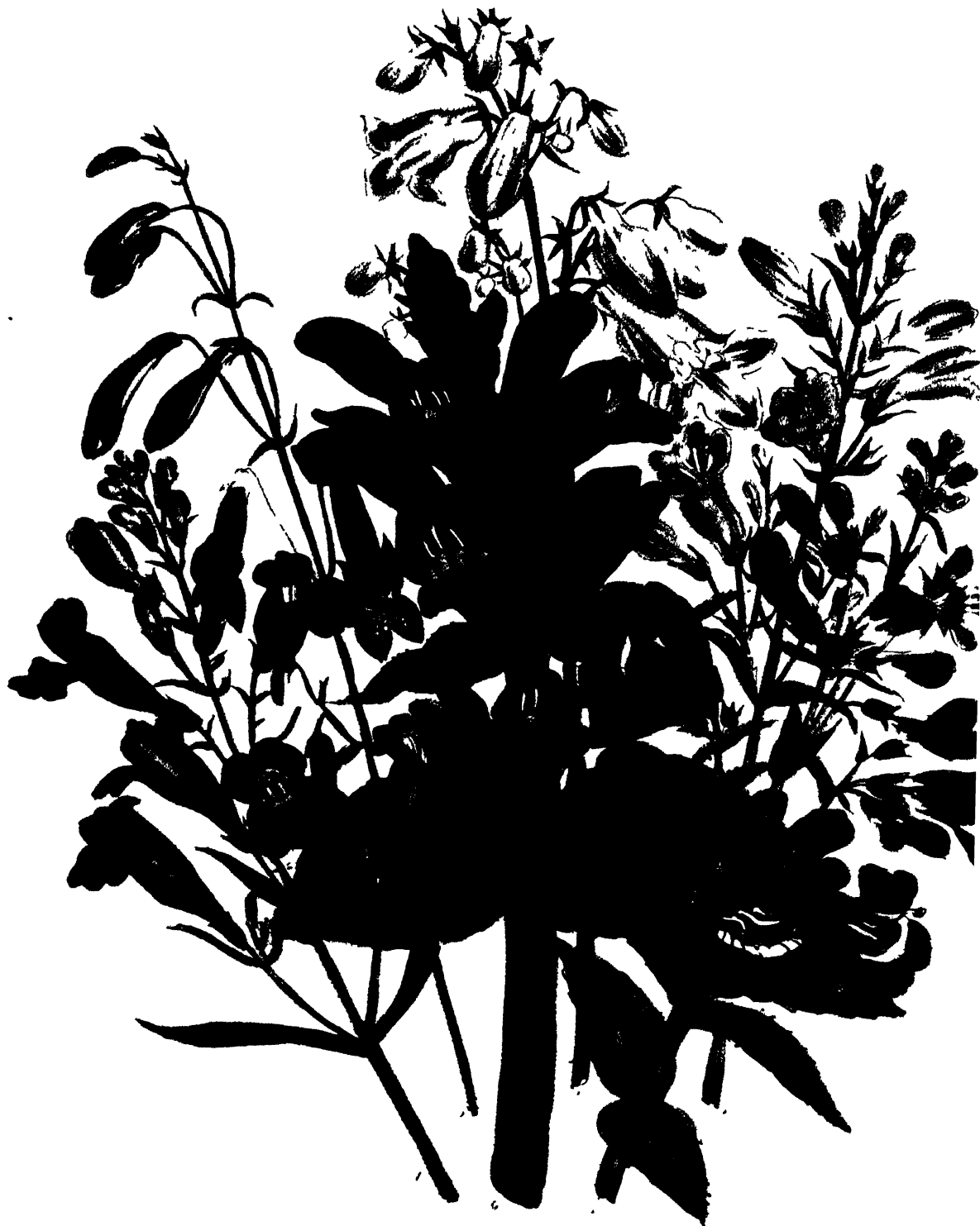
1 Penstemon digitalis 2 Penstemon rugosus 3 Penstemon caninus 4 Penstemon heterophyllus 5 Chelone barbata 6 Chelone sp.