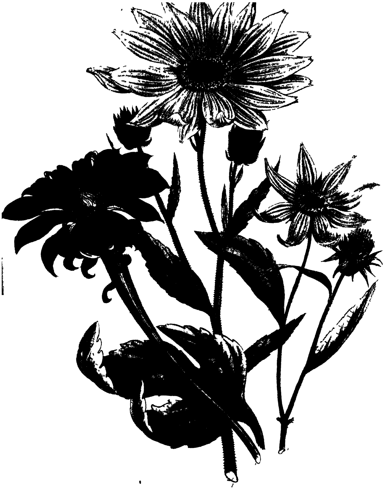
1 Helianthus pinnatifidus Helianthus scaberrimus Helianthus, Helianthus