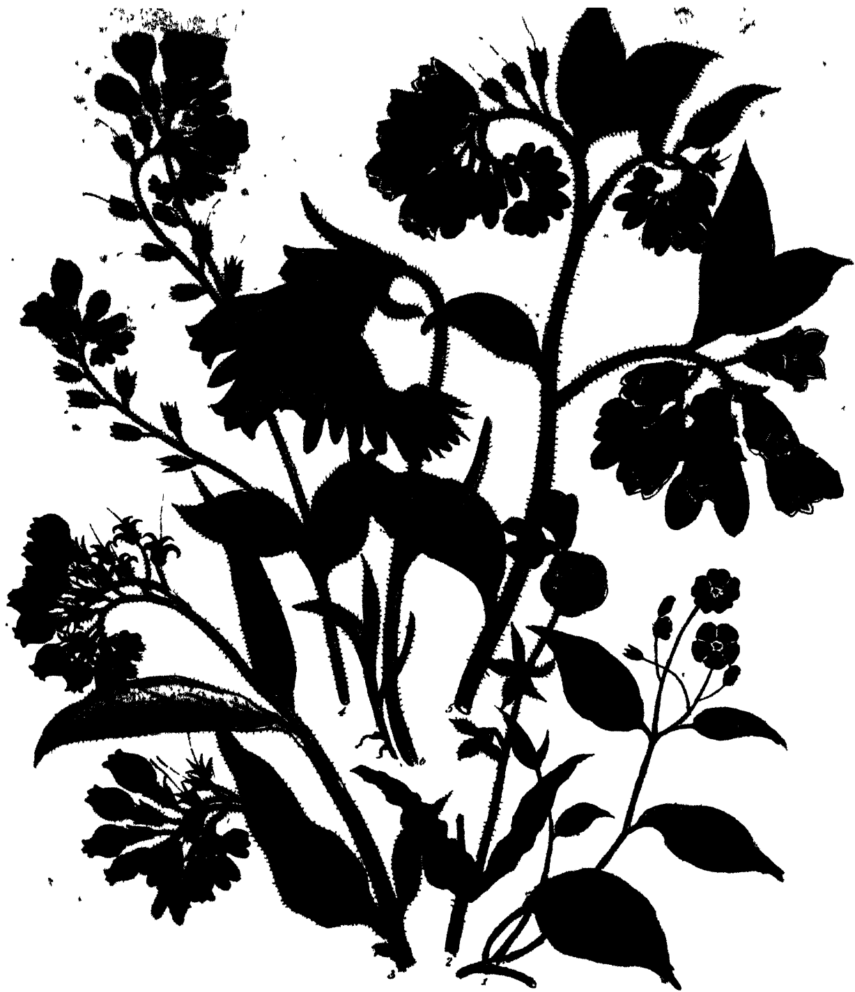
1 Cynoglossum Amphalense — 2 Cynoglossum pectinatum — 3 Symphytum officinale , var. irkense n. s. 4 Symphytum caucasicum — 5 Symphytum asperum — 6 Pisoma Laurica