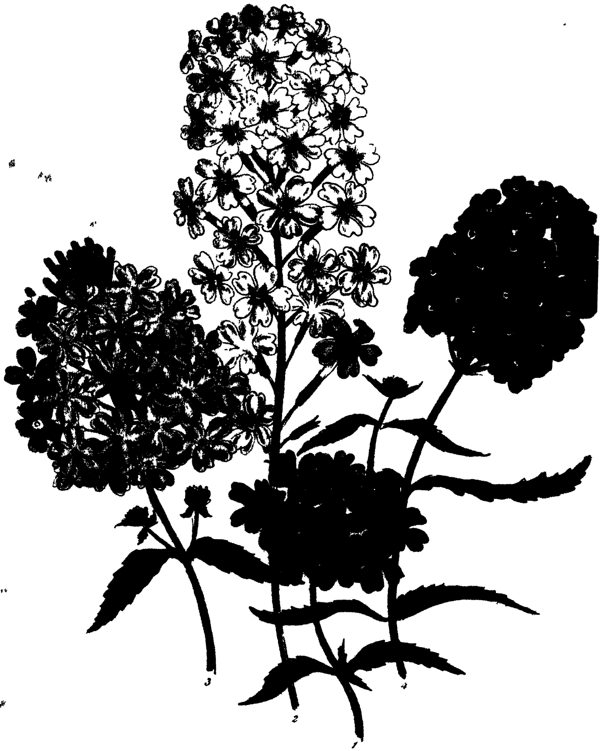
1. Verbena Melanensis 2. Verbena teucrioides — 3. Verbena lacediana 4. Verbena carulescens