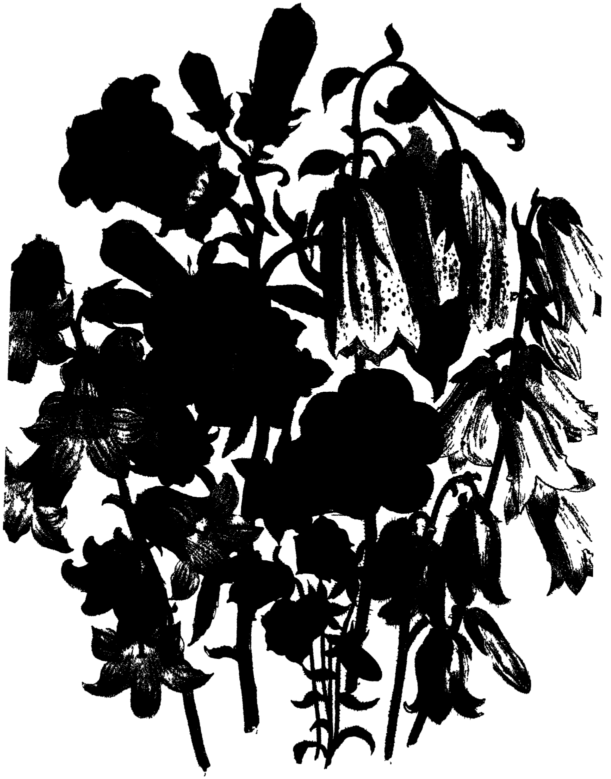
1 Campanula medium - 3 Campanula macrophylla - Campanula latifolia - Campanula persicifolia " " " " " "