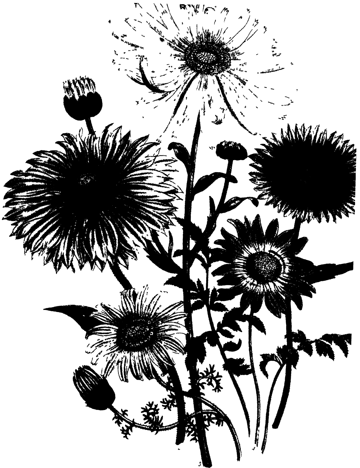
1. Helianthus scaberrimus - Helianthus scaberrimus - Helianthus scaberrimus 2. Helianthus scaberrimus - Helianthus scaberrimus - Helianthus scaberrimus