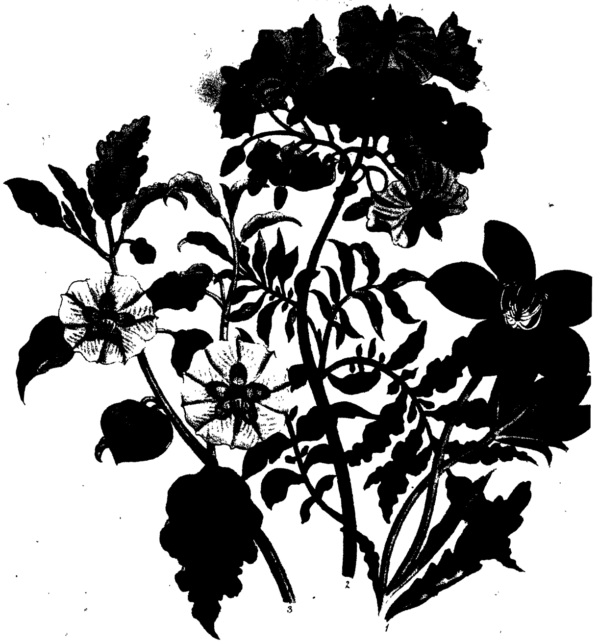
1. Mandragora autumnalis - 2. Solanum elaeagnifolium - 3. Physalis viscaria .