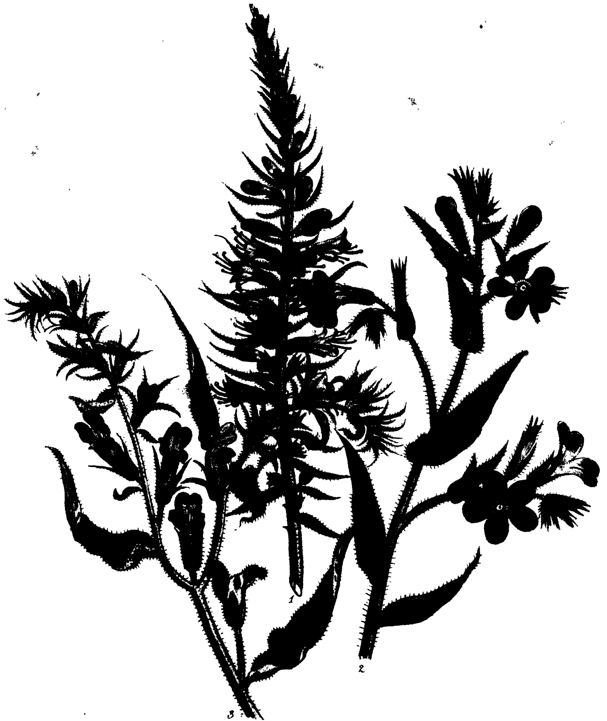
1. Echium rubrum . — 2. Anchusa Italica . — 3. Echium Creticum .