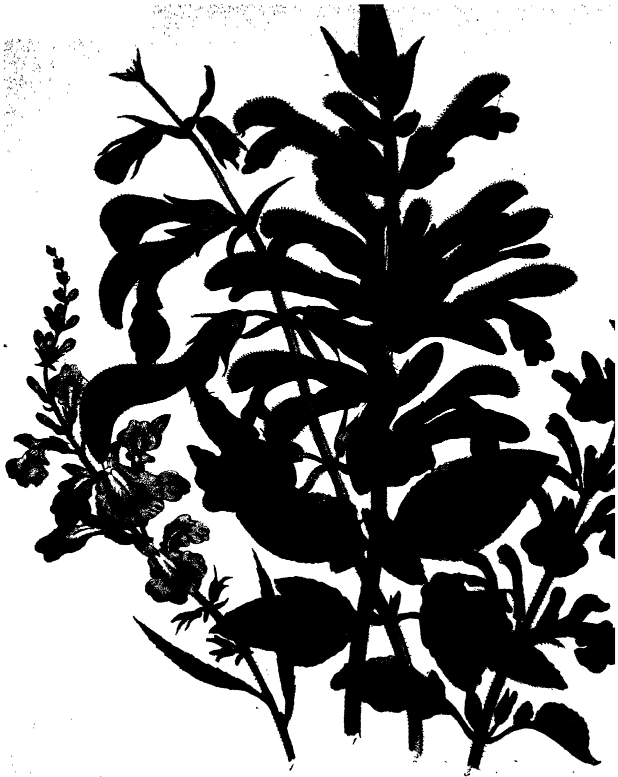
1. Salvia fulgens 2. Salvia patens 3. Salvia Grahamii 4. Salvia angustata