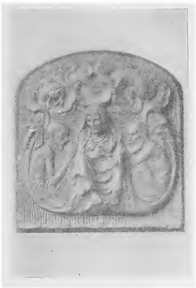
THE GATE OF THE HUNDRED SORROWS