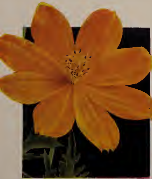
COSMOS, ORANGE FLARE

Two All-American Gold Medal Winners for 1934