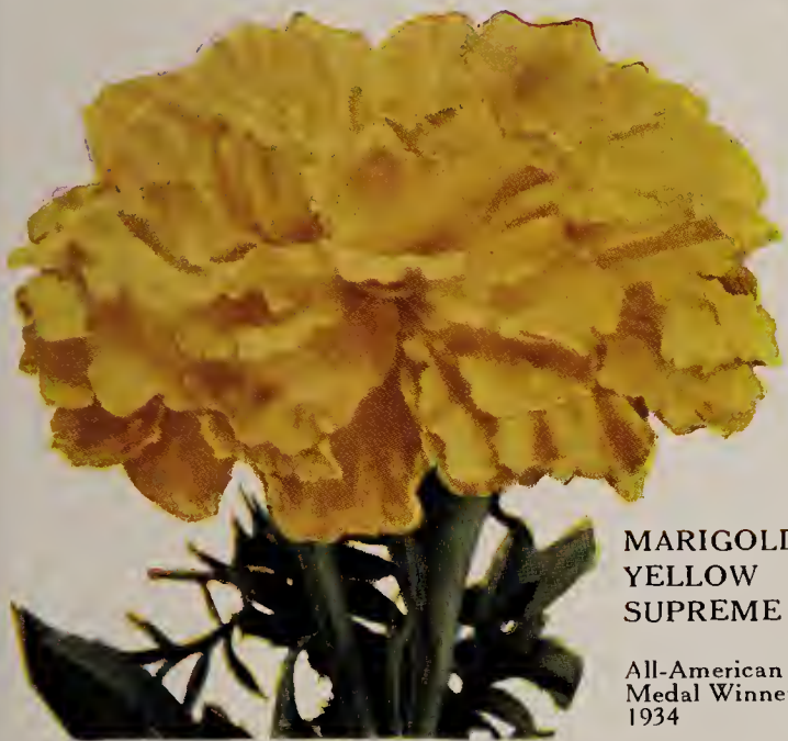
MARIGOLD YELLOW SUPREME