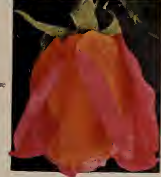
PRES. HERBERT HOOVER