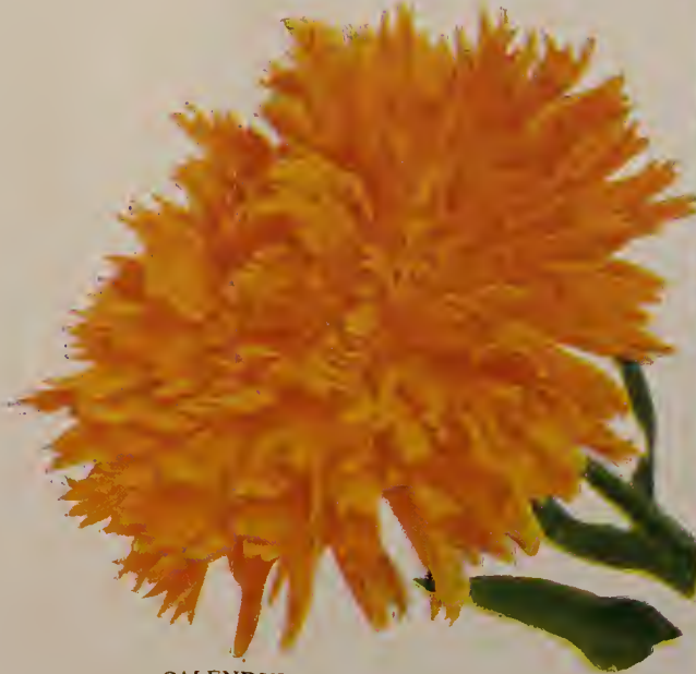
CALENDULA, ORANGE SHAGGY All-American Gold Medal Winner, 1934