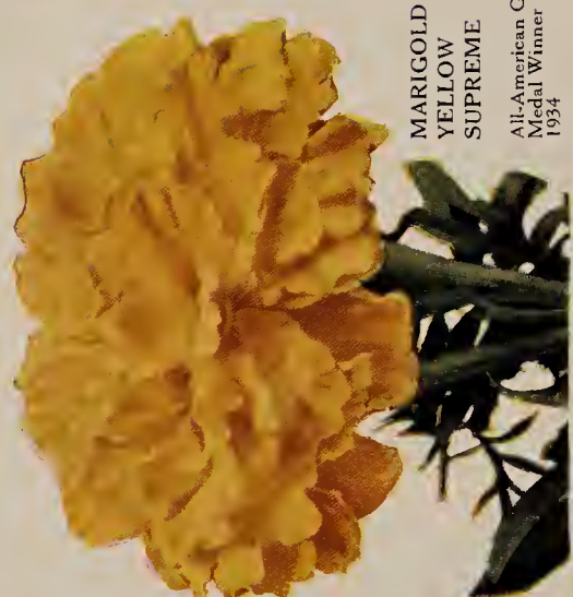
MARIGOLD YELLOW SUPREME