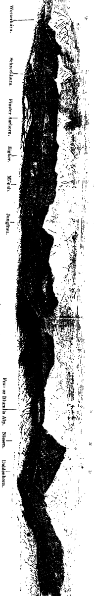
THE BERNESE ALPS, as seen from the neighbourhood of Bern.—Route 24.