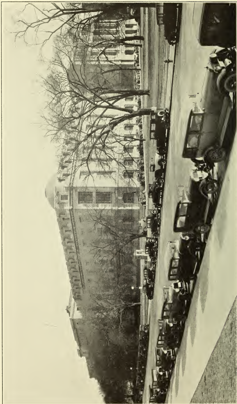
THE NATURAL HISTORY BUILDING, UNITED STATES NATIONAL MUSEUM, FROM THE NORTHWEST