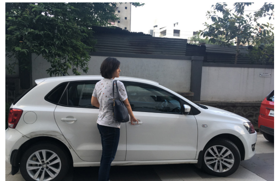
Caption Goes Here