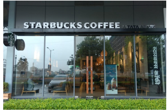
Caption Goes Here

Sultana finds the 'Edit' option on Wikipedia worrying, since she feels that the quality of information can be compromised if anybody is allowed to modify content. She believes that the Wikipedia content is authored by the Wikipedia team. Sultana feels that a 'Suggest' option will work better, where users can suggest modifications, which the Wikipedia team can then either accept or reject. On Wikipedia, Sultana only explores unfamiliar topics that she wants to learn more about - hence, she hasn't used the 'Edit' option. Moreover, the thought of changing a valid fact erroneously and thus impacting millions of readers scares her.