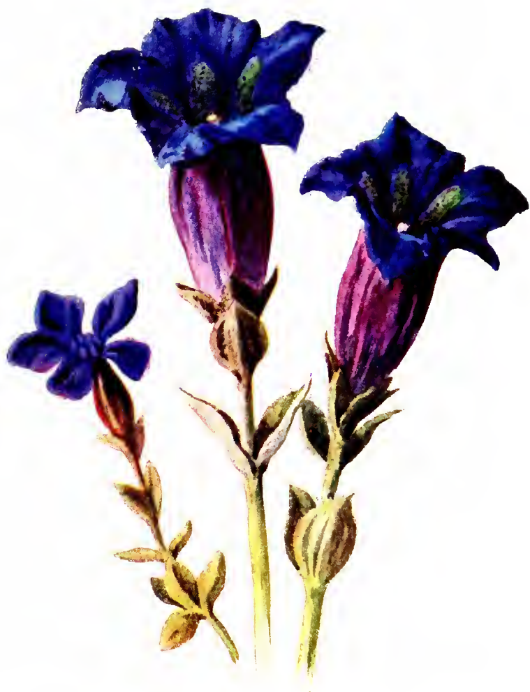
SPRING GENTIAN and GENTIANELLA.