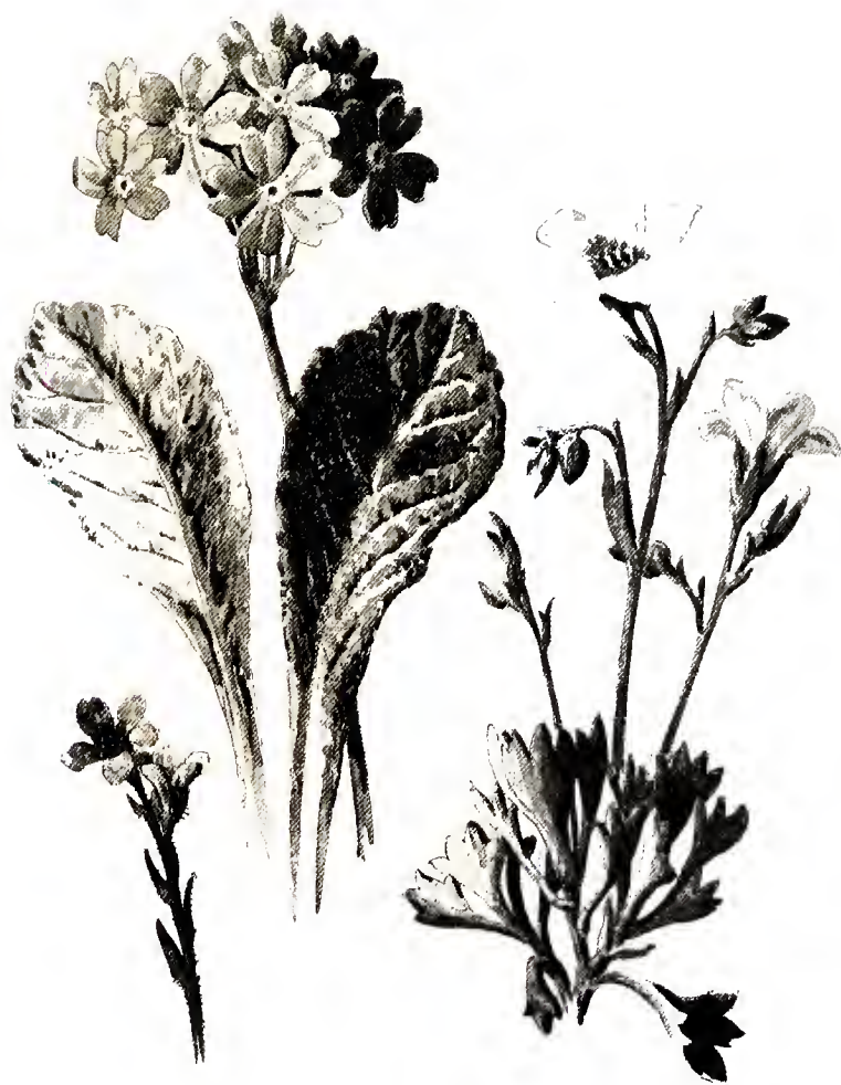
PRIMULA FRONDOSA, SAXIFRAGA WALLACEI, SAXIFRAGA TOMBEANENSIS.