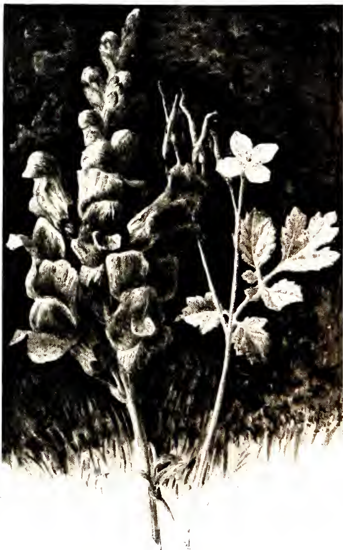
SNAPDRAGON and CELANDINE.