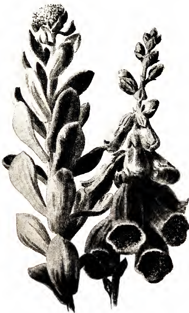
ROSE-ROOT and FOXGLOVE.