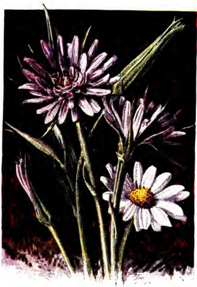
SALSIFY and OX-EYE.