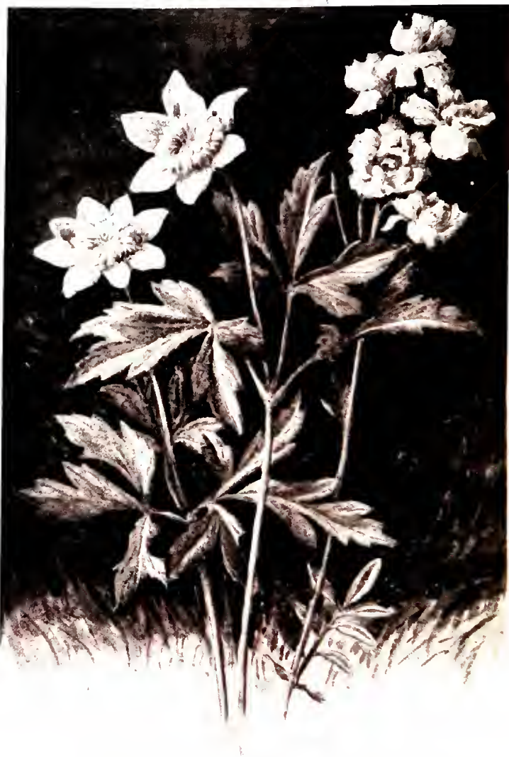
DOUBLE ANEMONE and DOUBLE LADY'S-SMOCK.