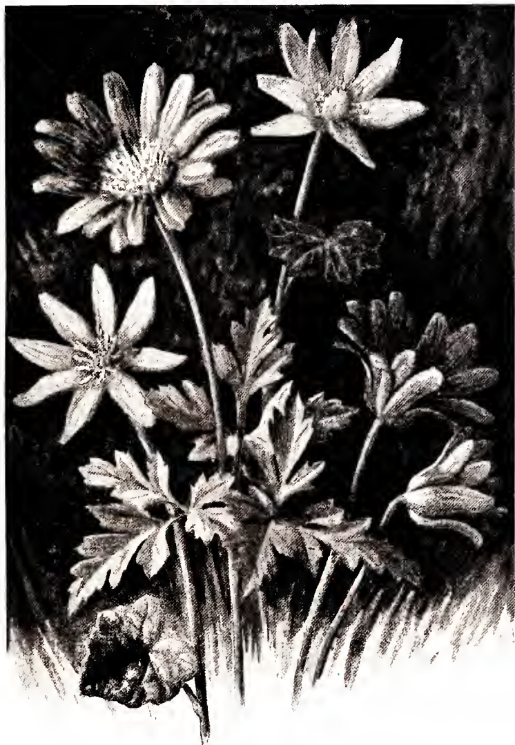
ALPINE ANEMONE and SMALL CELANDINE.