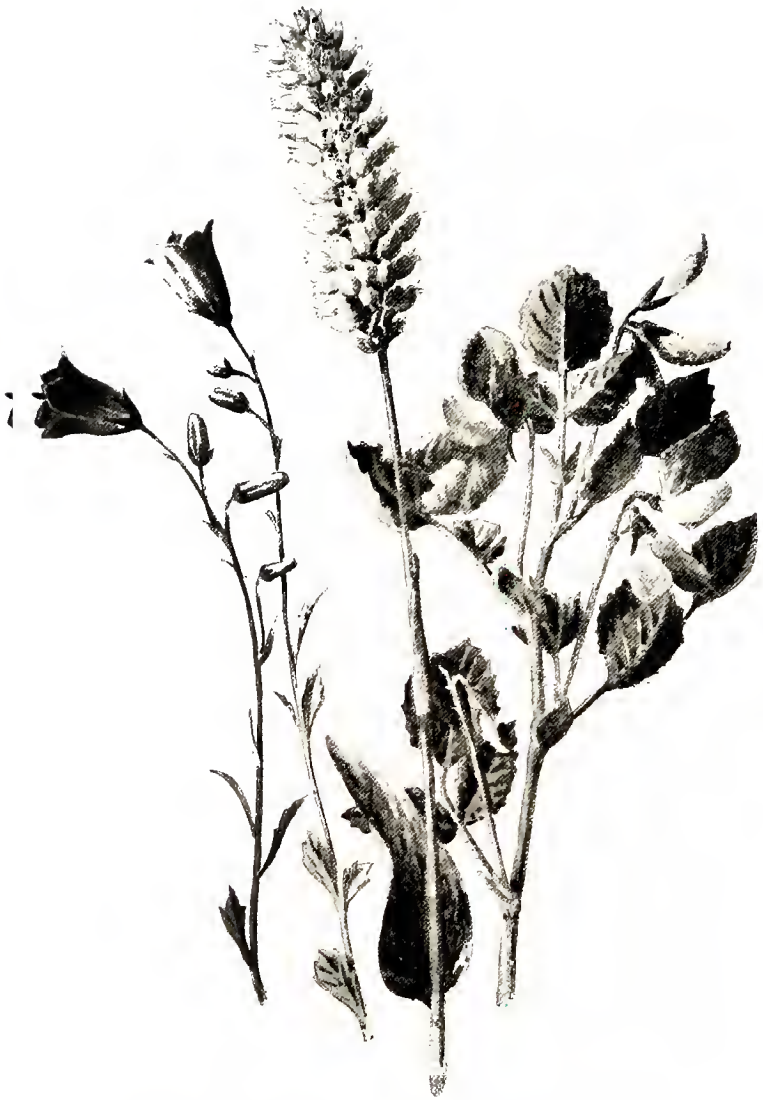
CAMPANULA PUSILLA, BISTORT, and ONONIS FRUTICOSA.