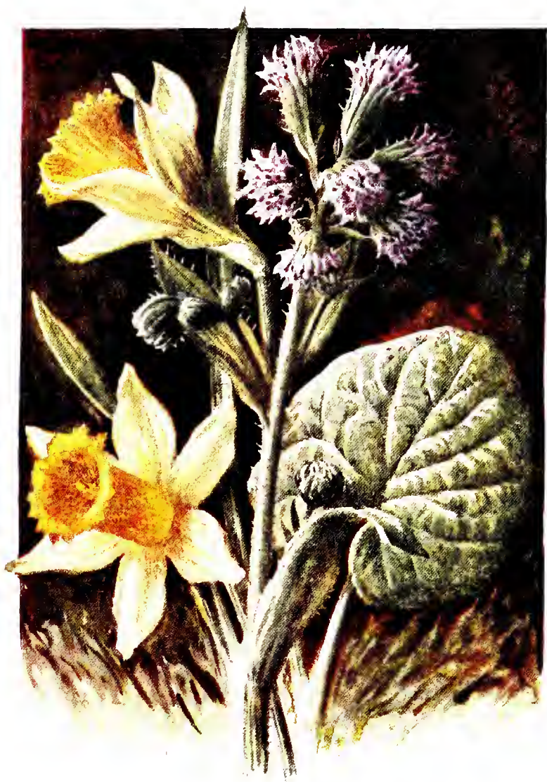
FRAGRANT BUTTER-BUR and DAFFODIL.