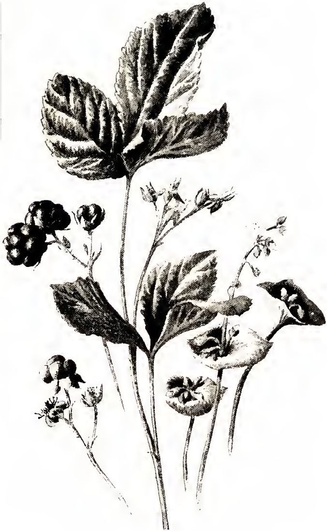
STONE BRAMBLE and CLAYTONIA PERFOLIATA.