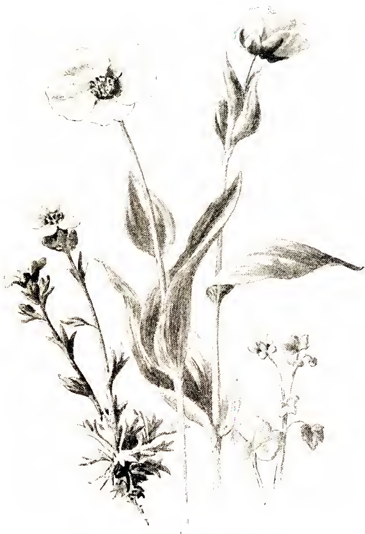
SAXIFRAGA RHEI. RANUNCULUS AMPLEXICAULIS SAXIFRAGA CYMBALARIA.