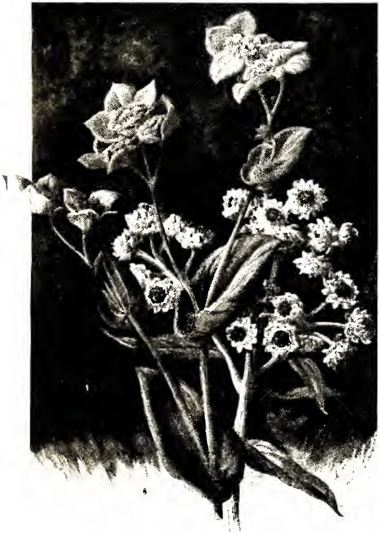
HARE'S-EAR and PEARLY CUDWEED.