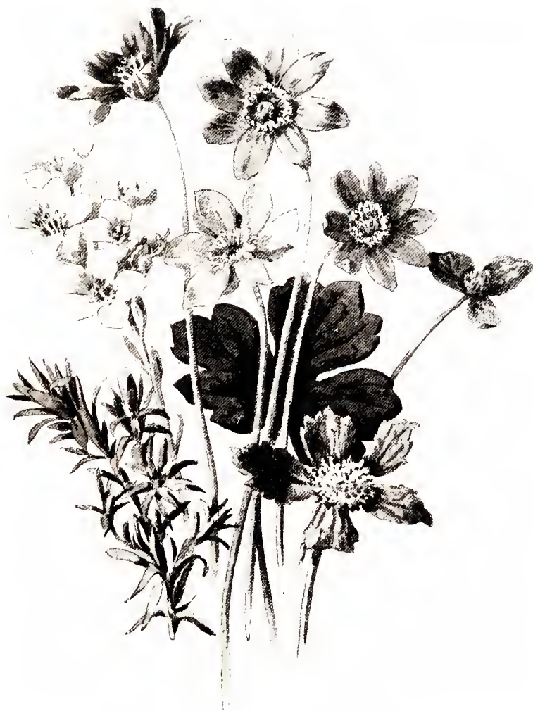
SAXIFRAGA ELIZABETHEÆ, ANEMONE HEPATICA, and HACQUETIA EPIPACTIS.