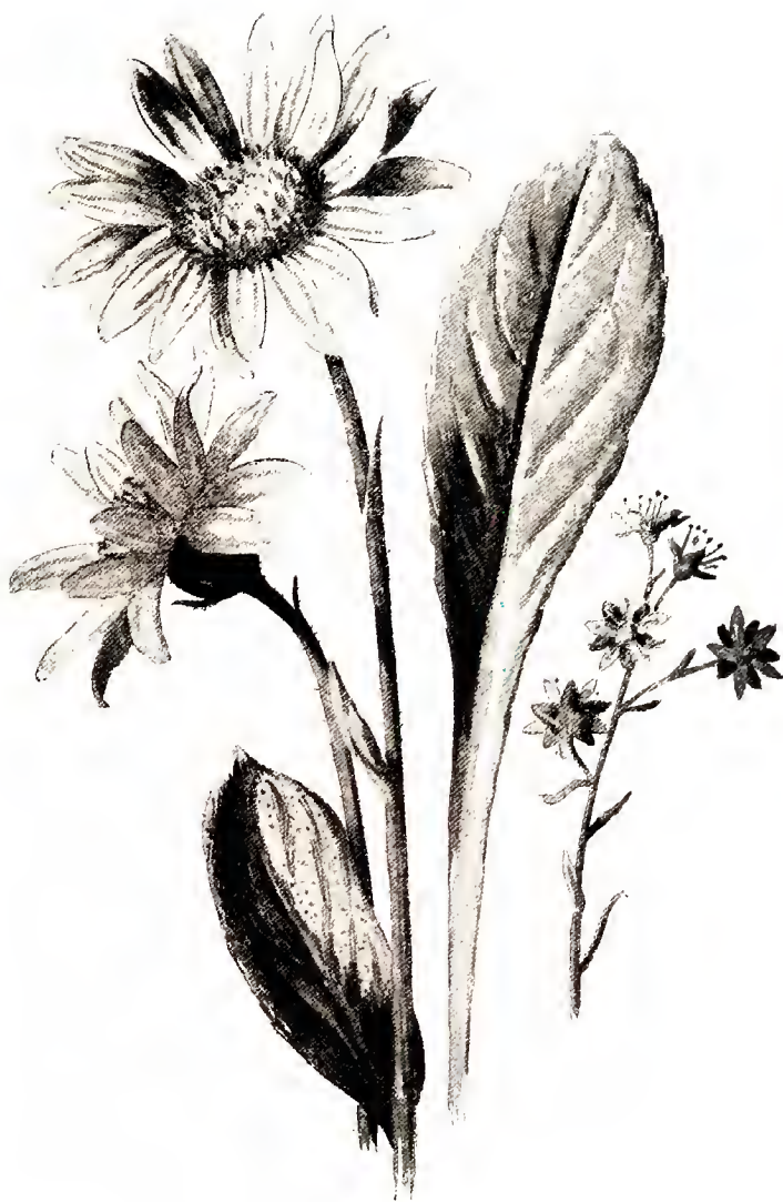
SENECIO DORONICUM and SAXIFRAGA AIZOIDES.