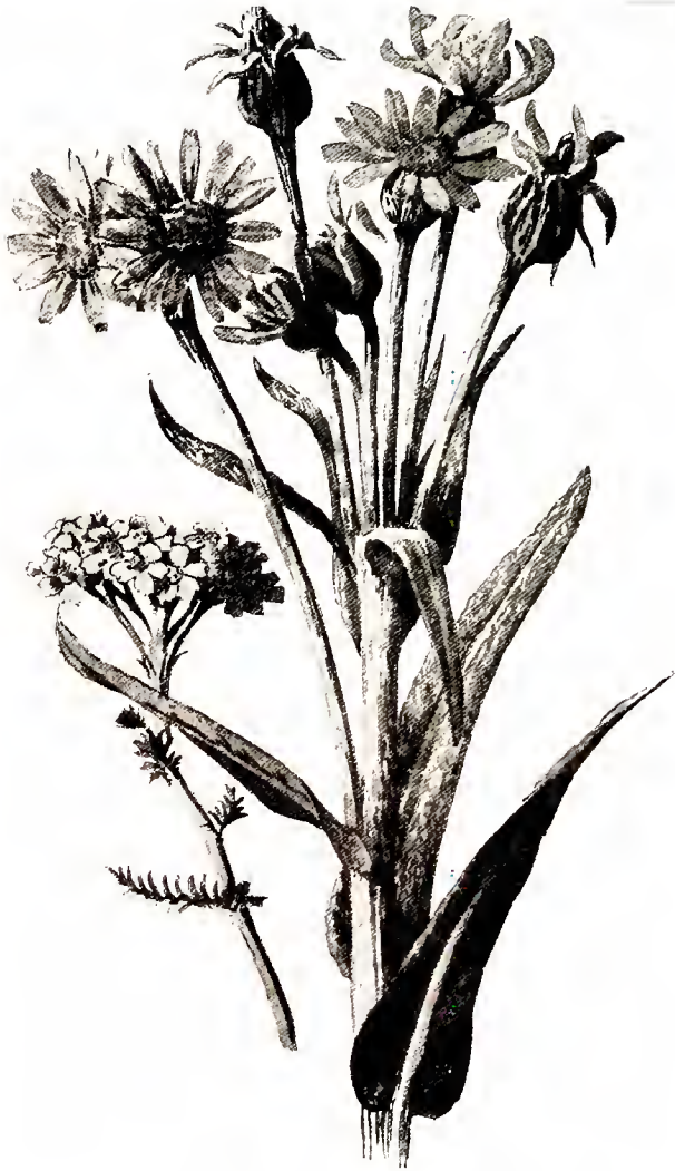
ACHILLEA TOMENTOSA and SENECIO AURANTIACUS.