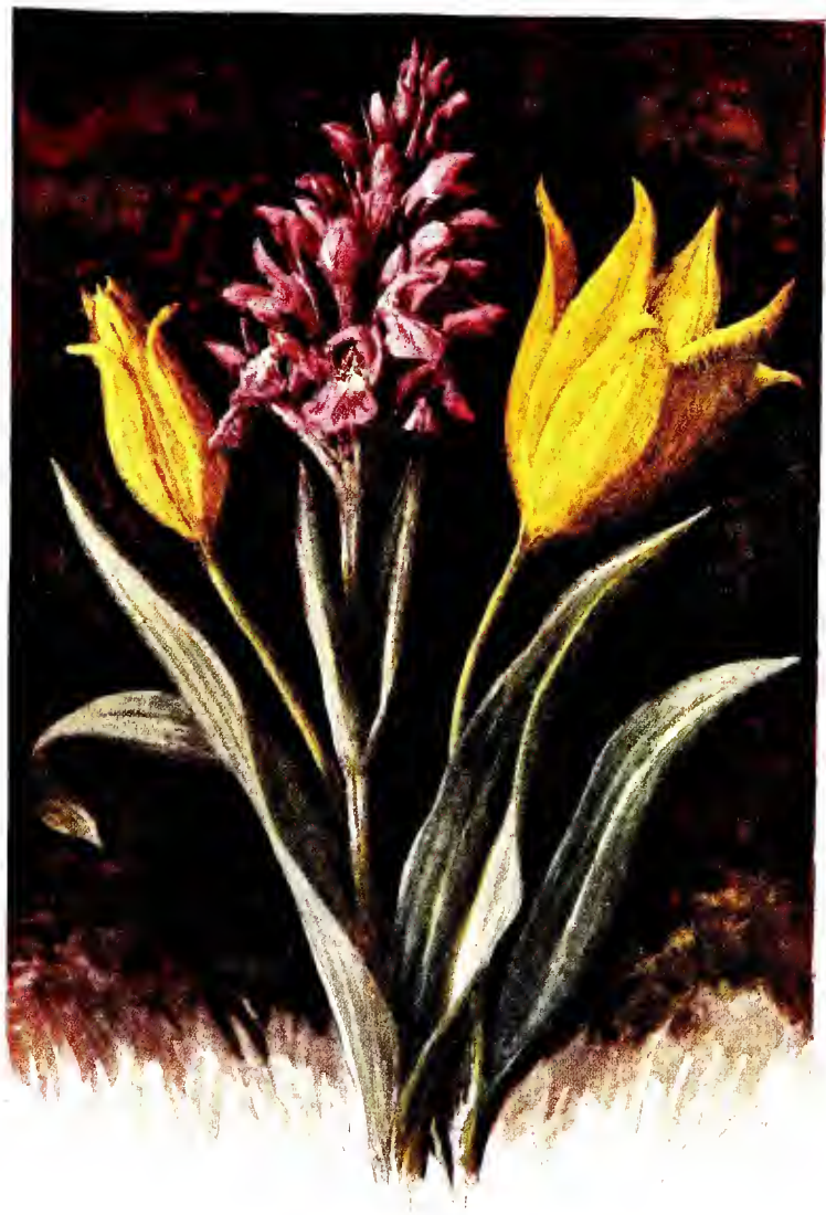
MARSH ORCHIS AND TULIP.