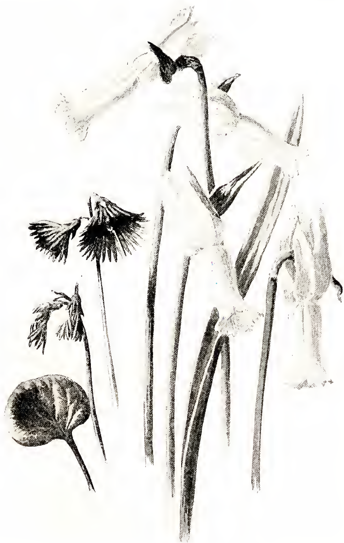
SOLDANELLA and CYCLAMEN NARCISSUS.