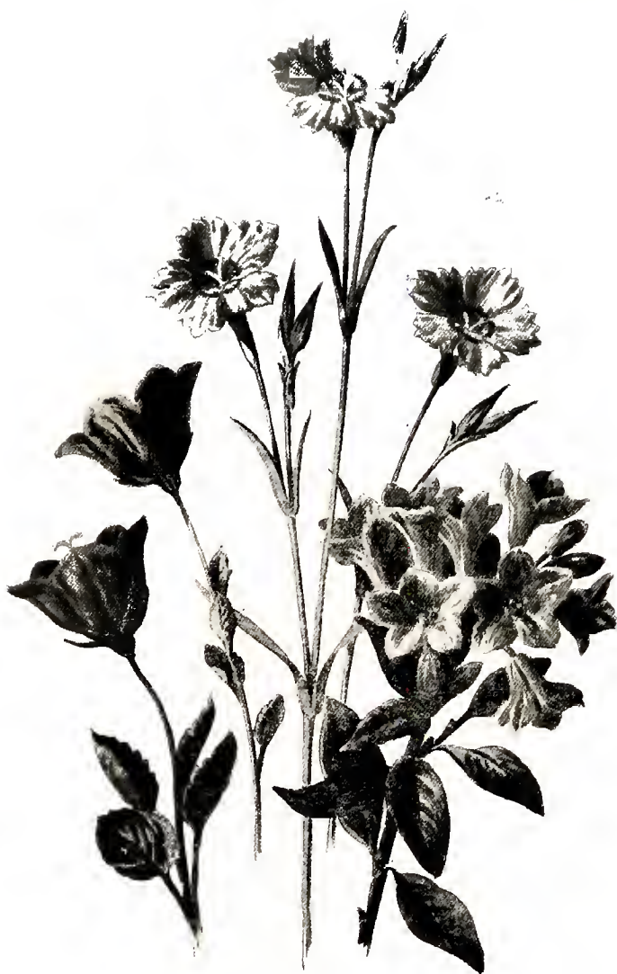
CAMPANULA REINERI, DIANTHUS DELTOIDES, and RHODODENDRON HIRSUTUM.