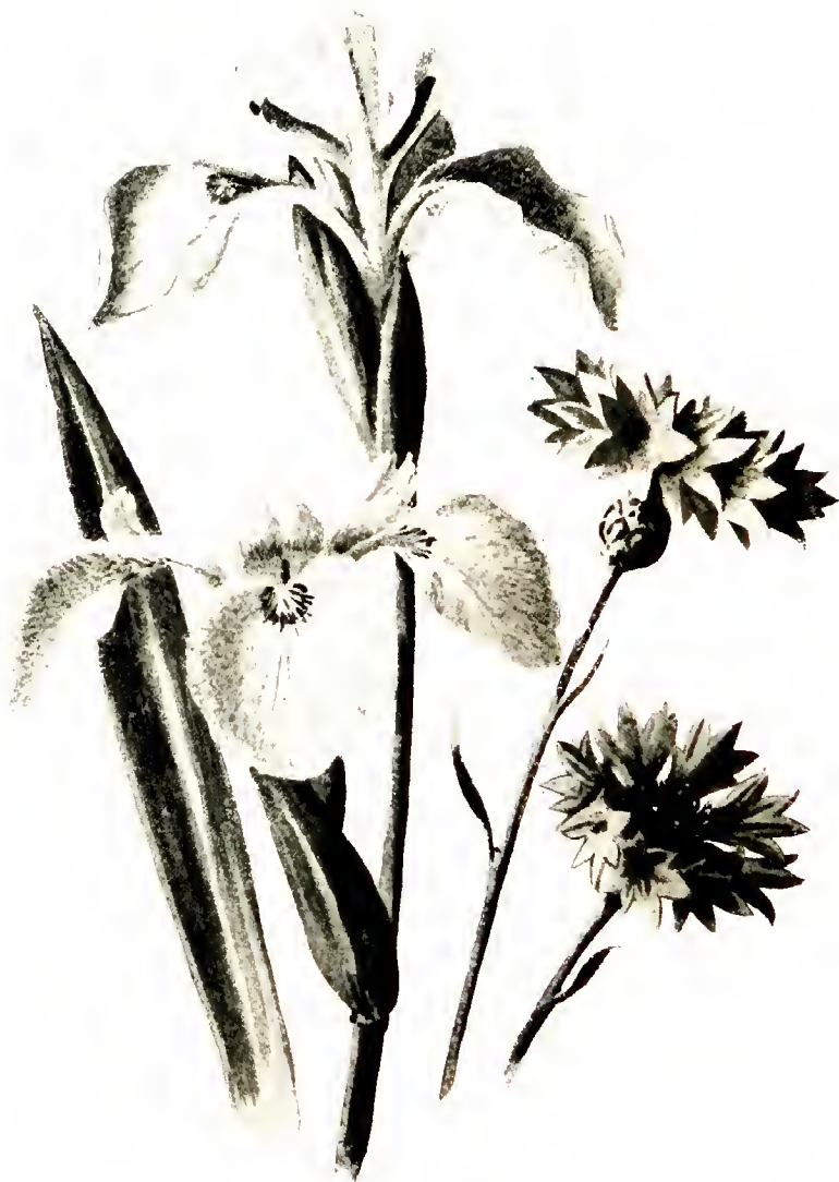
YELLOW IRIS and CORNFLOWER.