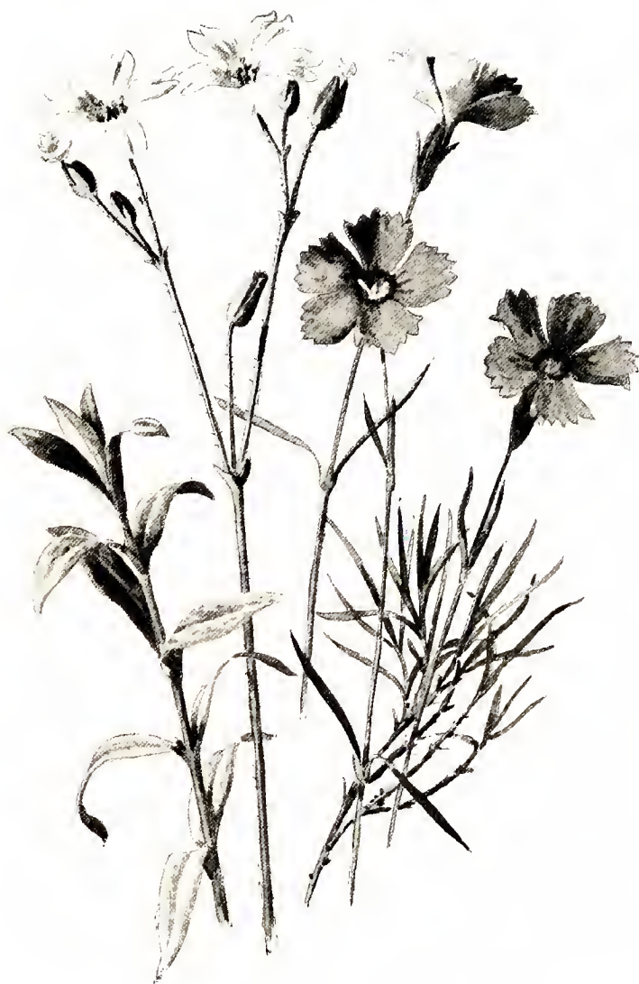
CERASTIUM GIBRALTIACUM and DIANTHUS NEGLECTUS.