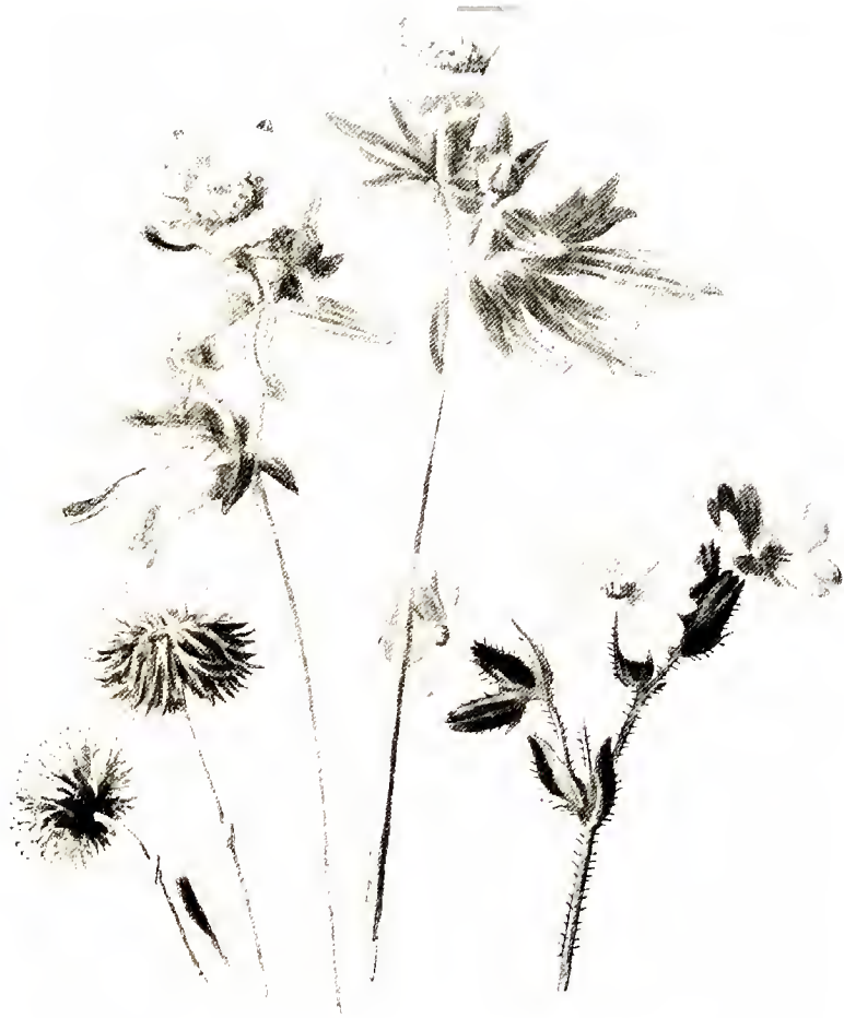
GLOBULARIA CORDIFOLIA, RANUNCULUS MONTANUS, LYCHNIS DIURNA.