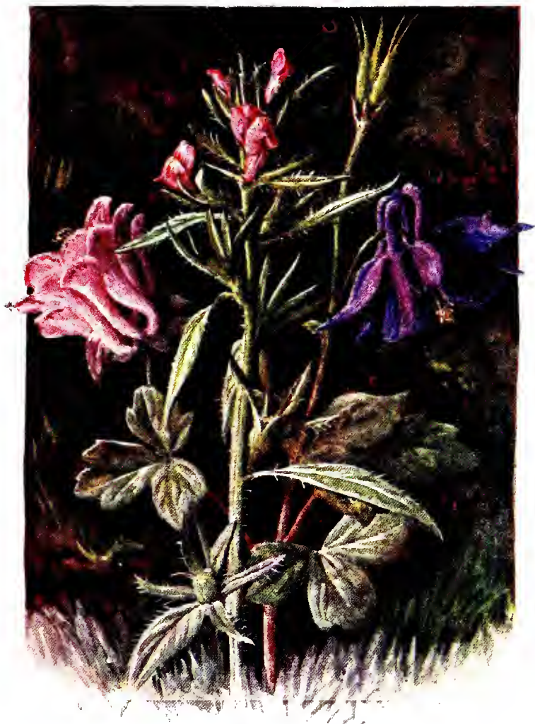
COLUMBINE and LESSER SNAPDRAGON.