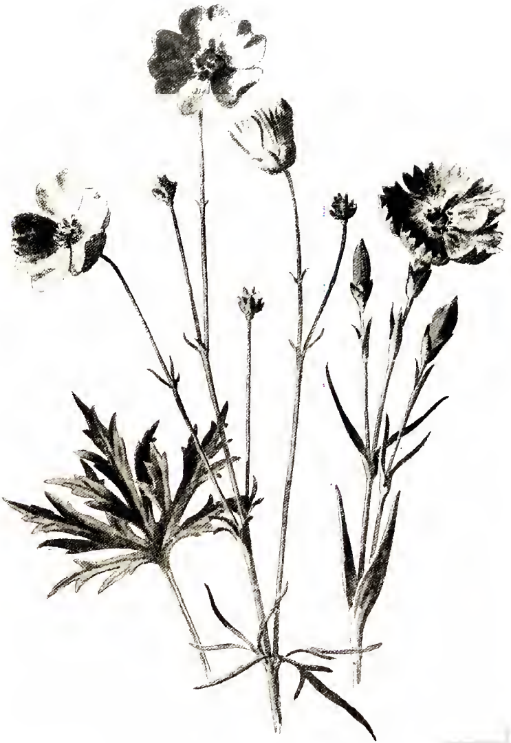
UPRIGHT MEADOW CRDWFOT and CHEDDAR PINK.