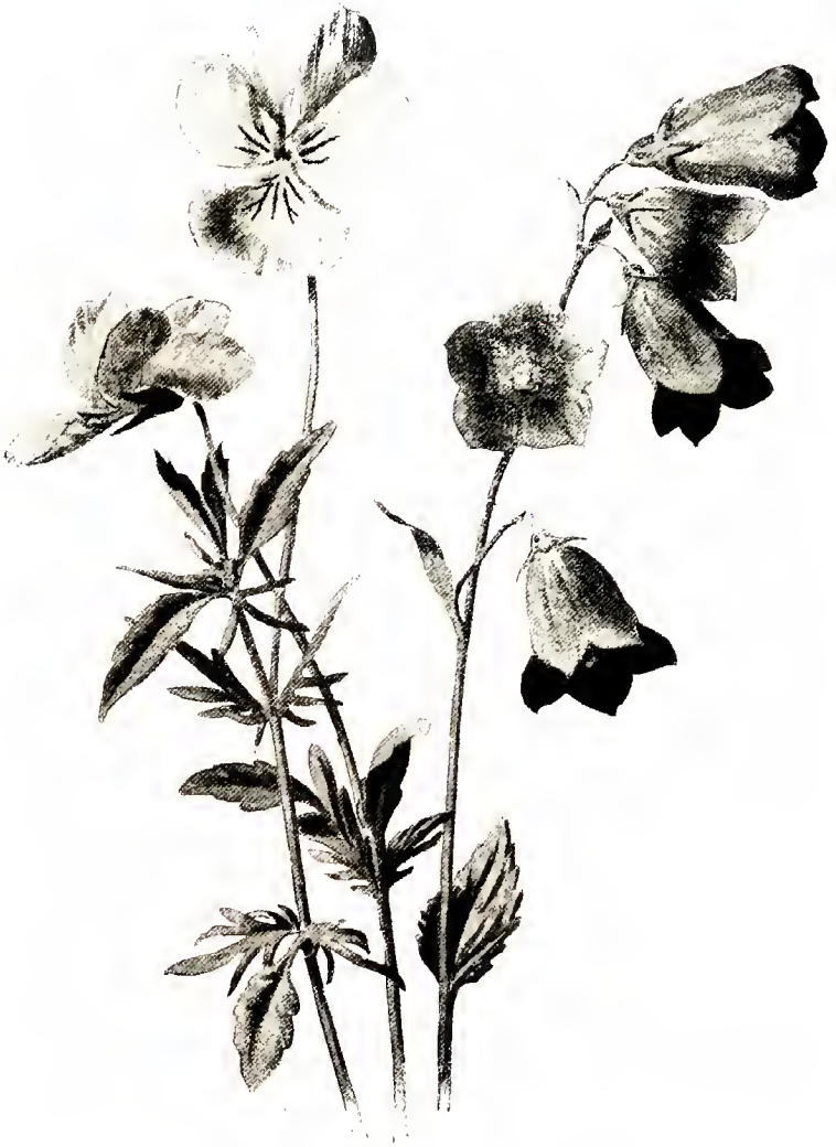
VIOLA LUTEA and CAMPANULA RHOMBOIDALIS.