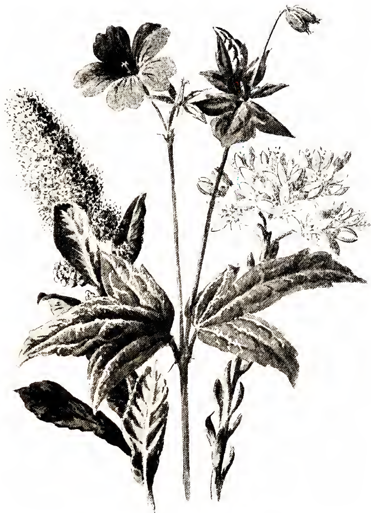
SPIRÆA TOMENTOSA, GERANIUM NODOSUM, AND SEDUM RUPESTRE.