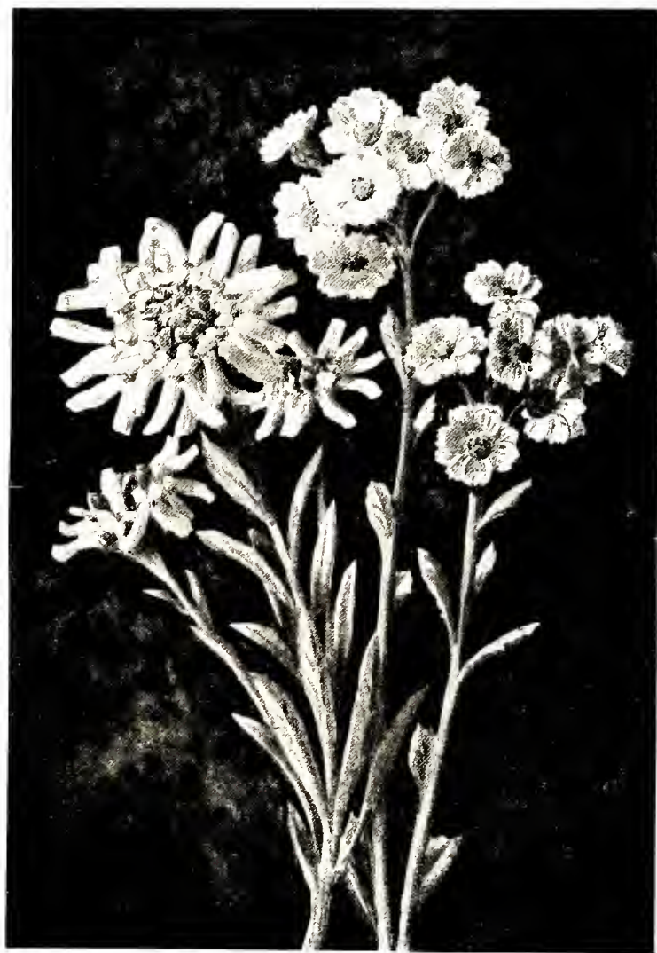
IBERIS SEMPERVIVENS and ACHILLEA RUPESTRIS.