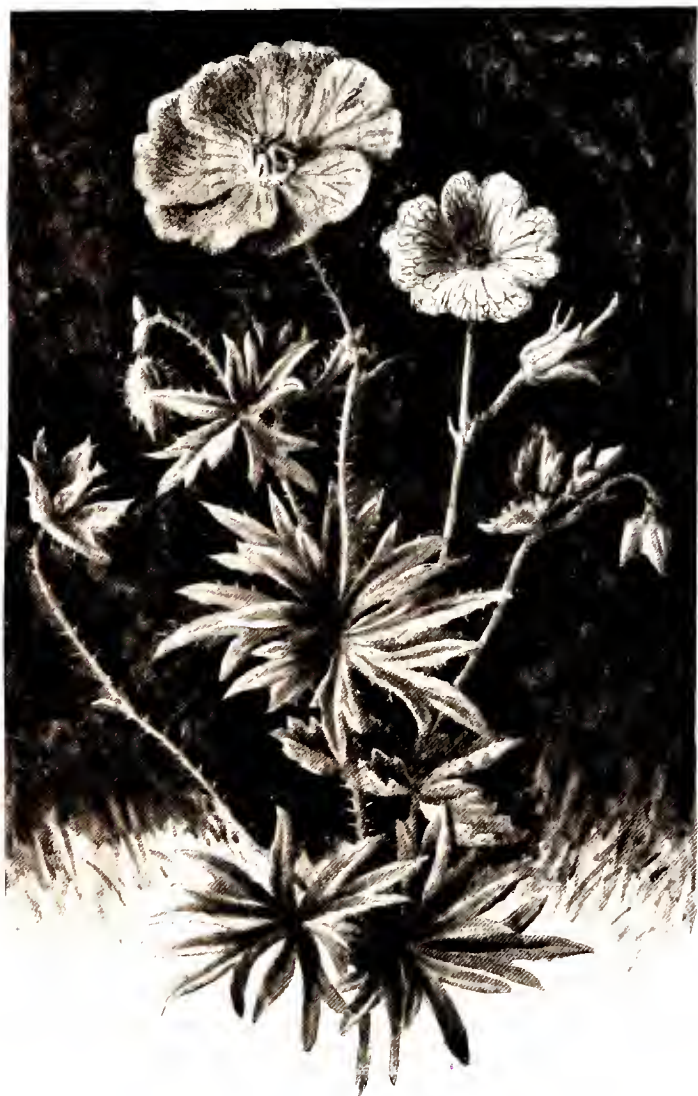
BLOOD GERANIUM and PENCILLED GERANIUM.