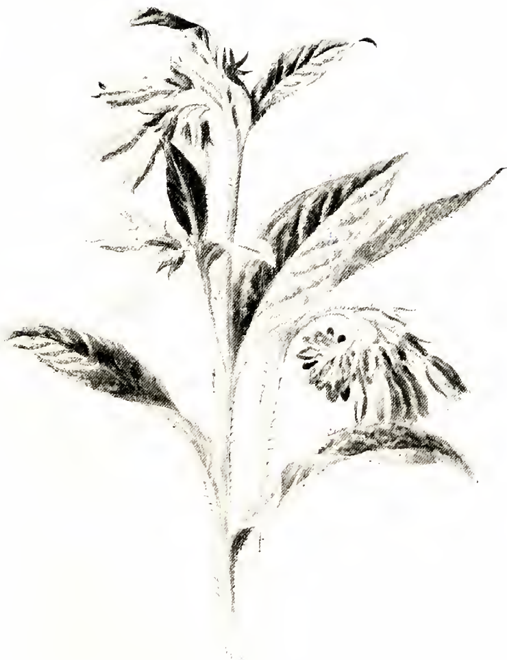
TUBEROUS COMFREY and PURPLE COMFREY.