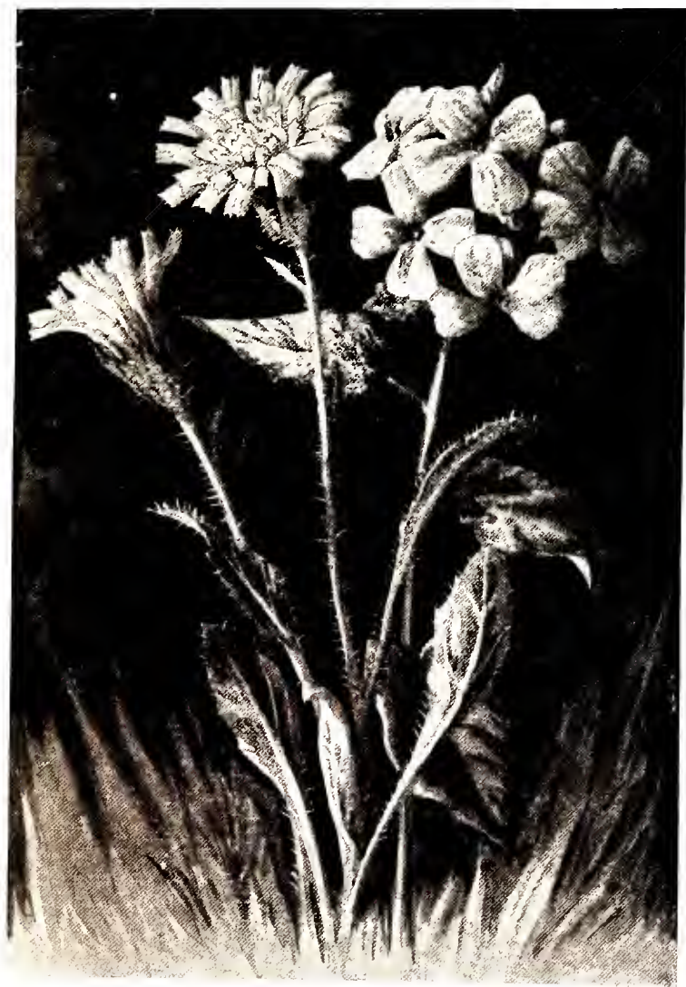
HIERACIUM INTYBACEUM and HESPERIS MATRONALIS.