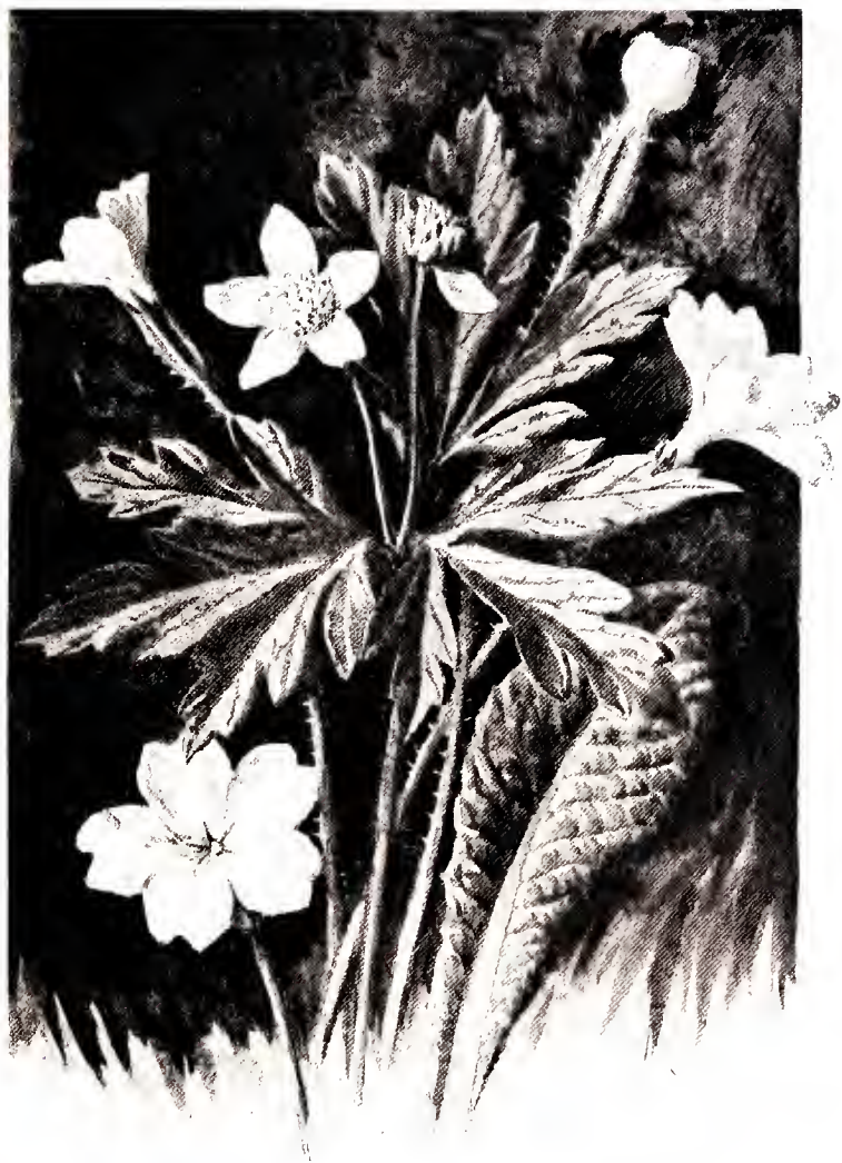
YELLOW ANEMONE and PRIMROSE.