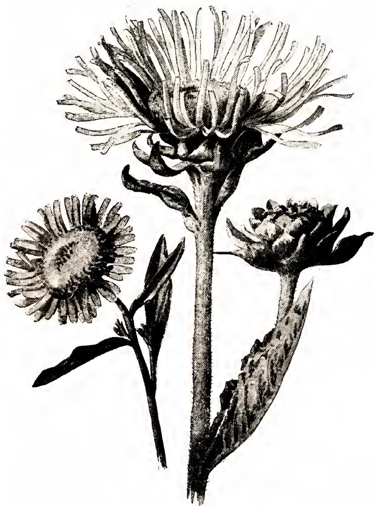
INULA MONTANA and INULA HELENIUM.