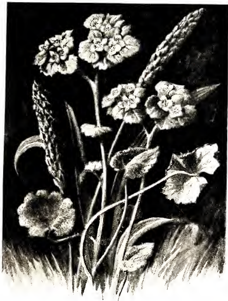
GOLDEN SAXIFRAGE and SEA PLANTAIN.