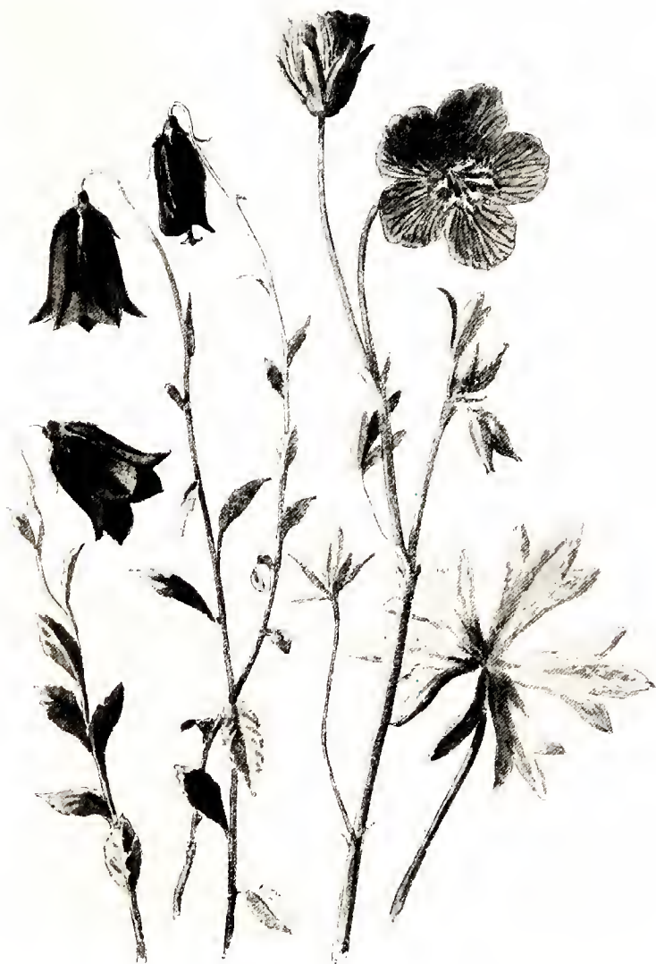
CAMPANULA PULLA and GERANIUM ARGENTEUM.