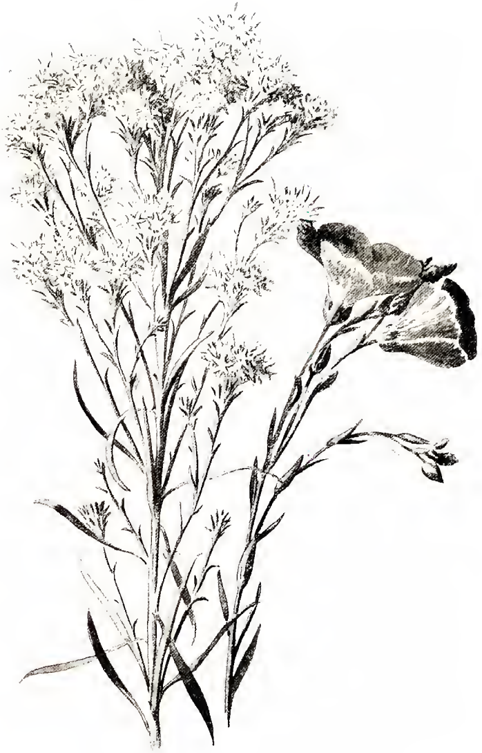
FLAX-LEAVED GOLDSLOCKS and PERENNIAL FLAX.