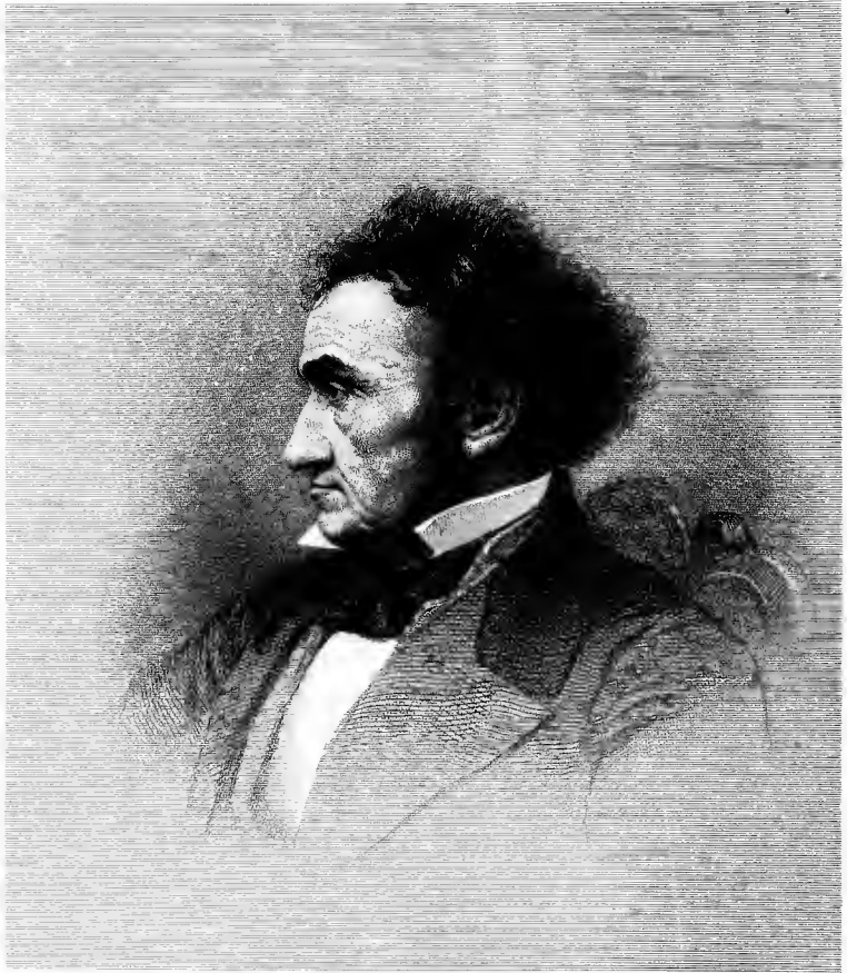
Portrait of the author from a photograph by Southworth & Hawes