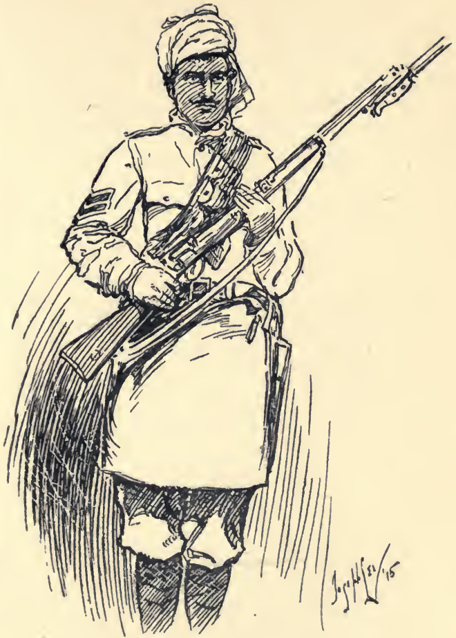
CORPORAL, 69TH PUNJABIS