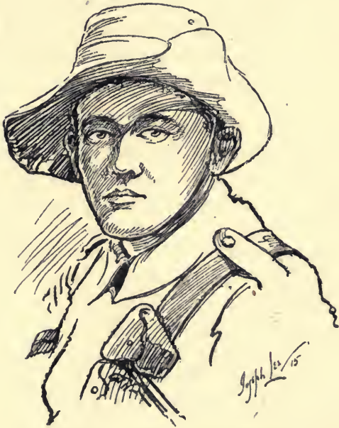
CORPORAL, GURKHA REGIMENT