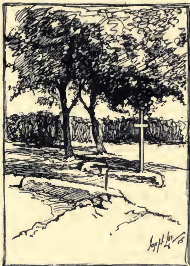
"Somewhere in France."