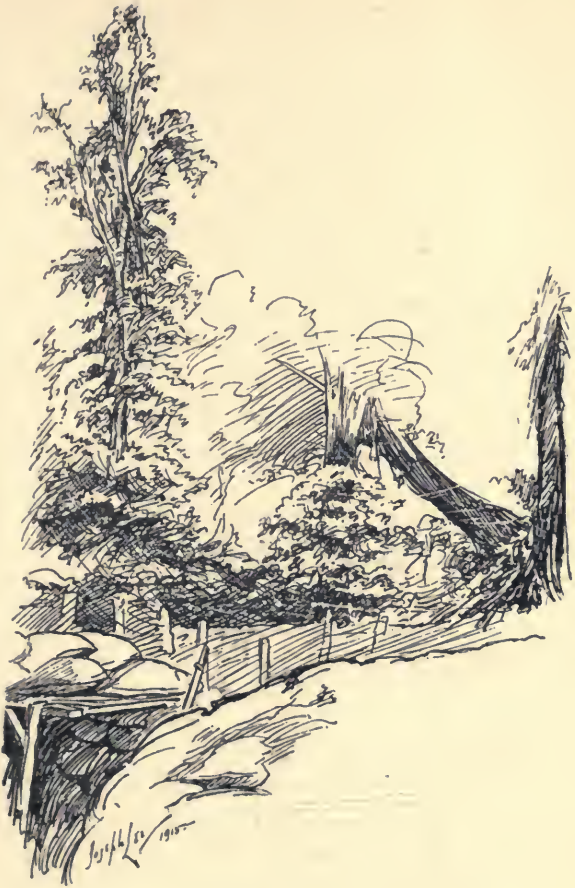
BROKEN TREES AT ERICHT REDOUBT