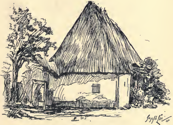
TYPICAL BARN BILLET

When in this shining steel I trace My own begrimed and hair-grown face ; A magic impress—I shall see The smile of him who sent it me !