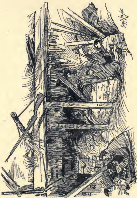
INTERIOR OF THE BARN. —"The Billet."