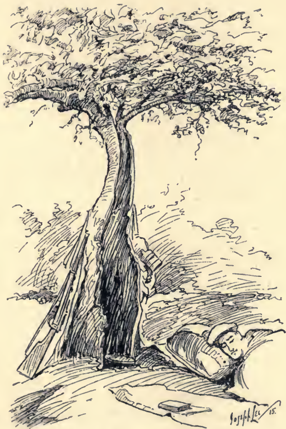
HOLLOW TREE BIVOUAC