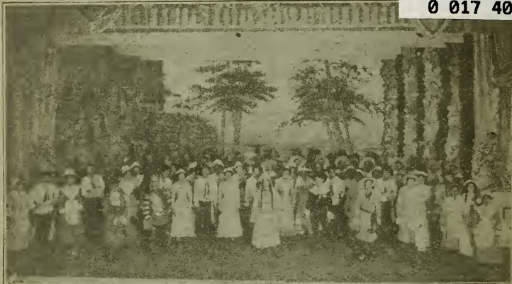
Scene from the Comic Opera, "The Captain of Plymouth"