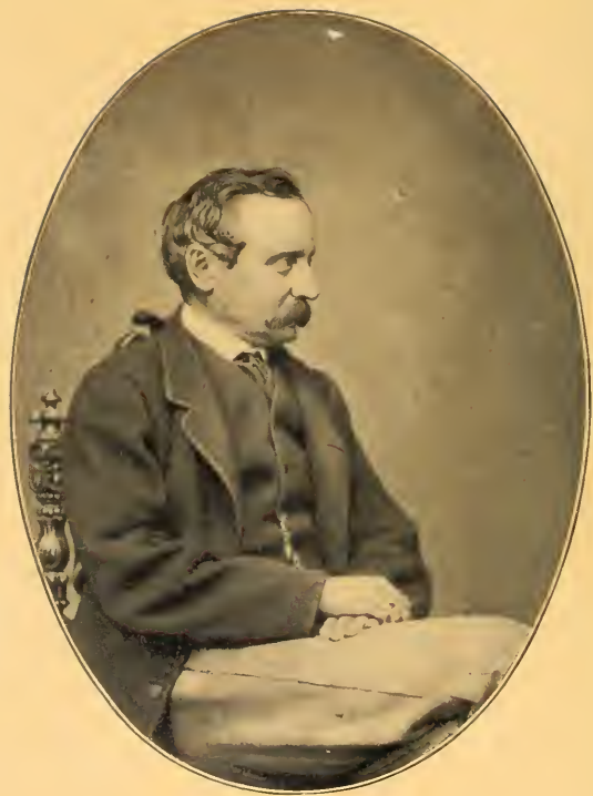
PRINCE HOHENLOHE AT THE TIME OF THE BAVARIAN MINISTRY