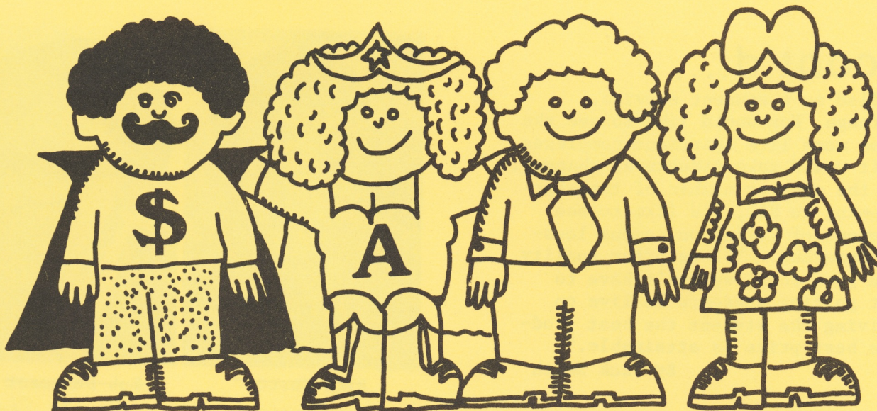
Cartoon characters in Alumni fund drive mailer are (1 to r) Milton Moneymouth, Alice Alumni, Ferris Reel and Tallulah Tingle.