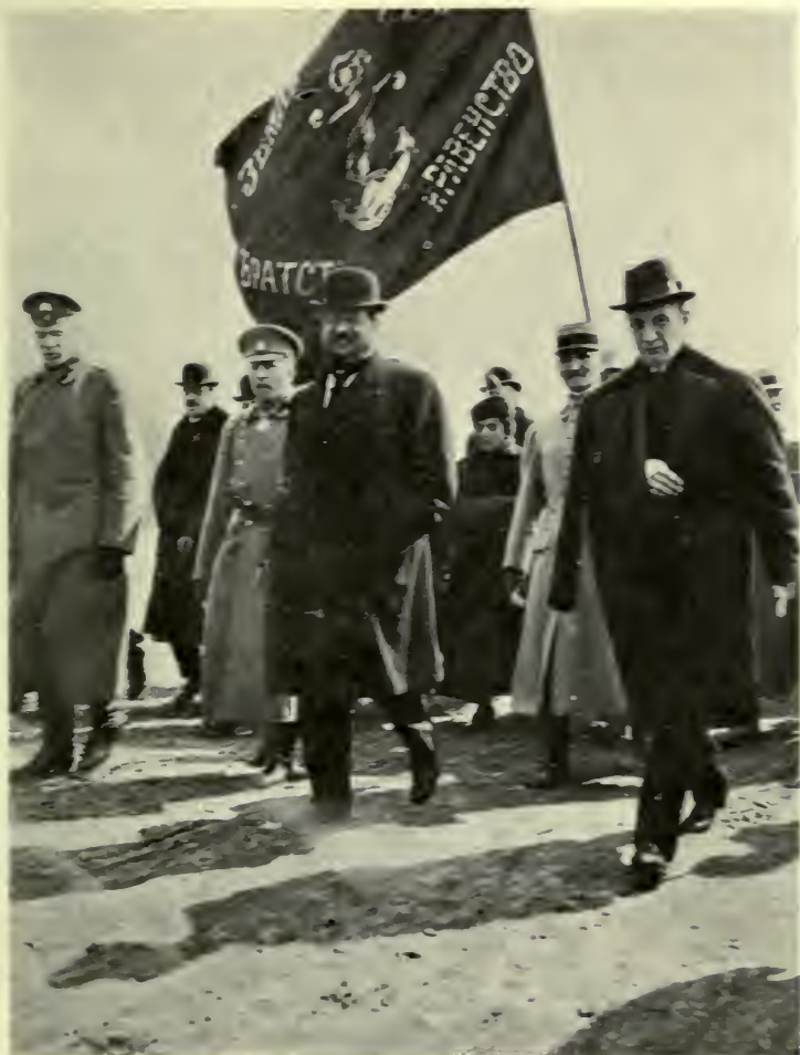
Kerensky and Albert Thomas take part in the first Fête of the Revolution.