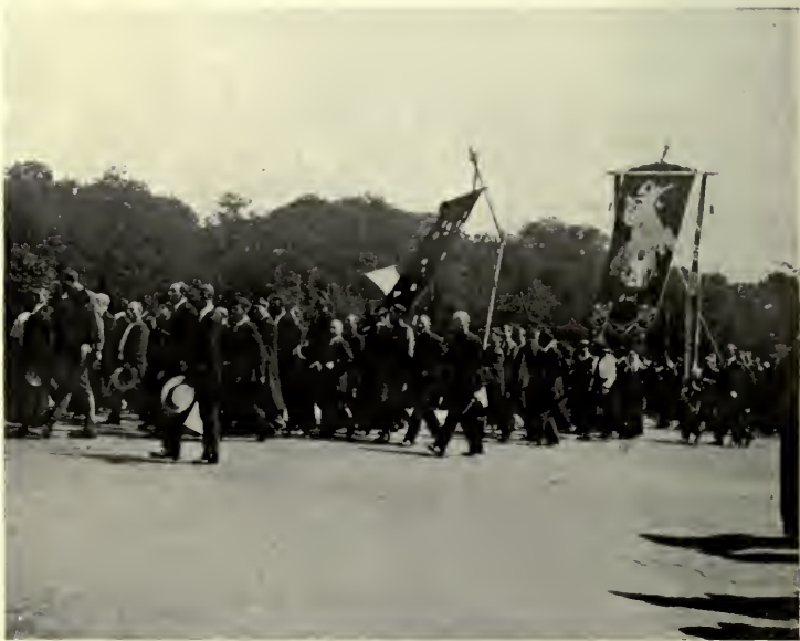
Workmen and workwomen marched in good order to the graves of their dead