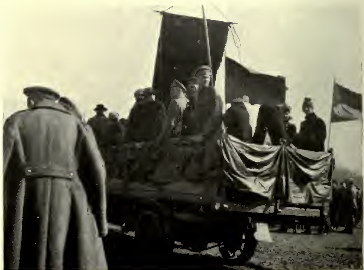
Joy ride in a decorated wagon