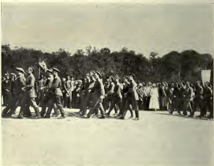
Soldiers honour the victims of the Revolution.