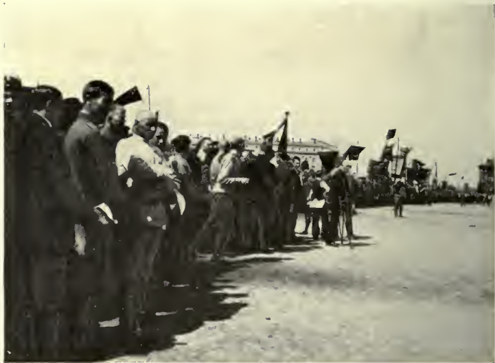
A Russian crowd keeps its own order.