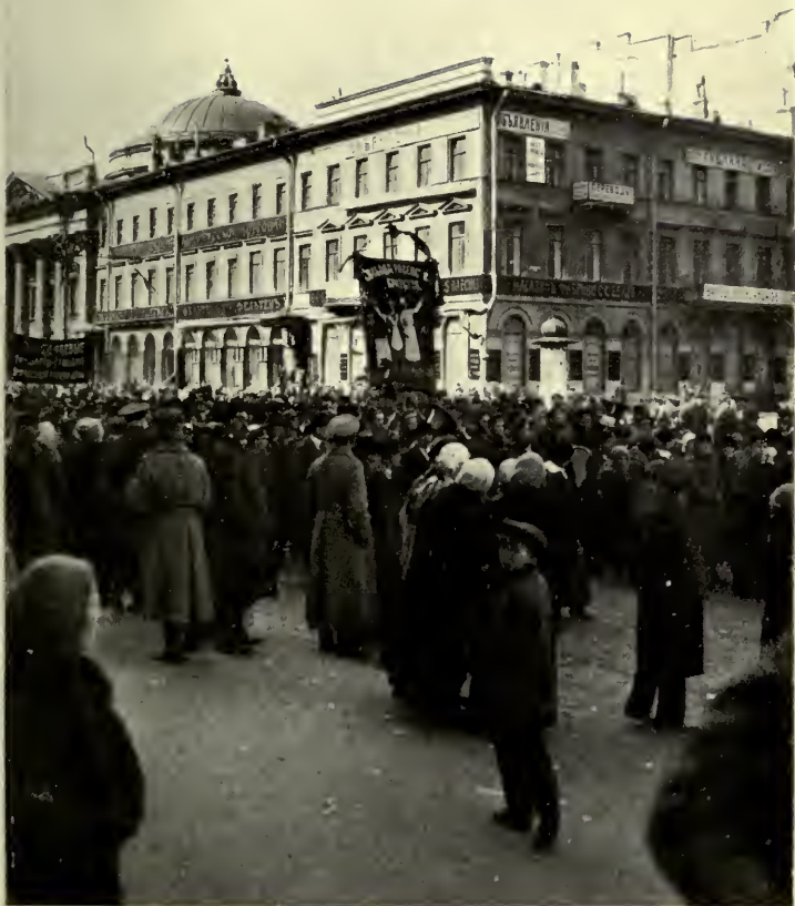
“Hundreds dragged themselves along the Nevsky. The most to be pitied—the blind—were guided by Sisters of Charity.”