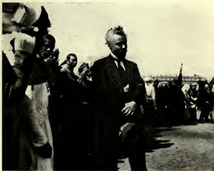
A First of May group of spectators.