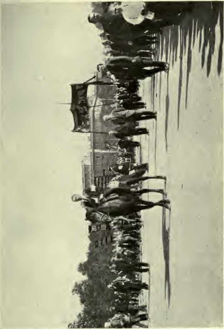
Solemn procession for the interment of the victims of the Revolution.