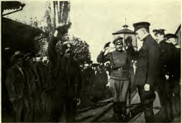
Kerensky receives a deputation.