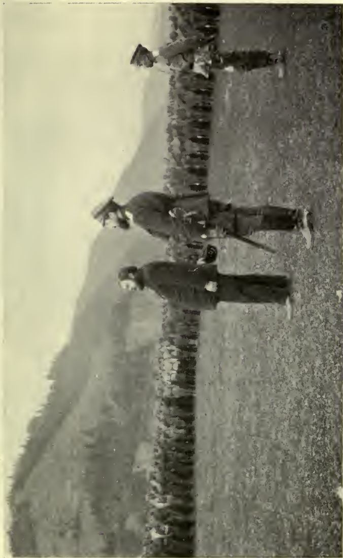
Albert Thomas addressing the troops in the Valley of the Black Teheremosche. His interpreter stands beside him. General Korniloff is on the extreme right.