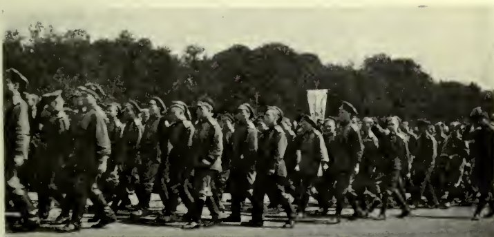
Group after group followed in this procession, which continued all day and into the evening.