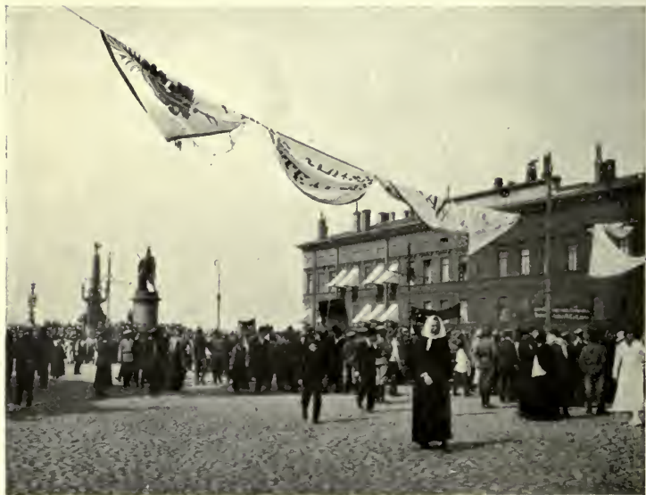
Until night fell the people of Petrograd continued to pass by.