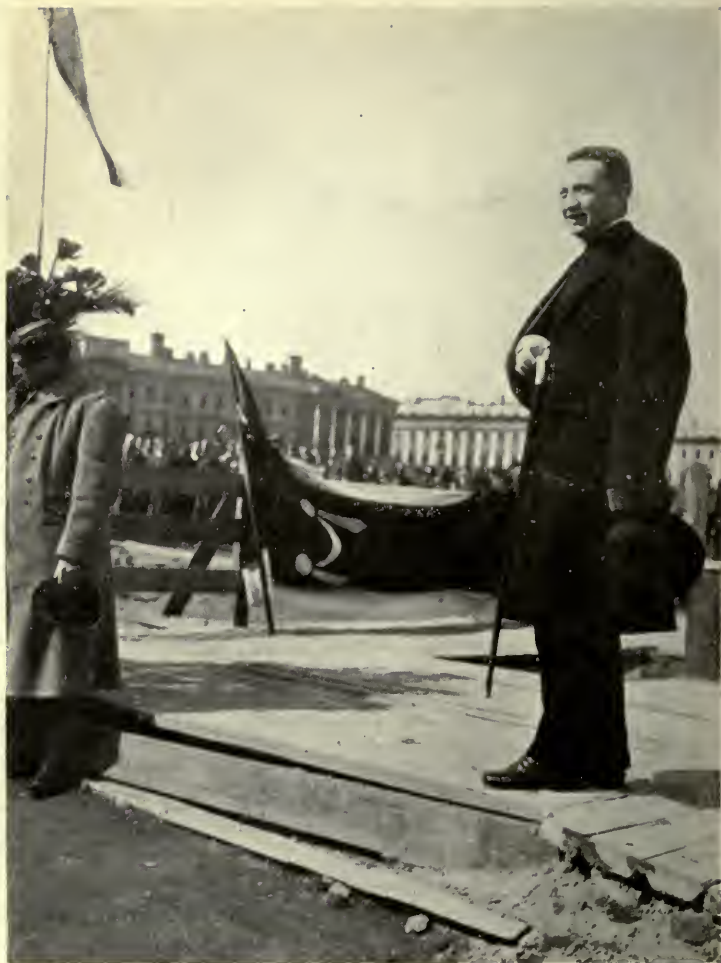
Kerensky on the Champ de Mars.