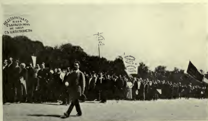
All classes of the people were represented.