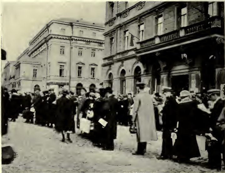
Many lingered in the snow-covered square