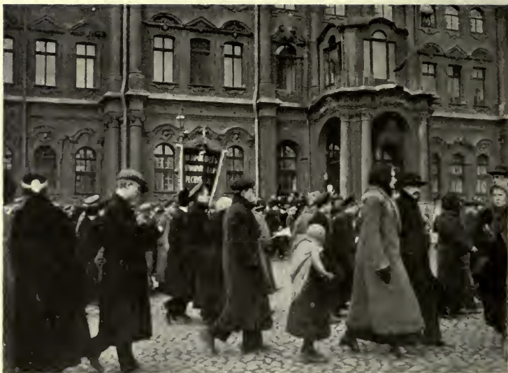
The costumes of the East and the West blended in the First of May procession. The woollen headshawl worn by women is typically Russian