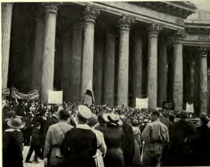
Each group was commanded by a chief, who carried a white flag.