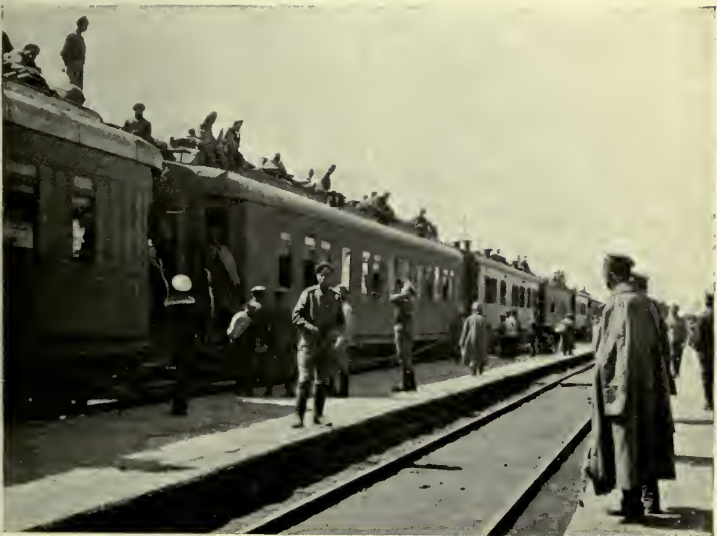
“Soldiers’ liberty”—rushing the trains to the exclusion of civilians.