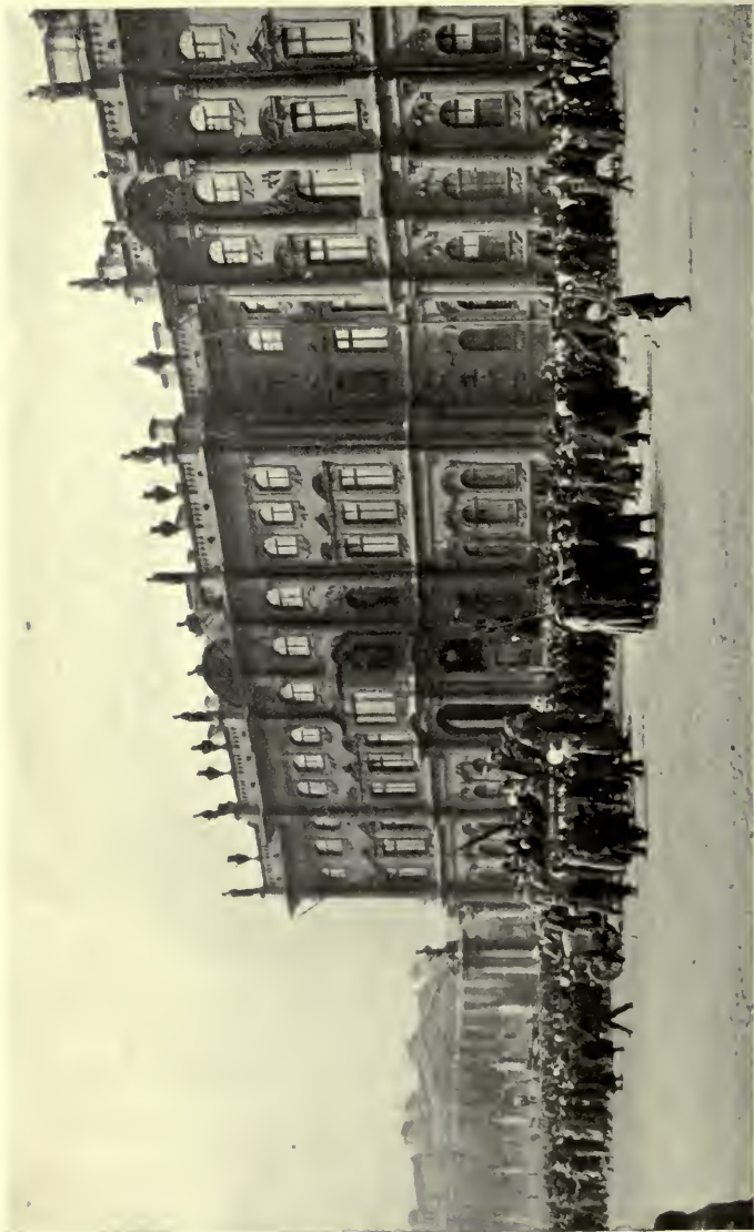
Bands played before the Winter Palace for the Great Fête.