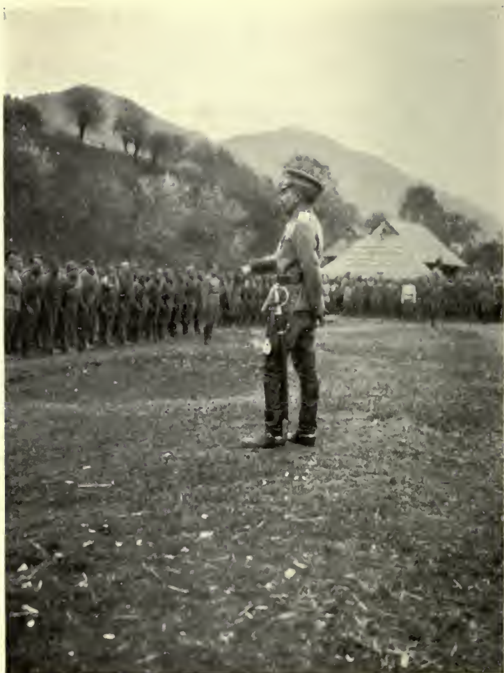
“General Korniloff spoke to his soldiers as a chief, as a father.”