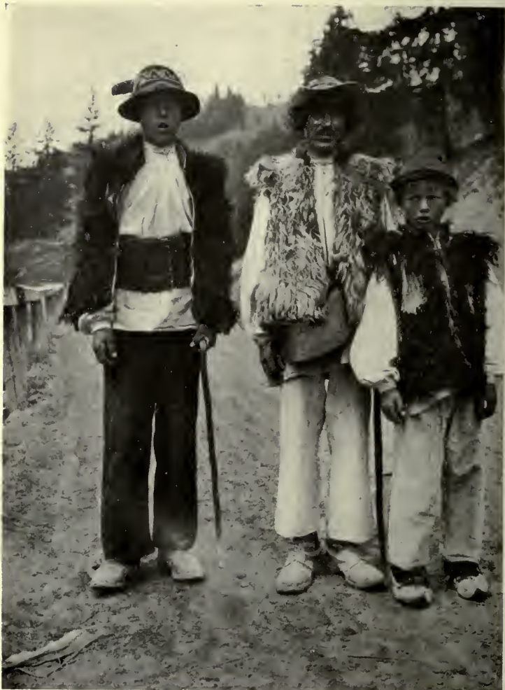
Peasants in distinctive national costumes.