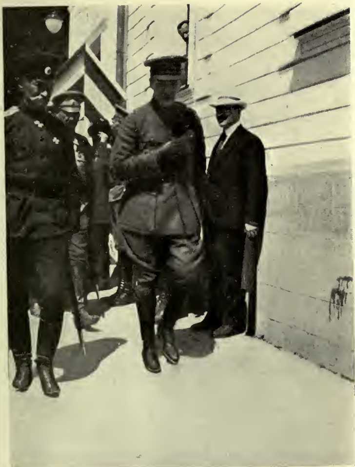
Kerensky and General Brussiloff at the General Headquarters on the South-East Front.