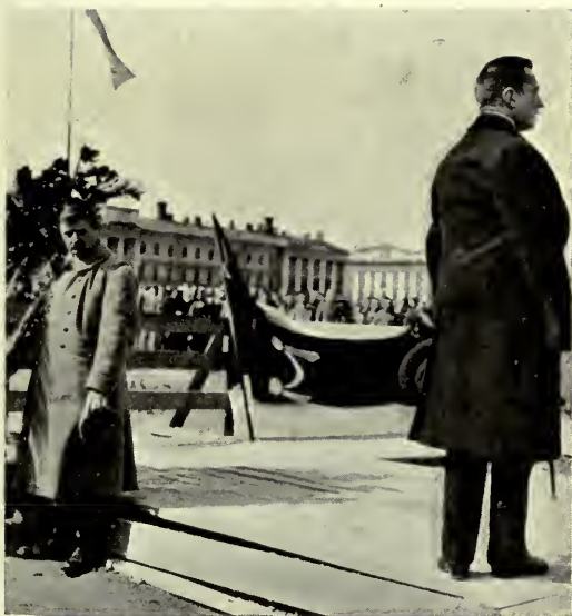
Kerensky addressing the crowd at the Fête celebrating Liberty.