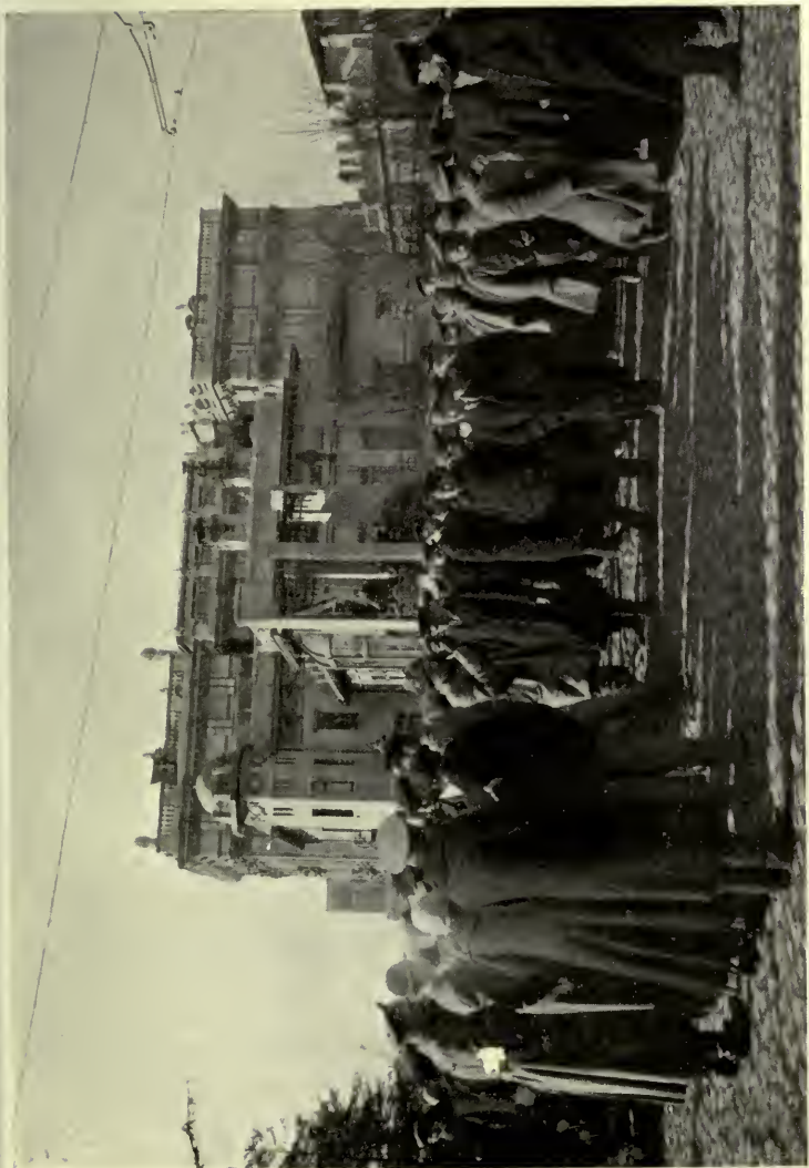
Ksessinschaika Mansion, from which Lenin, the German propagandist, delivered his speech as a Social Democrat.