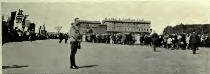
Champ de Mars, where the victims of the Revolution were buried.