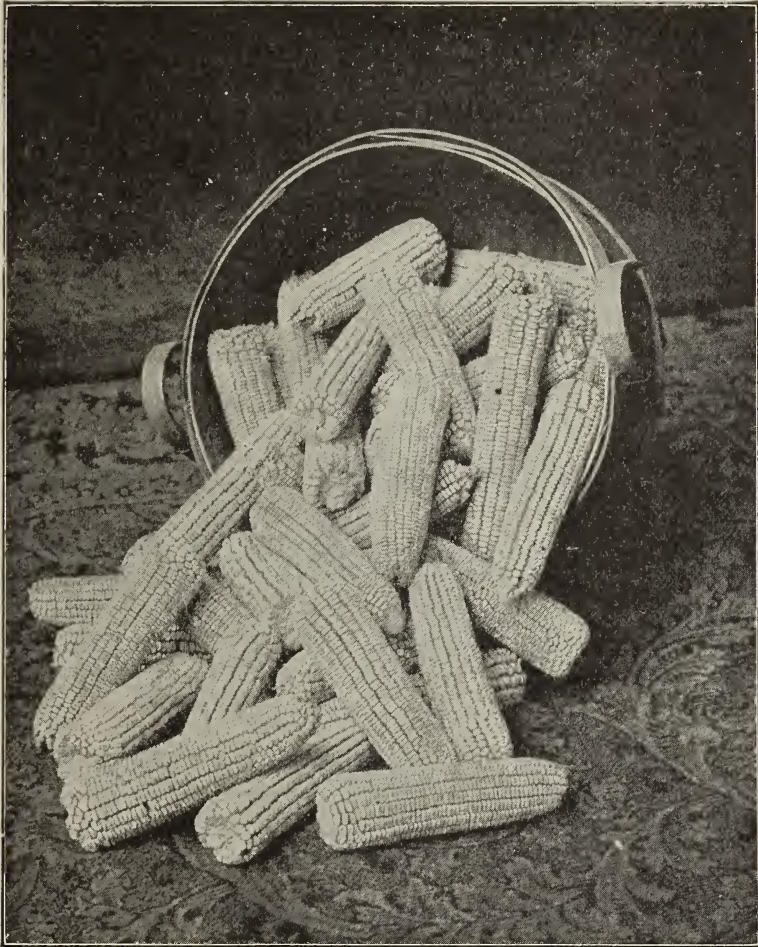
YELLOW DENT, SEED CORN.

A good variety. Ears are of handsome appearance; rich yellow, wedge-shaped kernels packed closely on the cob from butt to tip. This corn matures in 80 to 90 days under average conditions. Sample ear, 15c; one pound, 25c; peck, shelled, 85c; half bushel, $1.50; bushel, $3.00. F. O. B. Leslie.