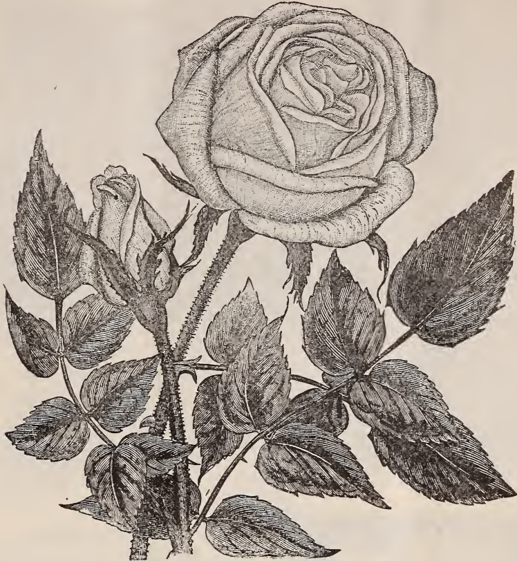
Perle des Jardins. —See description and price, page 6.

These are undoubtedly the most satisfactory Roses grown, as they bloom so freely from the time they are set out until frost. They are not entirely hardy, but many of them will stand an ordinary Northern Winter by covering them with straw or leaves, which can be but about December or on the approach of very severe weather, and should not be taken off until all danger of severe frost is over in the Spring, and when this is done they should be well pruned, which keeps the plant in good shape and induces a strong healthy growth the next season; 10 cents each, or where selection is left to us, $1.00 per dozen.