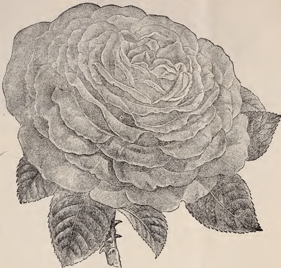
Type of Bennett's Hybrid Tea Roses.