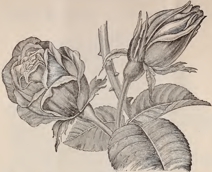
Souv. de Mad. Pernet.—See description page 6.