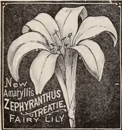
(One-half of natural size.)

Would make a nice present to distant friends to whom we would gladly mail them on receipt of price.