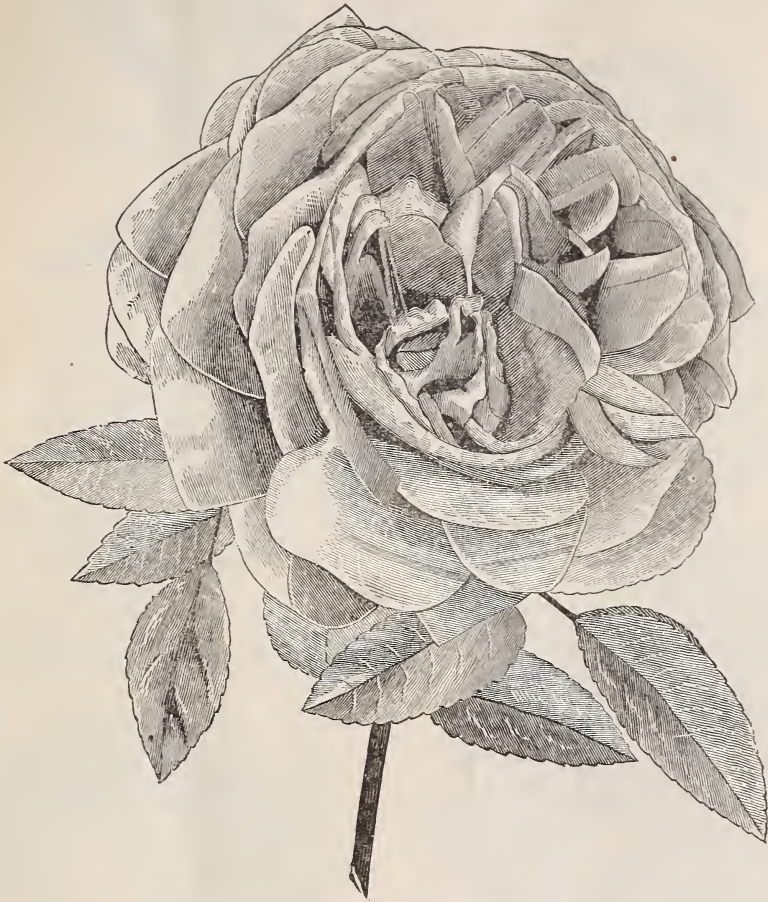
Specimen Flower of Hybrid Perpetual Rose.

Alfred Colombe —A splendid Rose, large, globular form, full and very sweet, bright clear cherry red, shaded with rich crimson; 50 cents.