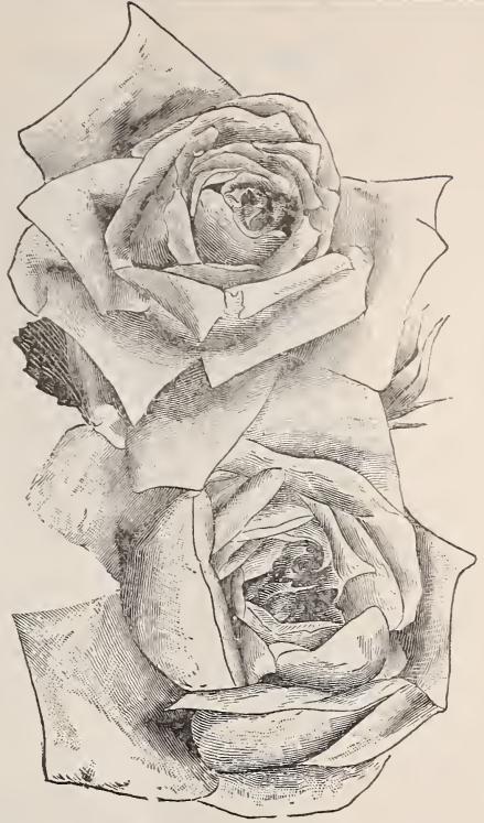
Hybrid Tea, La France.—See description page 4.

Marechal Niel —What shall we say of this Rose? A grand Rose, and could every one who reads this, step into our house a little later in the season and see the parent plant from which we take thousands of cuttings every year, it would, I know be a rich treat; during the last three years, we have taken nearly 10,000 buds, one year, 3,608. It is about eleven years old, and to-day is just as thrifty and healthy as ever it was, it is our pet. Beautiful golden yellow, does well South in many places as a Trellis Rose. Under glass it is without doubt the finest Rose grown of its kind. Immense buds, double, where you have the little greenhouse or other necessary requisites, this is the Rose of all others you will want.