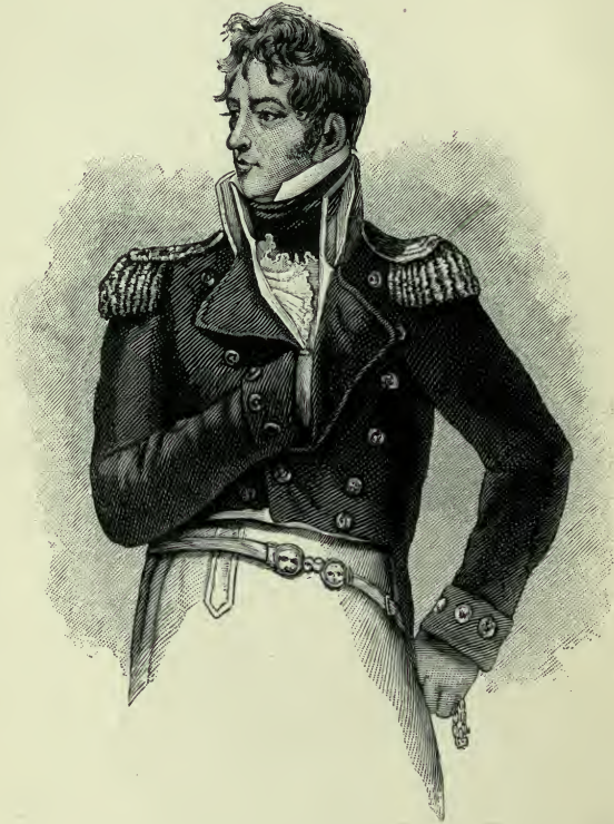
THE EARL OF DUNDONALD