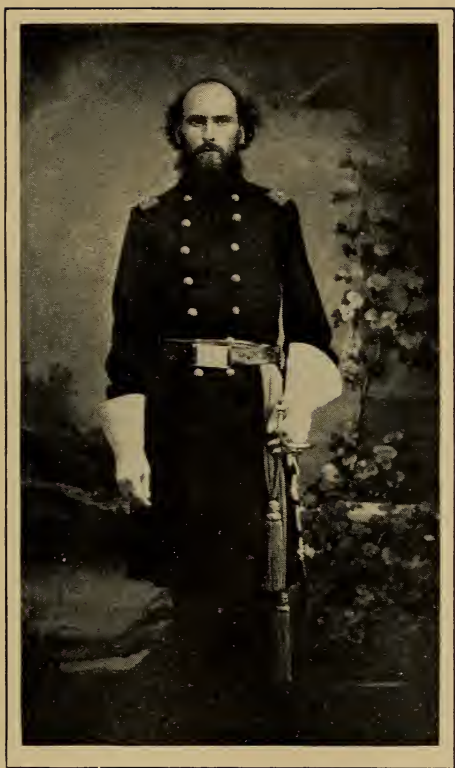
COLONEL SAMUEL J. CRAWFORD