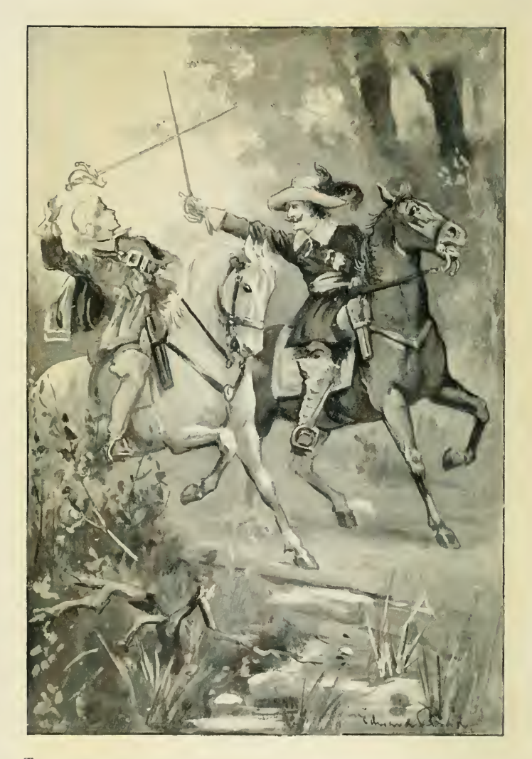
THE RAPIER OF THE CAVALIER, STRUCK FROM HIS GRASP, FLEW OFF. Front. No Quarter.] [p. 19.