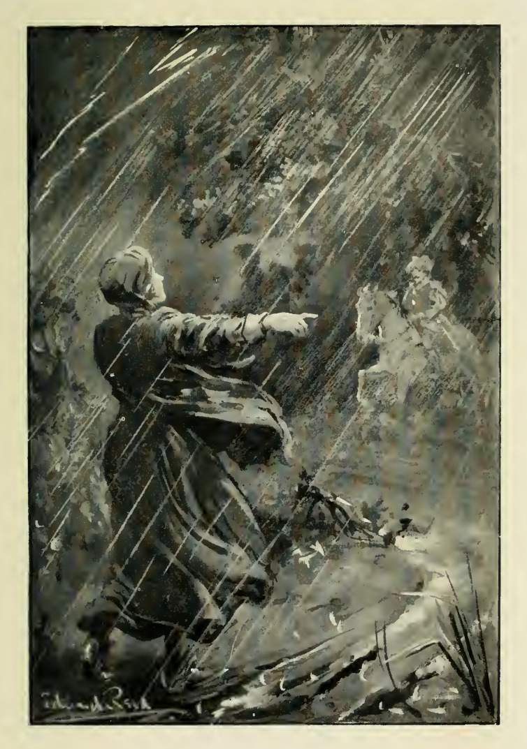
A SOLITARY FIGURE CAME GLIDING ALONG.