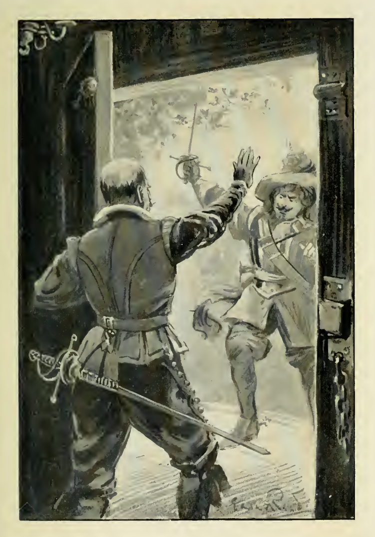
"You'LL HAVE TO BREAK IT IN FIRST," HE ADDED.