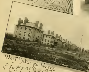
West Detached Wards Employees' Quarters.