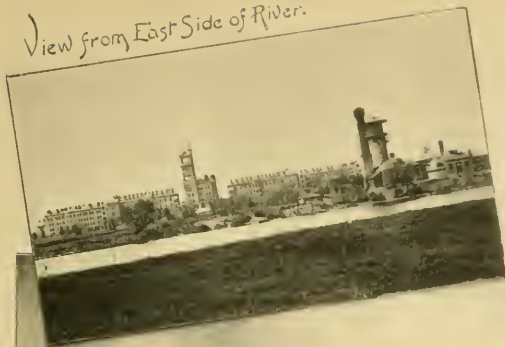
View from East Side of River.