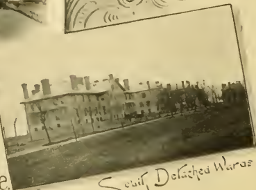
South Detached Wards