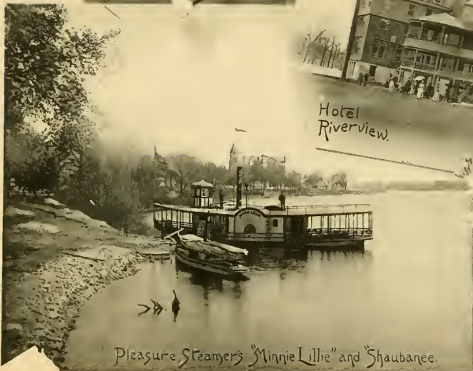
Pleasure Steamers "Minnie Lillie" and "Shaubanee."