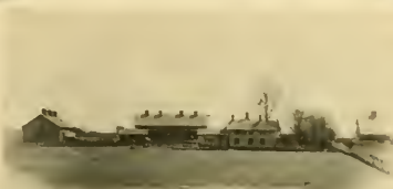
Farm Buildings. Eastern Illinois Hospital FOR THE Insane.