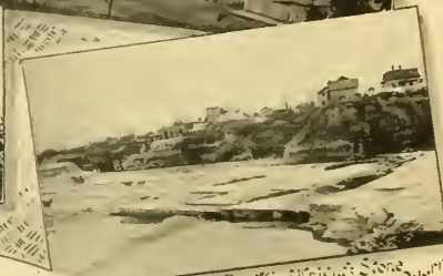
Portland Portland Stone Quarries