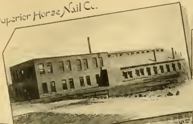
Superior Horse Nail Co.