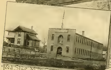
Red Shoe Mfg. Co.