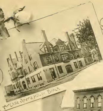
Arcade Opera House Block