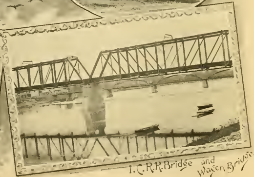
I. C. R. R. Bridge and Wagon Bridge.