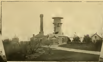
Water and Gas Works.