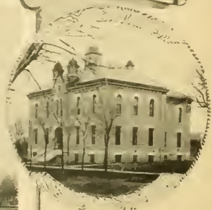
First Ward Public School.