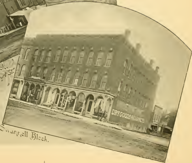
F. Swannell Block.