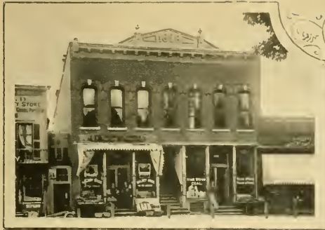
E. Powell Block.