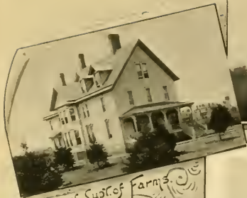
Residence of Supr. of Farms.