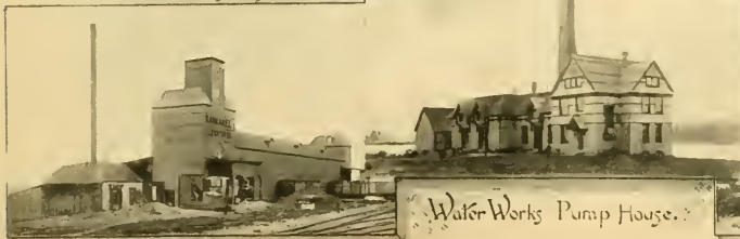
Water Works Pump House