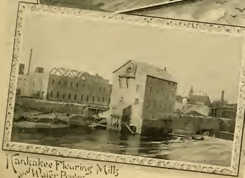
Kankakee Flouring Mills and Water Power.