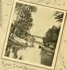
Rock Creek Bridge.