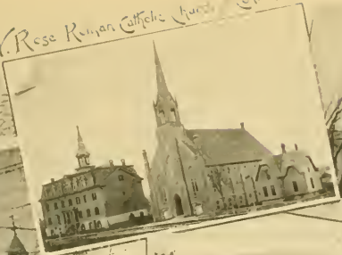
St. Rose Roman Catholic Church