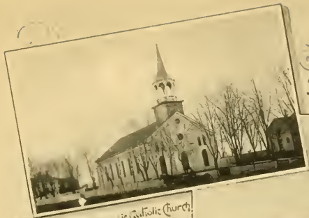
Bourmont's Catholic Church.