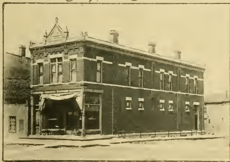
J. Lecour Building