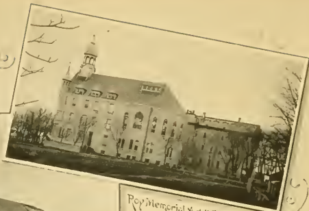
Pop Memorial Addition St. Viateur's College.