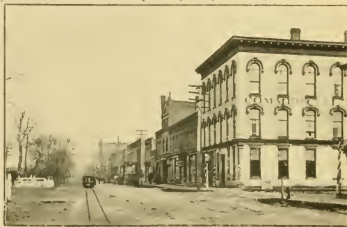
View on East Avenue.