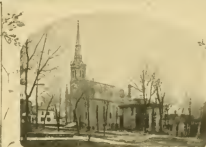
St. Paul's Evangelical Lutheran