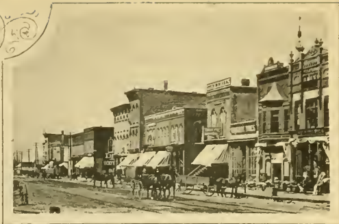
View on East Court St.