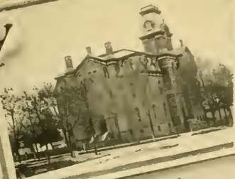
Kankakee High School.