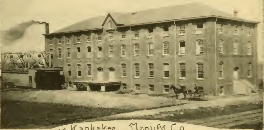
The Kankakee Manufg. Co.