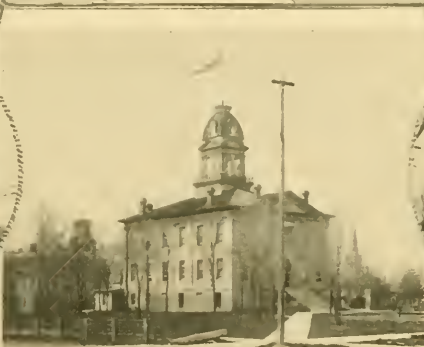
Kankakee County Court House.