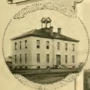
South Side Public School.