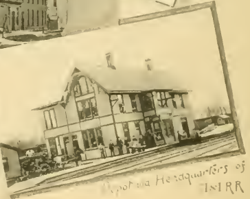
Photonia Headquarters of T&I RR