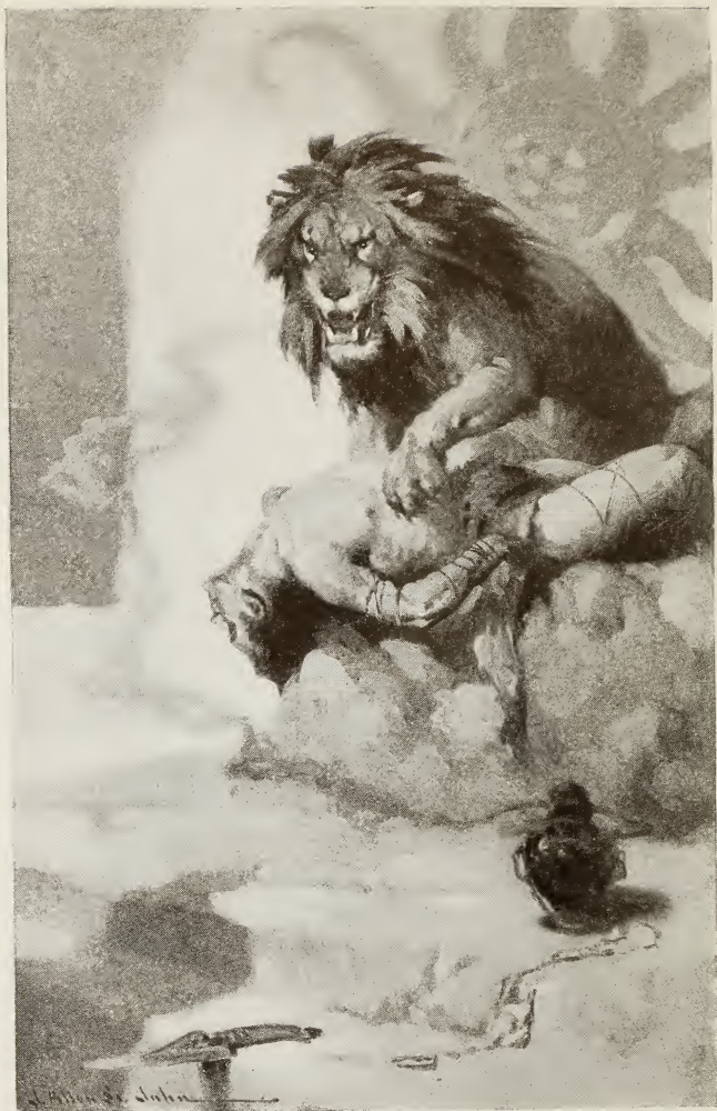
Standing above him was Jad-bal-ja, the Golden Lion