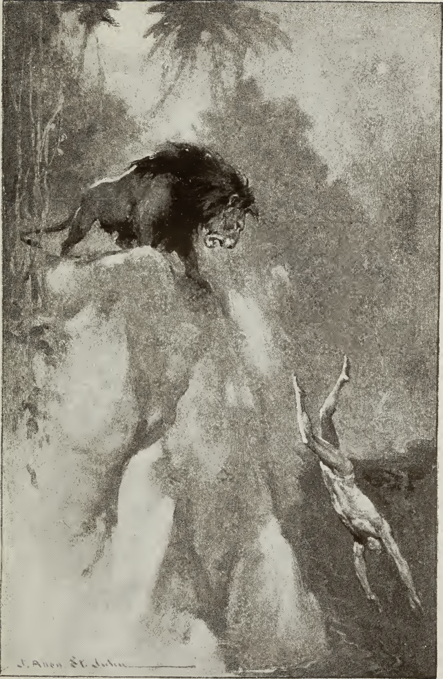
With a cry of terror the Spaniard dived into the river