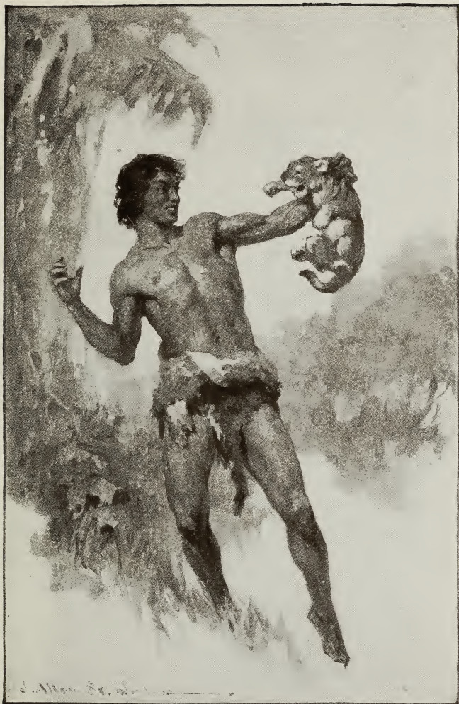
He caught the little lion by the scruff of its neck