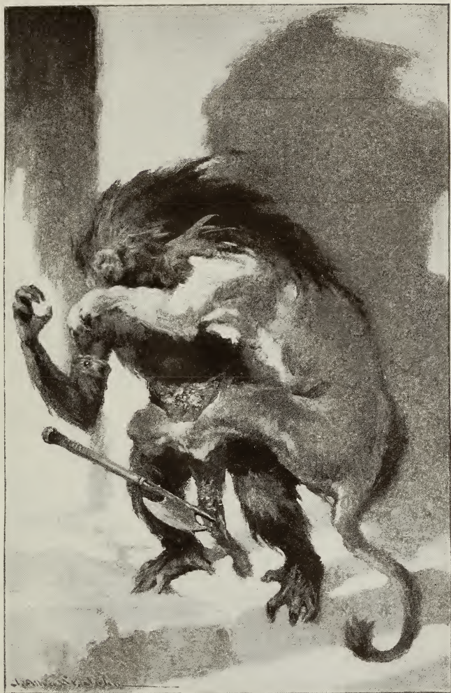
The Golden Lion with two mighty bounds was upon the High Priest