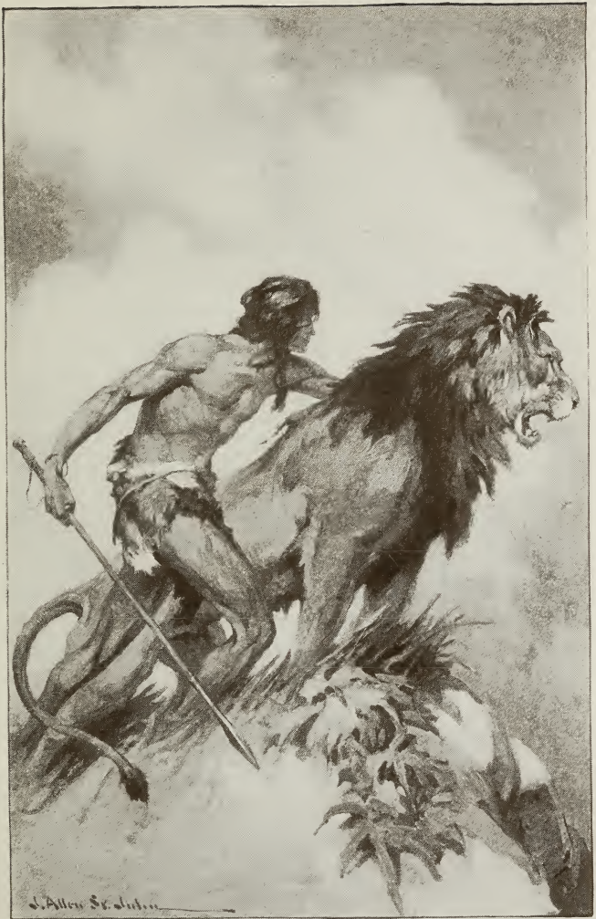
Hunting together, the man and the great lion trod the paths toward home