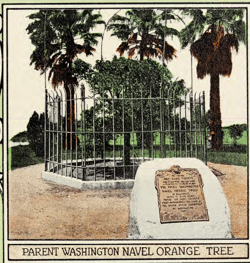
PARENT WASHINGTON NAVEL ORANGE TREE

Head Office 657 W. 8 th St. RIVERSIDE, CALIF.