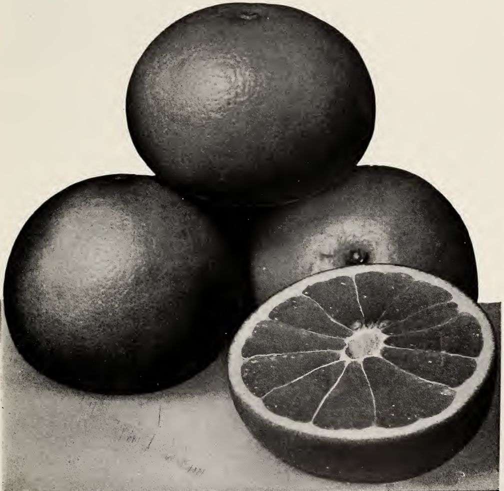
Typical Marsh Seedless Grapefruit

Remember—quality, reliability and our reputation are behind every order.