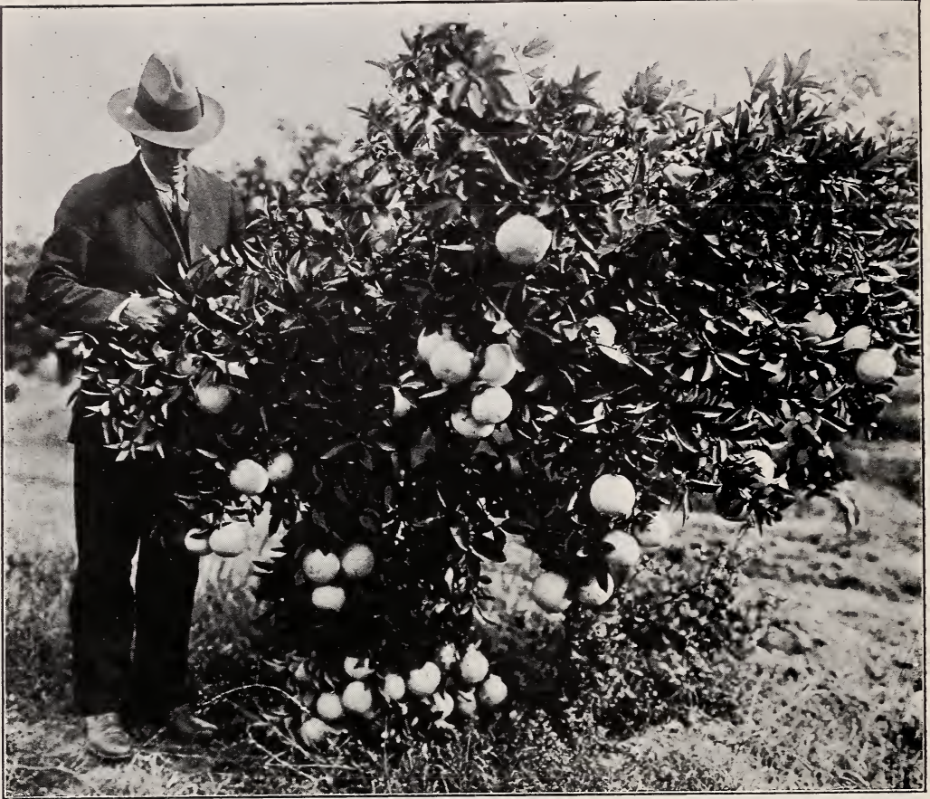
Marsh Seedless Grapefruit Tree, now two years old growing on the Yuma Mesa, Arizona, furnished by the Tetley Nurseries. This shows the prolific bearing qualities of bud and root stock selection.