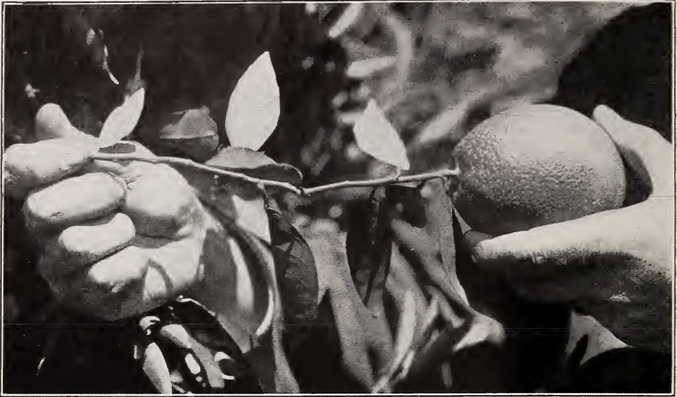
Typical fruit-bearing bud stick showing pedigreed bud wood