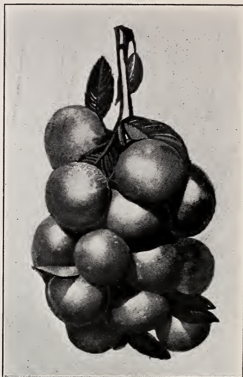
Cluster Satsuma Oranges

The following yields and returns are given as an indication of what the Satsuma is doing. In 1922, 6500 trees in their third year yielded 1975 boxes of marketable fruit, or practically 1/3 box per tree. One 4 1/2 acre grove gave a return of $3500.00, with the average price of $3.00 per box. This is an average of a yield of 259 boxes per acre, and a gross income of $777.00 per acre. This was a ten-year-old orchard. In another ten-acre grove, a return of $10,000.00 was received. In the