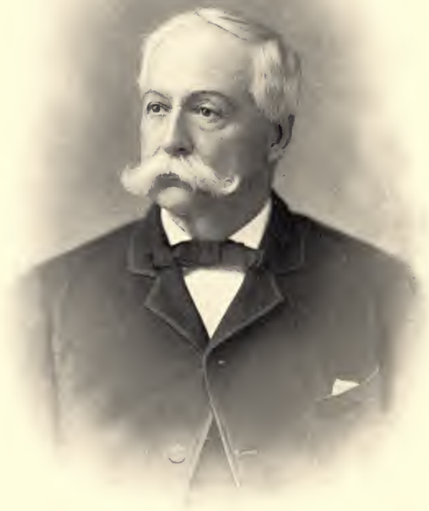
J. W. DeForest (1892)