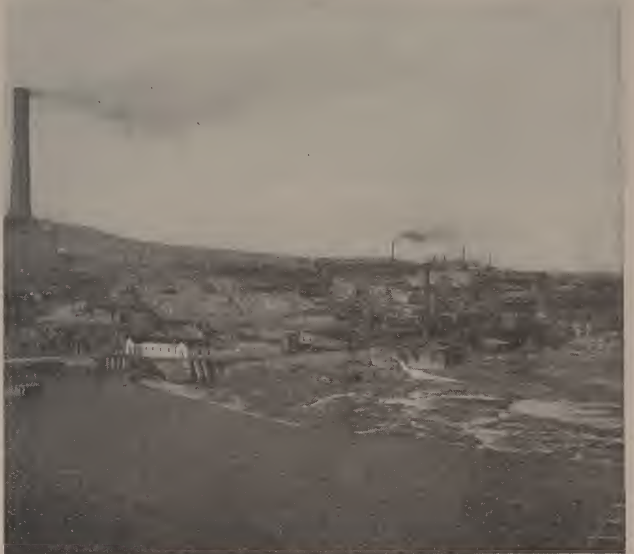
Fig. 15. — Electrolytic refining plant, zinc plant, and wire and rod mills at Great Falls

Lead ores are found, but most lead produced in Montana comes as a by-product in smelting and refining other ores. A large part of the silver now produced also comes as a by-product, though one of the world's largest silver mines is at Butte. Most of the gold and platinum are also by-products. Sulphuric acid is the most important by-product. A few important mining by-products