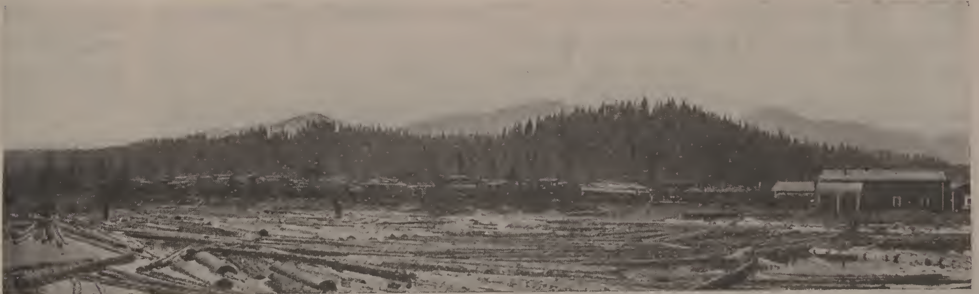
in western Montana

Facts to be especially well fixed. — 1. The transcontinental railroads which cross the state. 2. The important manufactures of Montana.