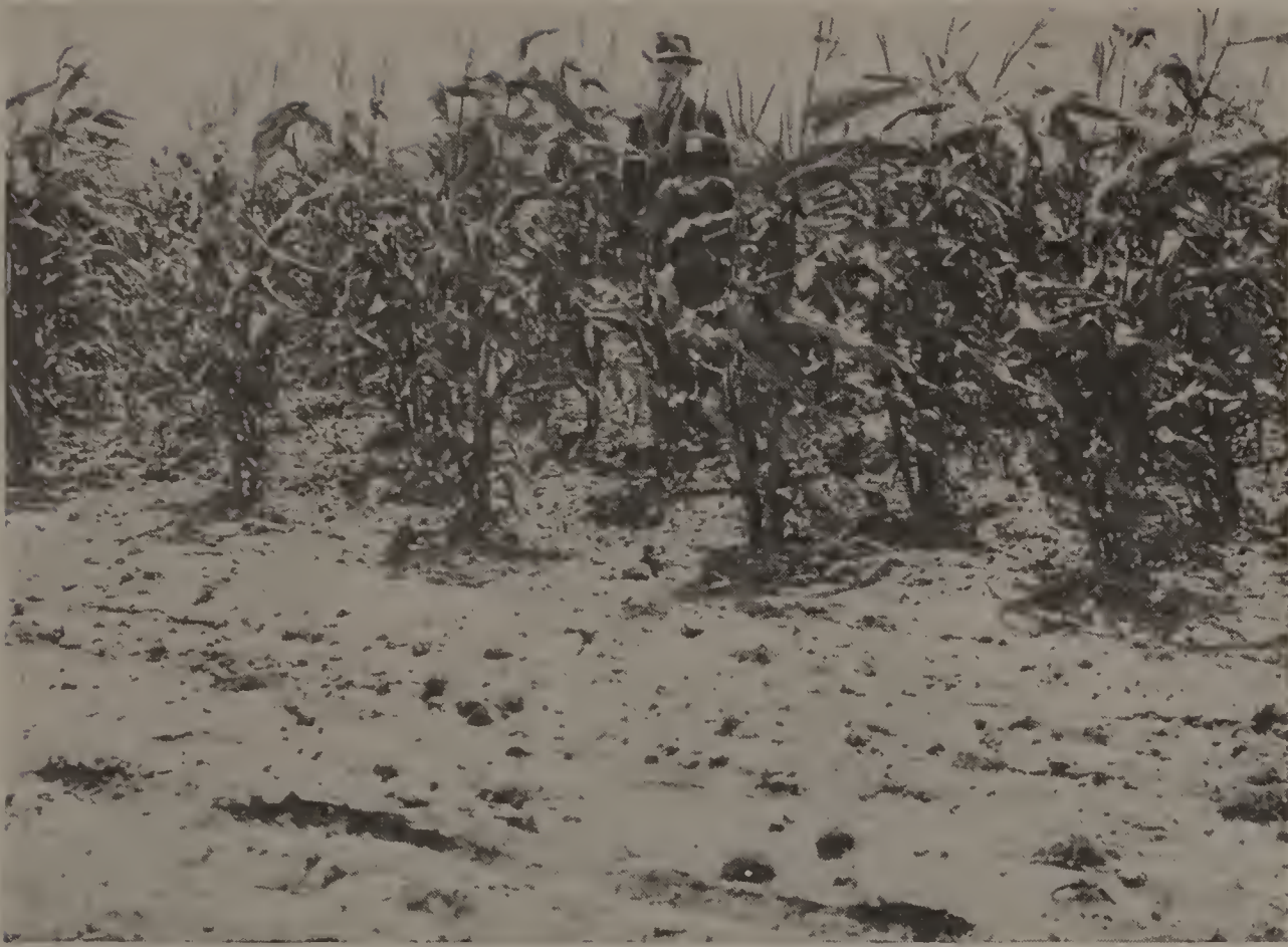
Fig. 23. — A cornfield in eastern Montana

cessful than those on the lowlands. Land lying immediately east of mountain ranges is seldom satisfactory for dry farming.