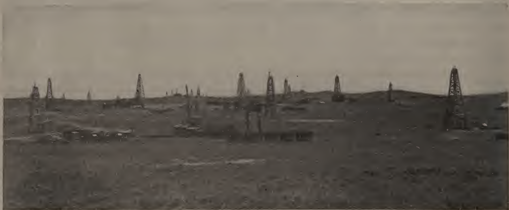
Fig. 17. — West end of Cat Creek oil field, eastern part of Fergus County

Oil wells in Montana (Elk Creek Basin) produced nearly 100,000 barrels in 1917. In 1920 the total production in the state was 336,000 barrels; in 1921, 1,435,000 barrels; and in 1922 more than 2,000,000 barrels. In 1923