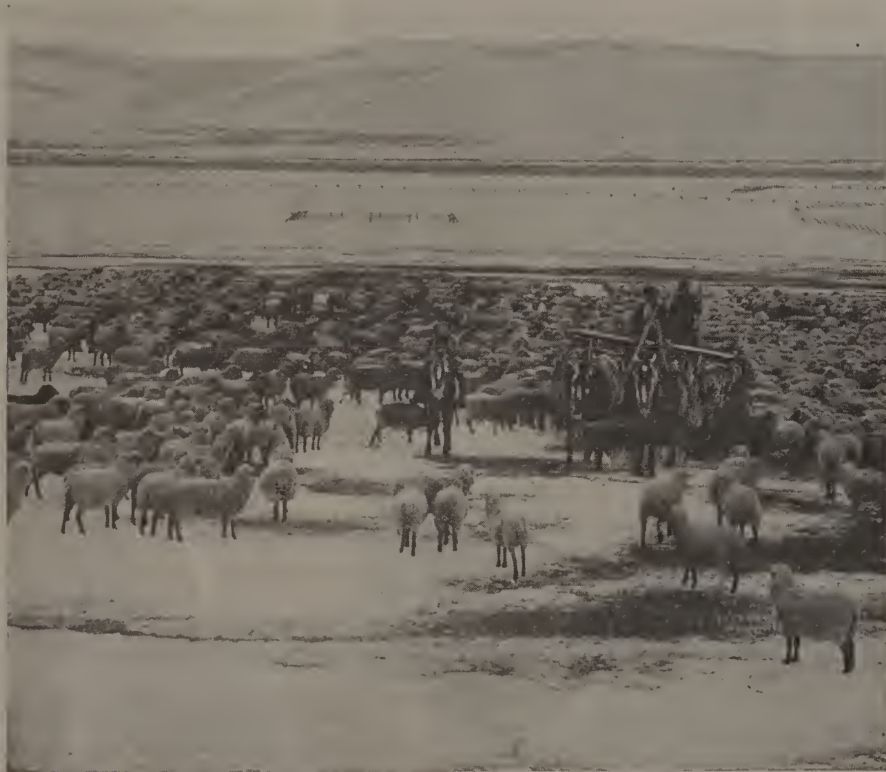
Fig. 7. — Feeding wild hay in a valley too high for agriculture

the native grass cures into hay without being cut. Both cattle and sheep may winter