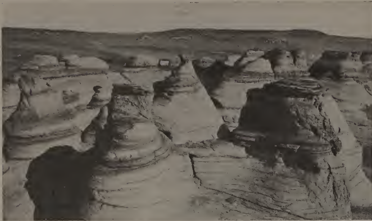
Fig. 3. — In the Bad Lands

The highest range, the Beartooth, includes Granite Peak (altitude 12,850 feet), the highest point in the state. Most of the mountainous section of the state has an elevation in excess of 5000 feet, though many valleys are much lower. According to the United States Geological Survey the lowest point in Montana is in the Kootenai Valley, 1800 feet.