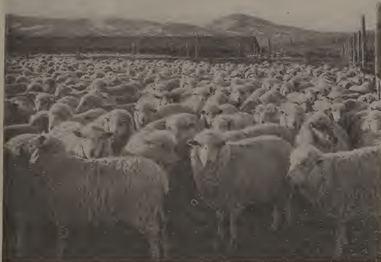
Fig. 27. — On a sheep ranch in Beaverhead County