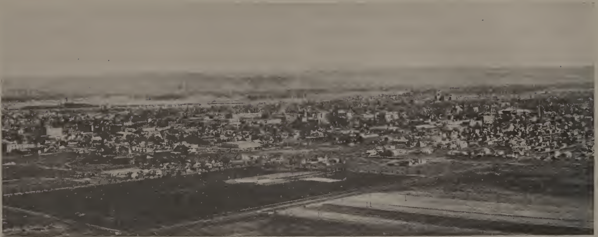
Fig. 34. — A general view of Billings

and distribution point for a large section of southern and eastern Montana.