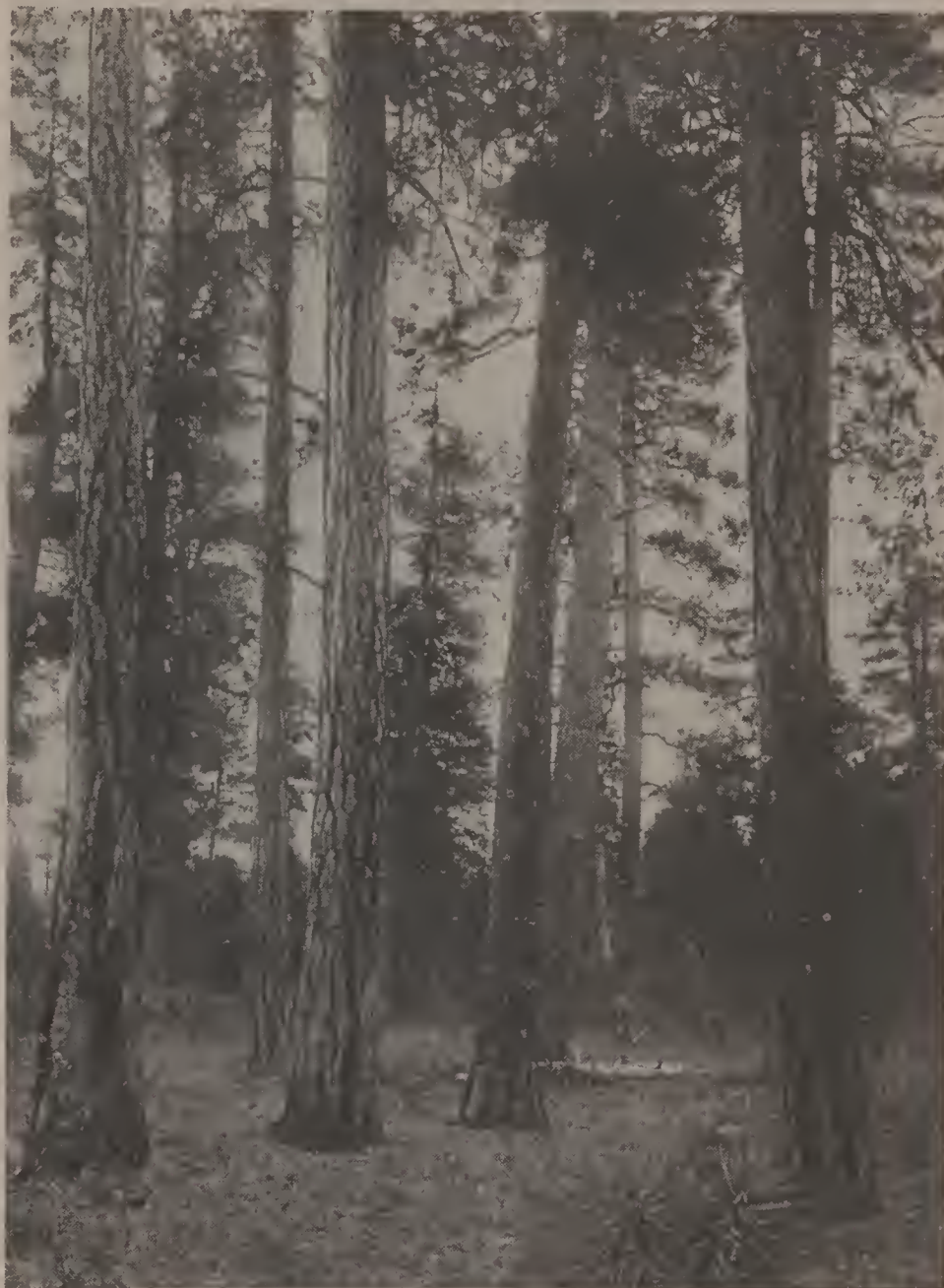
Fig. 6. — A forest near Libby Can you name these trees?