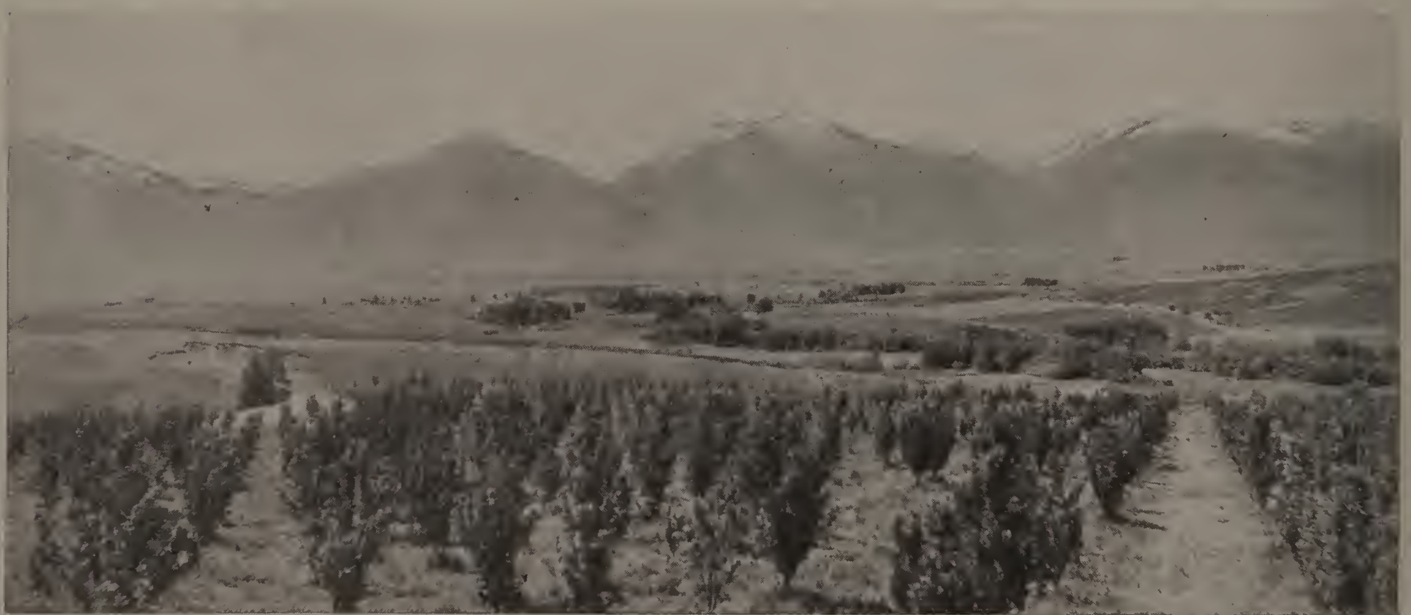
Fig. 4. — A sweet cherry orchard in the Bitter Root Valley

Contrast this scene, typical of western Montana, with Fig. 2.