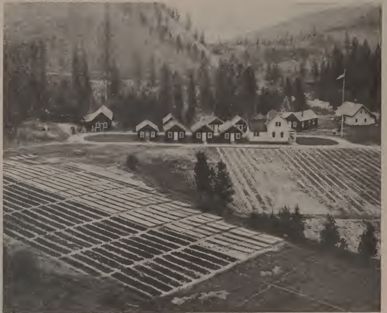
Fig. 10. — A forest-tree nursery in Lolo National Forest

Land suitable for agriculture is open for settlement. Sites suitable for water-power development may be utilized, but the government does not permit any one to acquire a monopoly of such power or to hold sites without developing them. National forests are valuable for grazing. Forest reserves are the most extensive control exercised by the United States in the interest of conservation, but there are Indian reservations, bird reserves, a bison range, and others designed to conserve mineral resources. Why does the national government control these? (See main text, pages 215-224.)