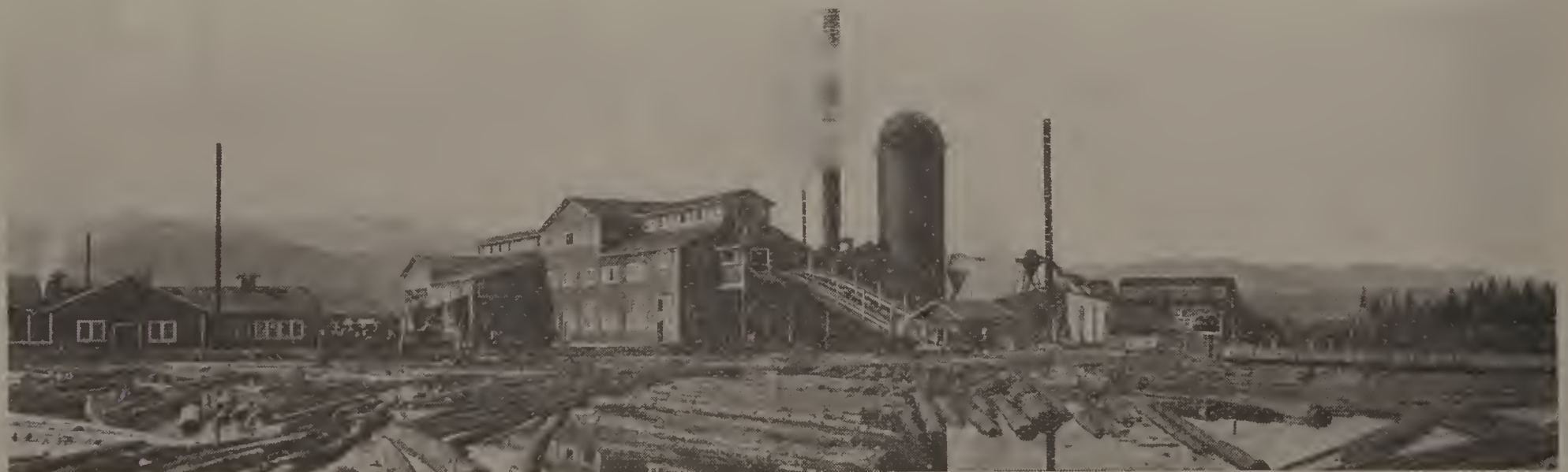
Fig. 31. — A lumber mill