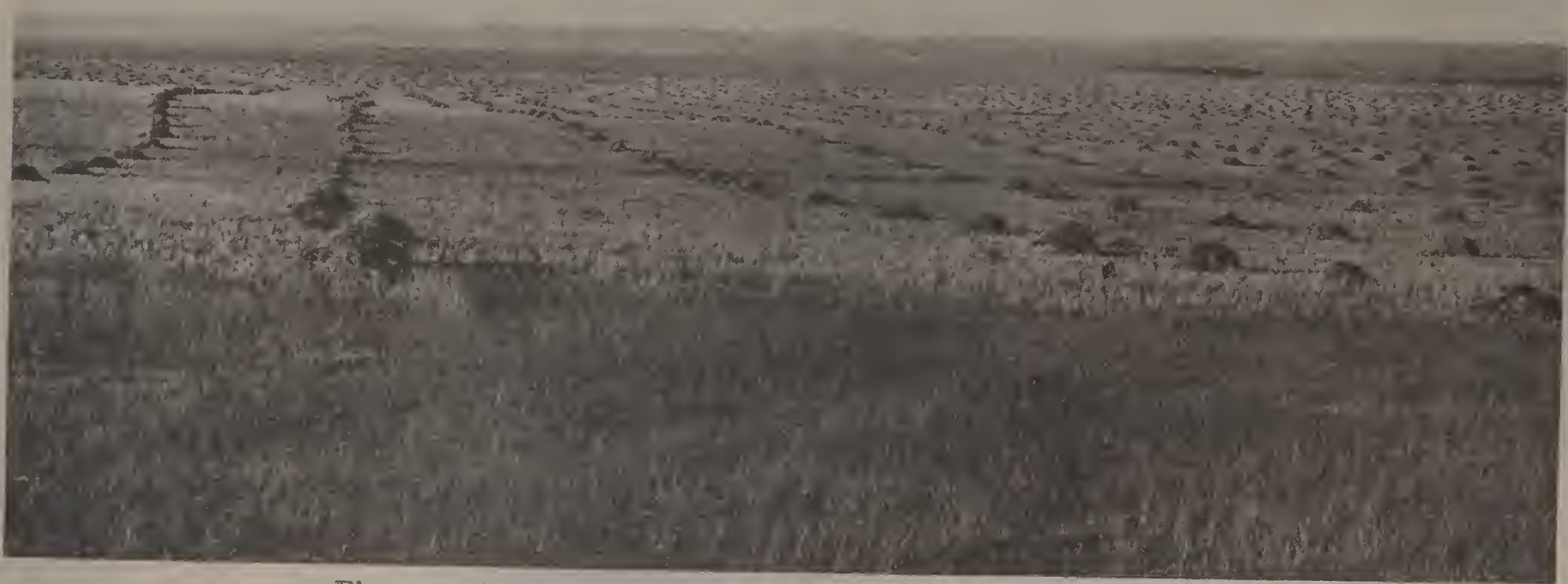
Fig. 2. — A nine hundred acre wheat field in eastern Montana

Here you see a typical eastern-Montana landscape — gently rolling farm land with hills in the distance.