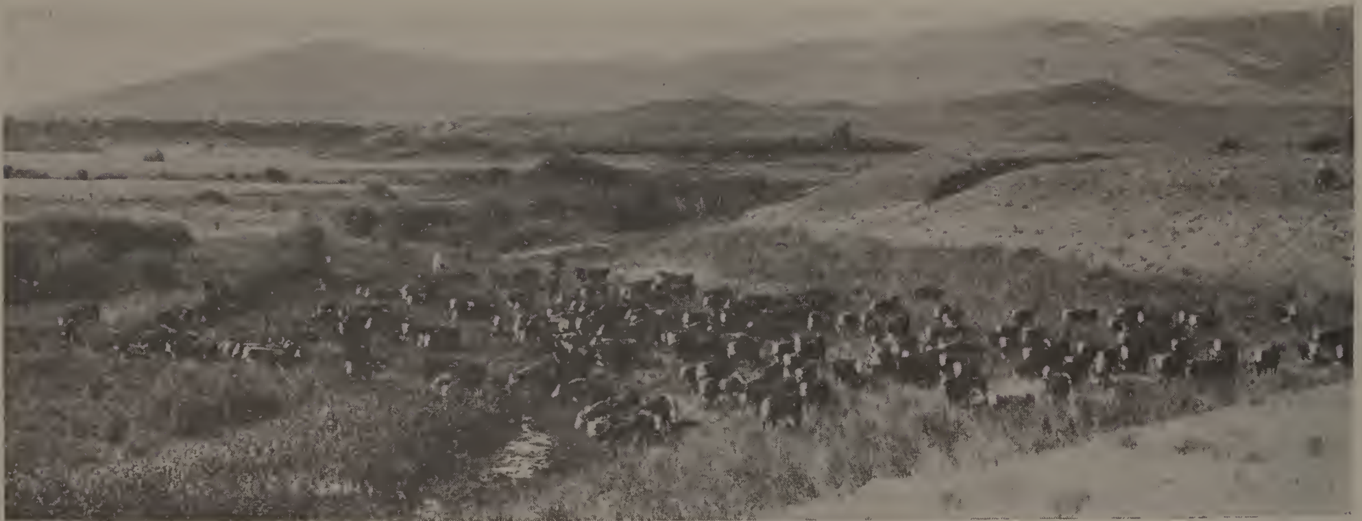
Fig. 26. — Grazing land, where plains and mountains meet in central Montana

to supply milk and butter to the increased population of our cities, and many of the large ranches are as large as ever. In fact in some parts of the state, both in the cattle and sheep industry, the largest ranches seem to be increasing in size.