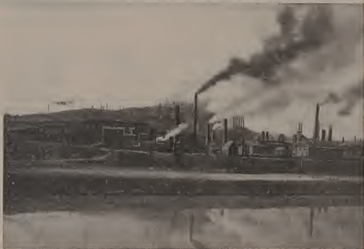
Fig. 33. — Copper mines at Butte

GREAT FALLS (24,121) derives the name from its location near the "great falls" of the Missouri River. It is the most important railroad center of northern Montana. Its water power, the coal fields